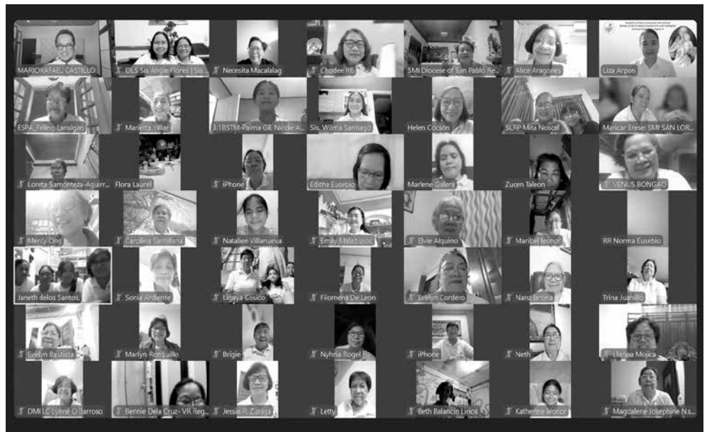
A screenshot of recollection participants