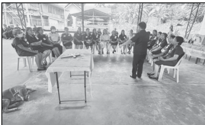
The exemplification ceremony

By close to sunset, the visiting DMI sisters boarded the boat taking them back to Zamboanga City, their mission for the day successfully accomplished.