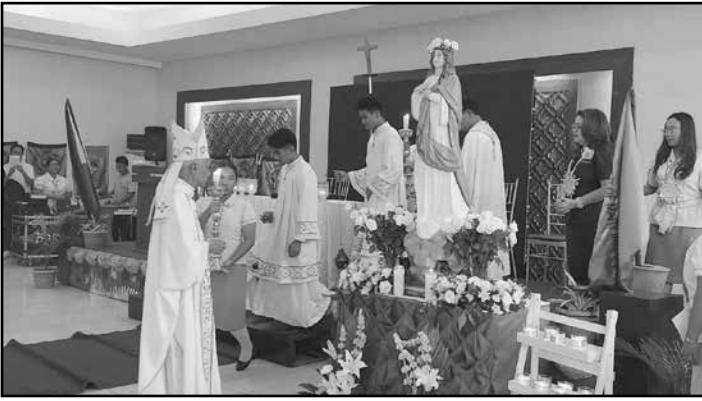
Bishop Patricio Abella Buzon, SDB of the Diocese of Bacolod prays before the Blessed Mother's altar before celebrating Holy Mass.