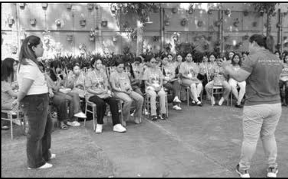
A team-building facilitator gives instructions before the start of the team-building session.