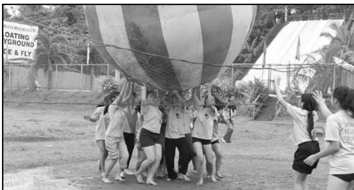
A team carries a giant ball preventing it from falling on the ground.