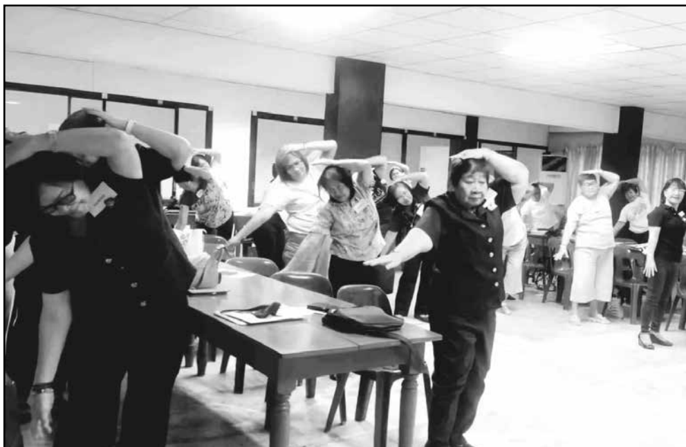
The seminar participants during an ice-breaker exercise