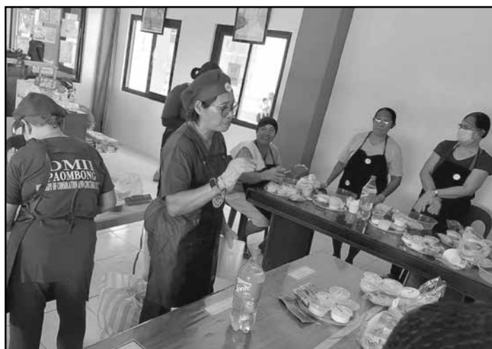
The livelihood training in session

an alternative fare for the family table as well as an alternative source of income, in time for the opening of school when children would bring their baon .