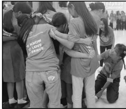
Squirettes' team-building exercises