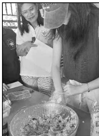
A demo on embotido-making

These livelihood programs provide economic opportunities and support, leading to increased self-reliance and improved social status. The programs usually focus on capacity-building, skills development and access to resources like loans or market opportunities. Having their own income help uplift their status, thus breaking down traditional gender roles and promoting equality.