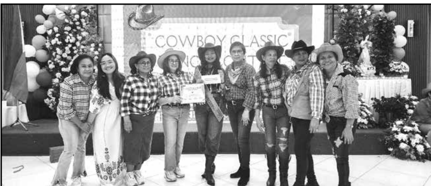
'Cowboys' during Rodeo Night