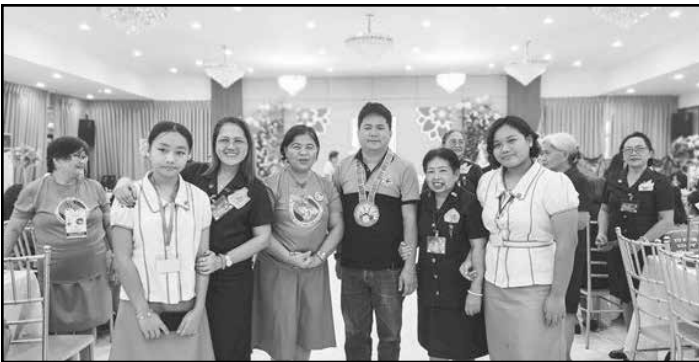
City Mayor Jay Warren Pabilaran of Malaybalay City, Bukidnon is welcomed to the conference.