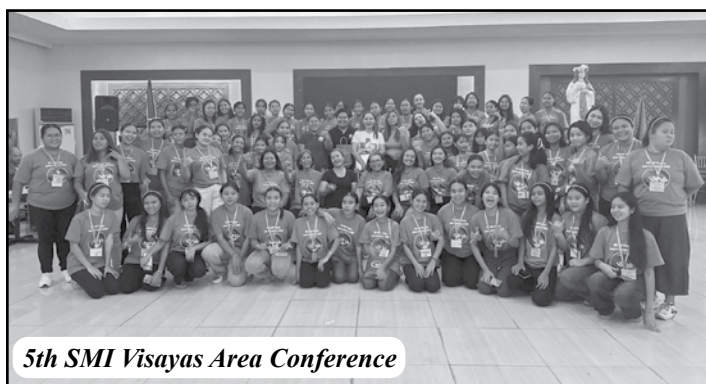
5th SMI Visayas Area Conference