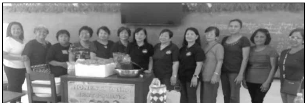
The participants in the seminar-workshop.