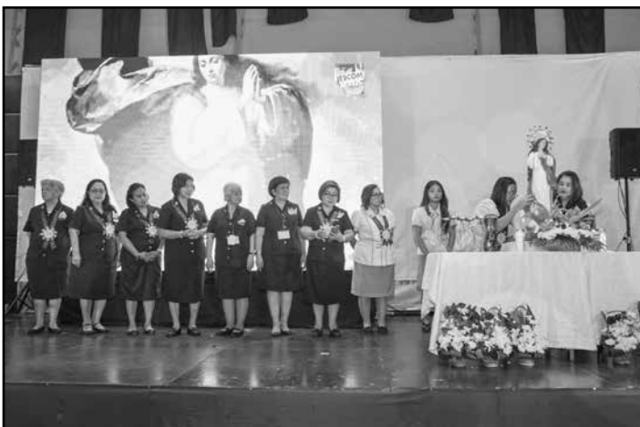
DMII and SMI officers stand beside the altar of the Blessed Mother during the enthronement ceremony.