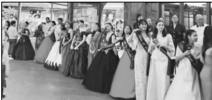
The Santacruzán sagalas