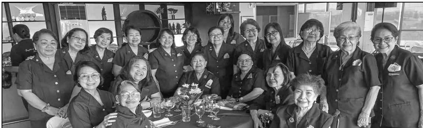
The event sponsors, the DMI Risen Christ Circle members