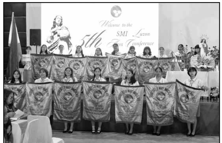
The Parade of Circlettes