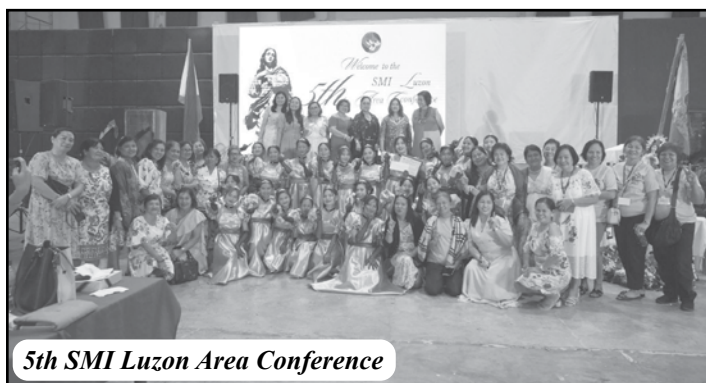
5th SMI Luzon Area Conference