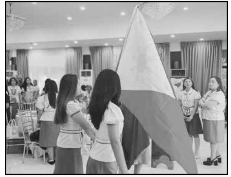
The Parade of Colors