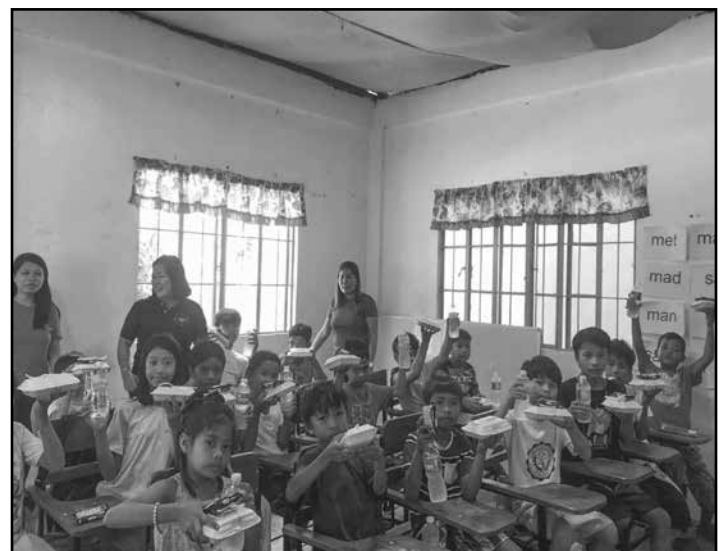
Nutritious meals served by the DMI sisters to the remedial pupils of San Francisco Elementary School.

efforts of the La Resurreccion Circle to serve the community. In the coming months, the circle looks forward to expanding its outreach programs that include educational support initiatives, medical missions and other community-driven projects.