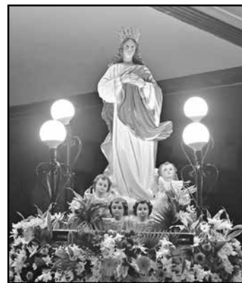
The flower-bedecked carroza of the Blessed Mother