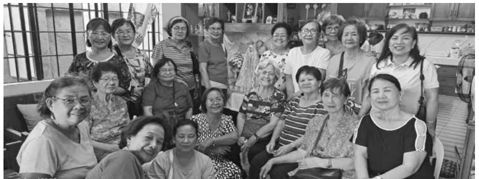
The DMI sisters join members of the household during one of the May Block Rosary devotions.

The daily activity not only honored our Blessed Mother but also served as a spiritual anchor for the community that reinforces bonds among neighbors and fosters a culture of prayer, unity and shared Catholic values.