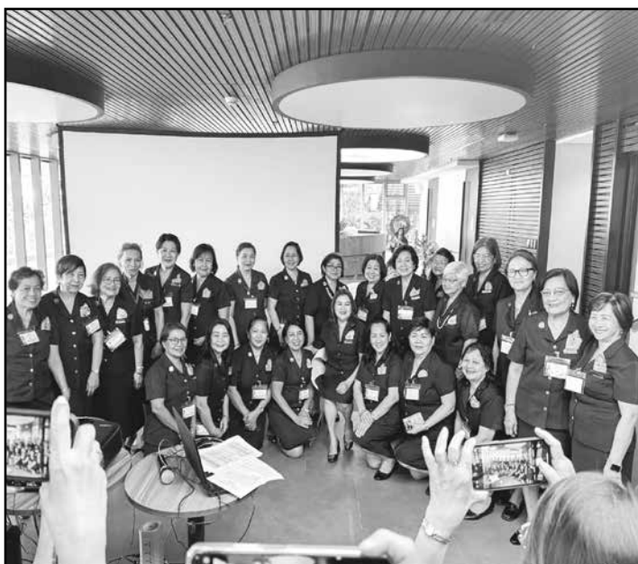
Region V Diocesan Officers of Antipolo and Imus during the orientation held at Unilab Bayanihan Center.