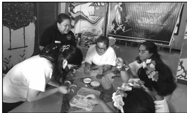
The residents of Tahanan Sta. Luisa with the visiting DMI sisters. The rosary-making workshop