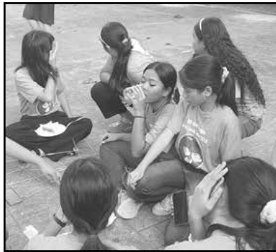
A team starts work to achieve the team's goal.