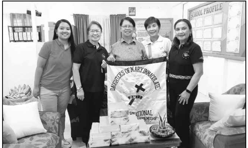
DMI sisters turn over their donation to the officials of Dapdapan Elementary School.

The Brigada Eskwela is a nationwide initiative of the Dept. of Education that encourages community involvement in preparing public schools for the upcoming academic year. Through volunteerism and donations, the program fosters the spirit of bayanihan or Filipino communal unity.