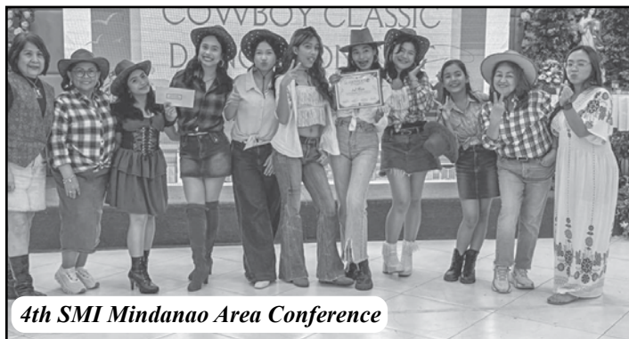
4th SMI Mindanao Area Conference

The Area Conferences of the Squirettes of Mary Immaculate (SMI) for Luzon, Visayas and Mindanao were successfully held on separate dates and venues during the summer of 2025 as follows: