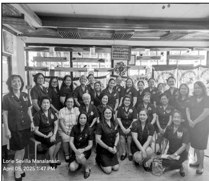
Vicariate officers of Puerto Princesa and Taytay, Palawan