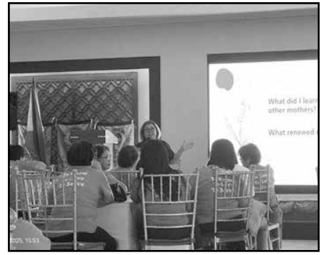
Tita DMIs have their own workshop while the girls are outdoors.