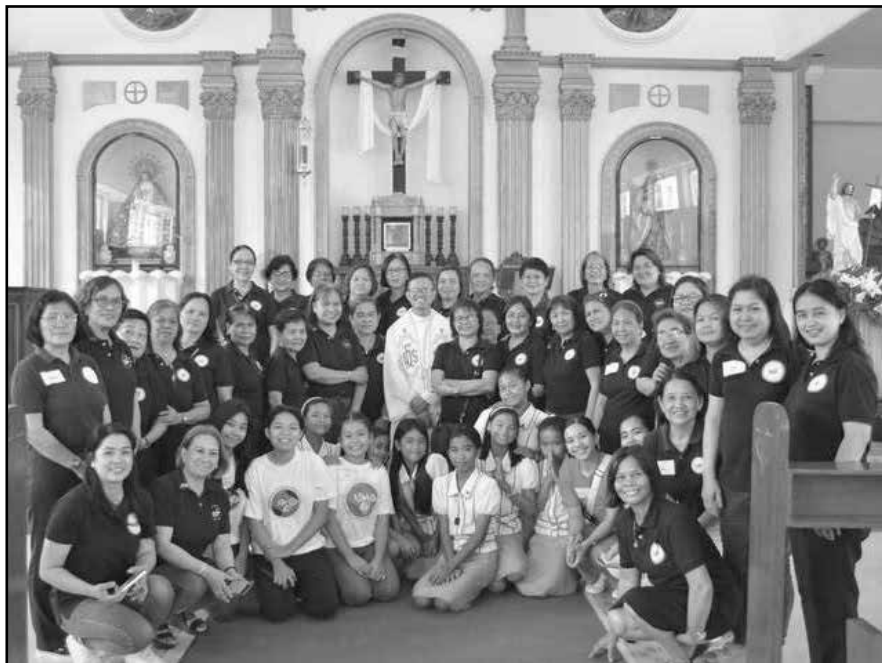
The participants of the Vicariate I Assembly

The assembly fostered a deeper sense of unity, purpose and commitment among the circle members in Vicariate I.