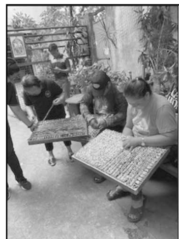
Women participants busy at rug-making