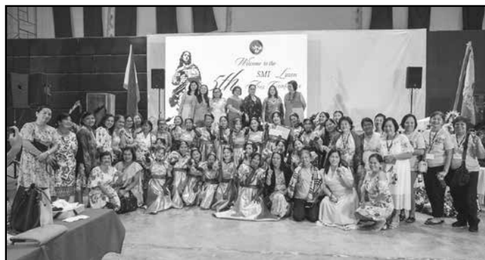
The delegates in a group photo during Fellowship Night. The night's sub-theme is Bridgerton Soiree.