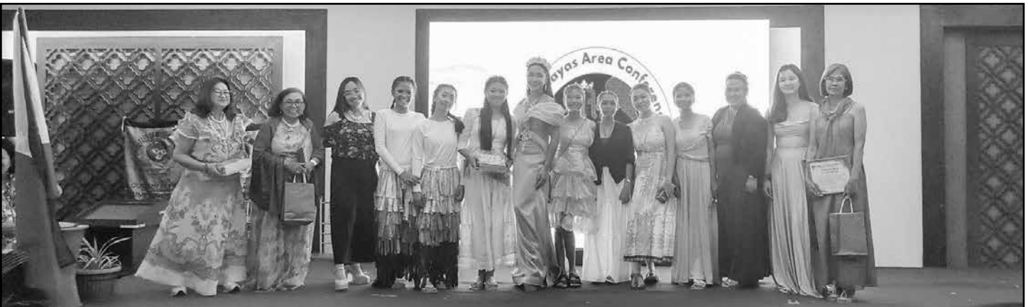
The Tita DMIs and Squirettes in their Ocean Odyssey costumes.