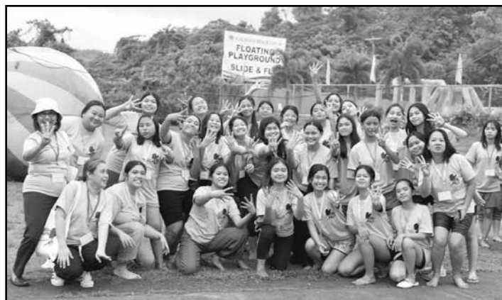
The Squirettes pose for a group photo before the team-building session starts.