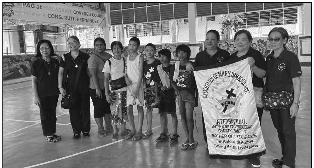
The DMI sisters with some project beneficiaries

The DMI sisters also provided meals and snacks to the volunteer doctors and others who helped during the activity. This project showcased the Mother of Life Circle's and the community's commitment to improve the lives of vulnerable children and their family.