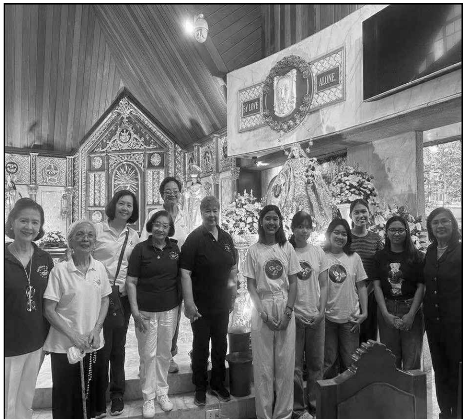
Theresian Circle DMIs and SMIs lead prayers in the church.

Sagalas representing various organizations graced the event with their elegant attire symbolizing the virtues and titles of Mama Mary. The Theresian Circle sisters and the Squirettes led in the recitation of the Holy Rosary, offered flowers during the Mass and joined the procession afterwards.