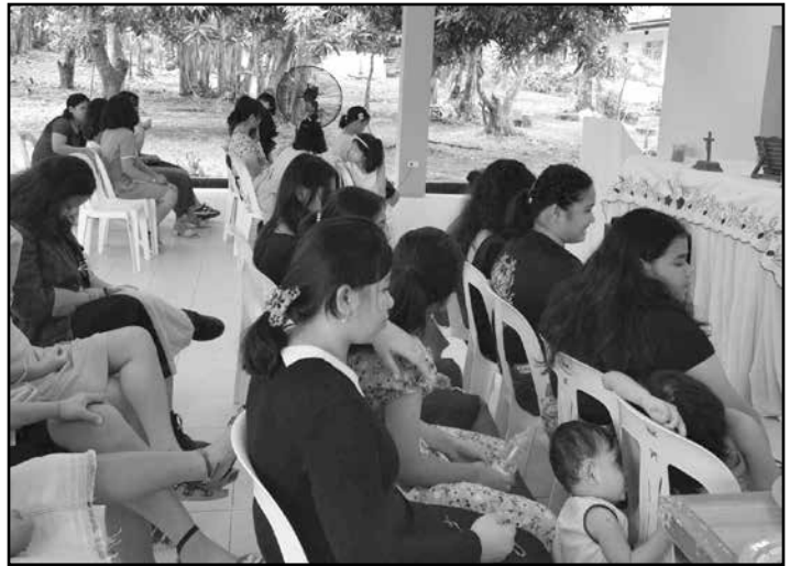
The girls at the Crisis Center hear Mass on Ascension Sunday.

The girls, residents of the facility, enjoyed the platefuls of pancit, fried chicken and ice cream that the DMI sisters brought. Their smiles were a testament to the joy that a simple act of kindness can bring.