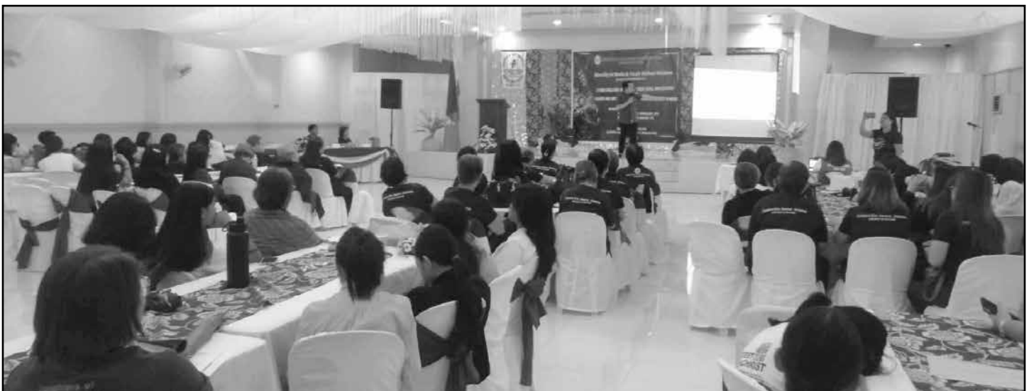
The seminar participants