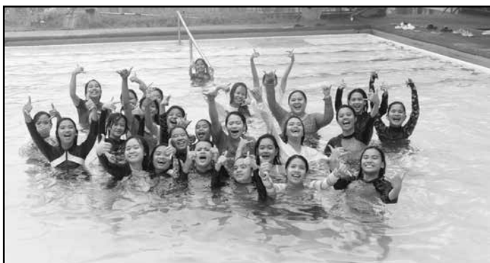
A group of Squirettes enjoy the cool waters of the pool.