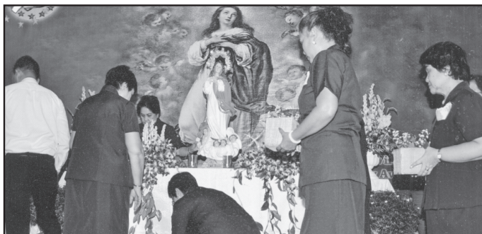
Floral offering by members of the International Board