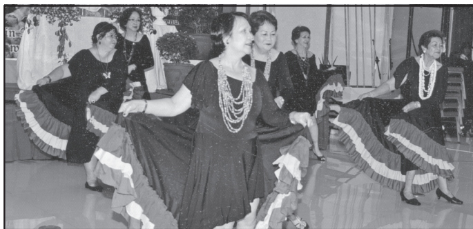
A presentation by Region VI, the host region.