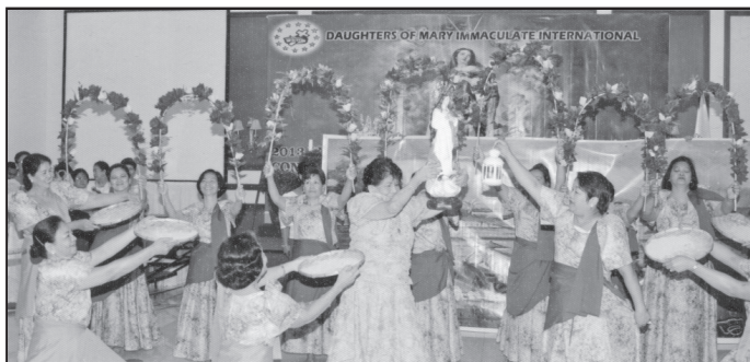
Region III's "Pagtatanim" won the Best Regional Attire and 2nd Best Presentation.