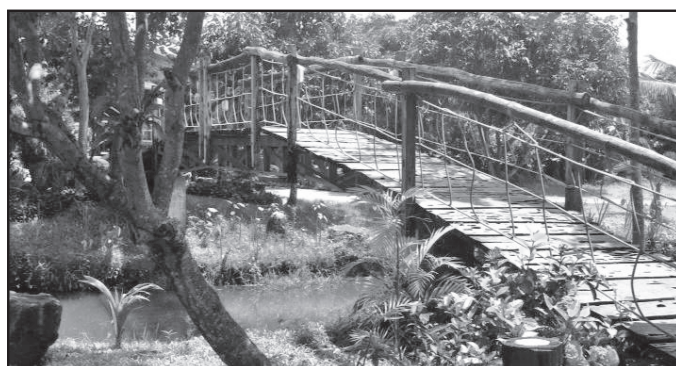
A pathway at Lola Corazon's Leisure Farm