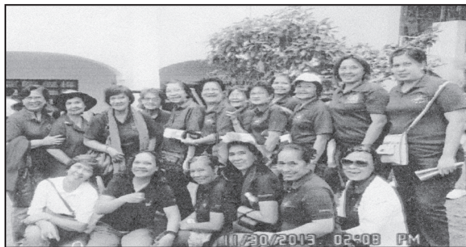
The DMI sisters in a group photo before the start of the pilgrimage.