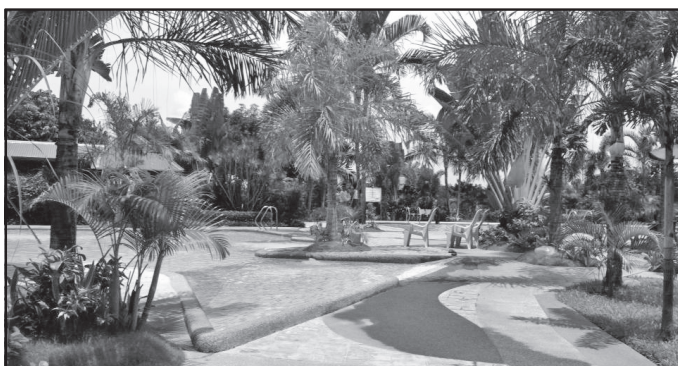
A view of the poolside