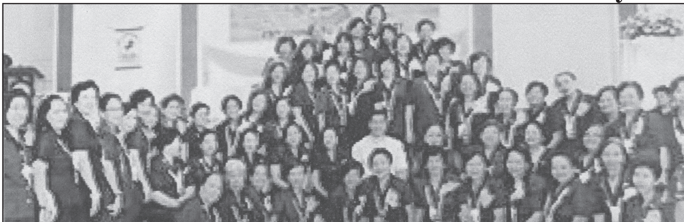
A group photo of Bukidnon DMI sisters.