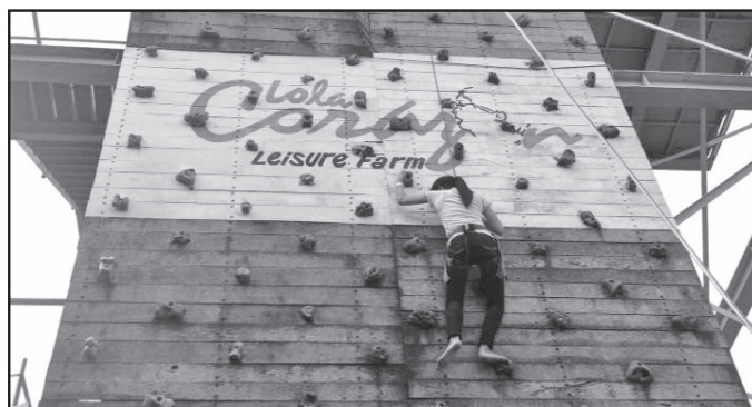
Wall-climbing is an exciting activity that awaits SMI conference delegates.