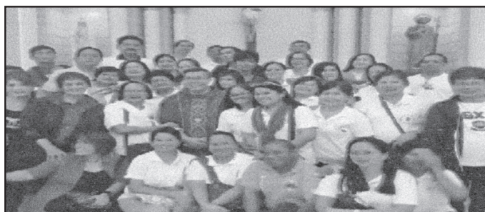
The DMIs and other members of the Bataan congregation accompany the image of the Virgen Milagrosa del Pueblo de Orani during the Marian Grand Procession.

Eucharistic Lord in Mega Atrium before proceeding to Intramuros. The Marian Grand Procession is an annual undertaking by the Confrada de Immaculada Concepcion . Participation in the procession has become an annual pilgrimage for the DMIs of Bataan.