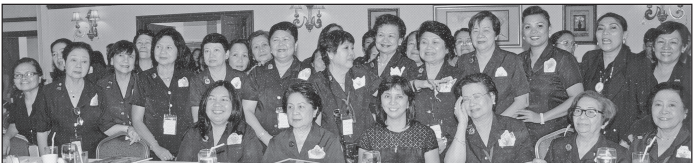
Congresswoman Robredo with the DMI International Officers and Board