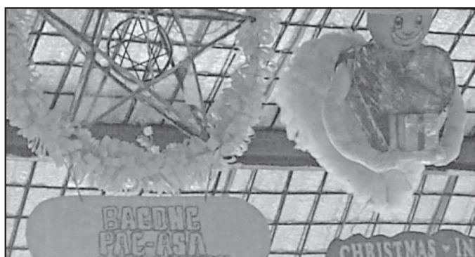
Christmas lanterns made by the Molave Youth Home residents.

message that said: "Christmas in Our Hearts", stressing to the youth that Christmas happens in the hearts of men where God should dwell. The central message of his homily was PASKO: PASOK KRISTO SA BUHAY KO! exhorting everyone to have a more meaningful Christmas.