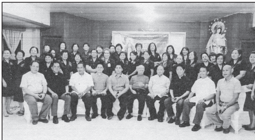
The priest-honorees with the officers and members of the Sts. Peter and Paul Circle.

During the program, the priest-honorees rendered a surprise number, a medley of songs to the delight of the DMI sisters who responded also with a special song number.