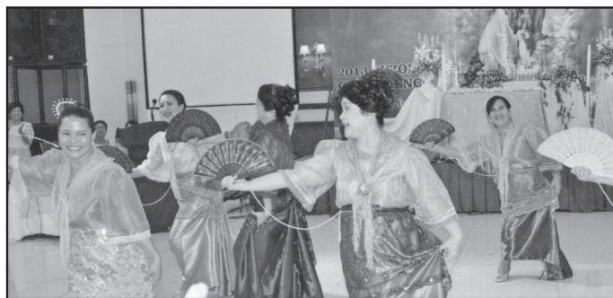
"Balce Marikina" by Region V won first prize for Best Presentation.