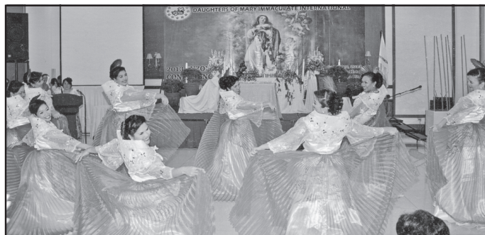
Region VII won the Most Authentic Attire and 3rd Best Presentation with "Sayaw sa Anahaw".

coming into her own, since 2013, as Congresswoman for the Third District of Camarines Sur.