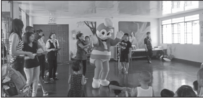
A Jollibee mascot entertains the children as the DMI sisters look on.