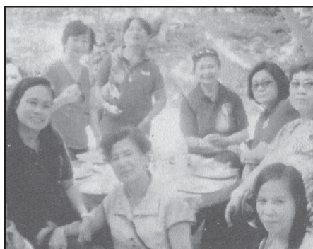
Assembly hosts from the Mater Immaculata Circle take a breather with their guests from the International Board after the assembly.