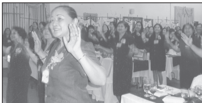
Assembly delegates enjoy an unfreezing exercise.