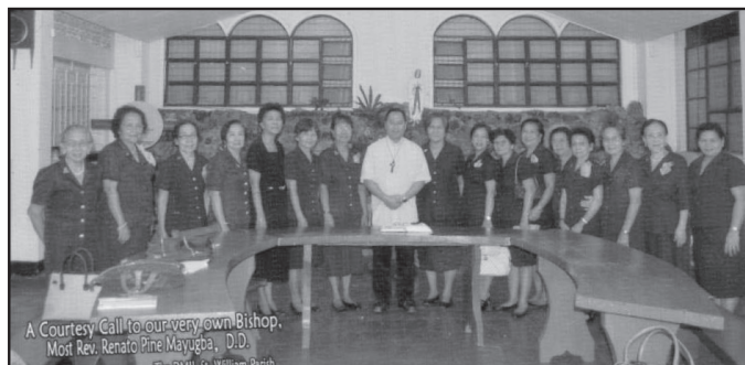
The Our Lady of Good Counsel Circle with Bishop Renato Mayugba during their courtesy call.

Bishop Mayugba commended the circle for fulfilling its missions and for