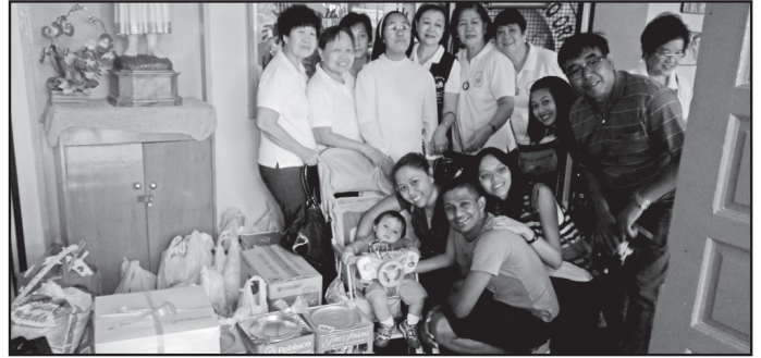
The DMI sisters turn over their donations to the orphanage staff.