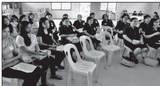
Symposium participants listen intently to the speakers' presentations.

missions. The mood was family-like where everyone felt accepted, welcomed and at ease with the speakers. Certificates of appreciation and simple tokens including rosaries made by the sisters of the Sto. Nino de Molino Circle were later given to the guests.