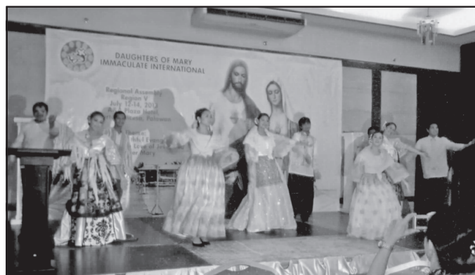
The Capitol Performing Group of Palawan during their cultural presentation.