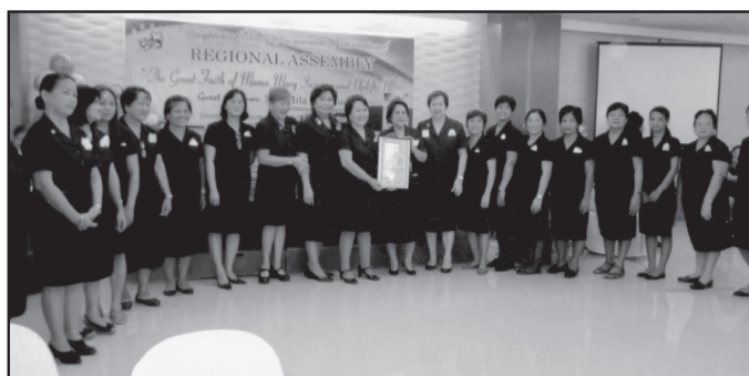
The San Isidro Labrador Circle formally receives its DMI Charter during the assembly.