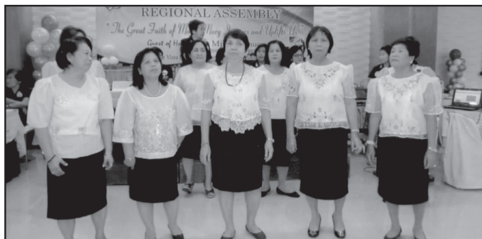
Intermission numbers by the St. Gabriel de Archangel Circle and the SMI Rosa Mystica Circlette.