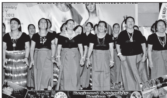
DMI sisters of Palawan showcase the art and culture of their province via songs and dances.