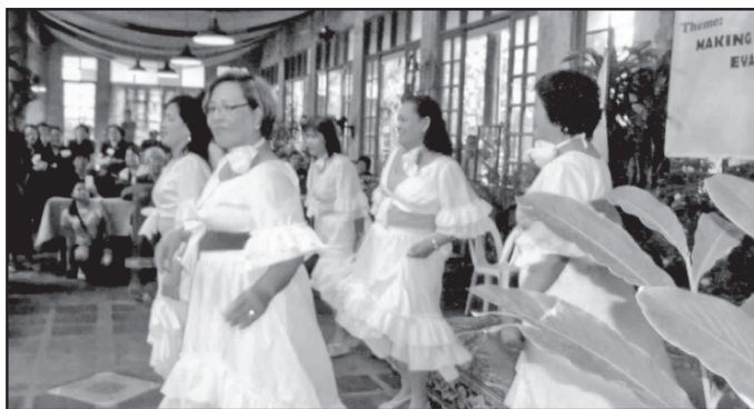
An intermission number by the Marian Circle of Lian, Bastangas.