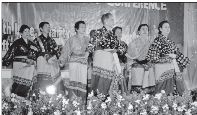
Dance presentations by DMI sisters of Region XII during FellowshipNight.