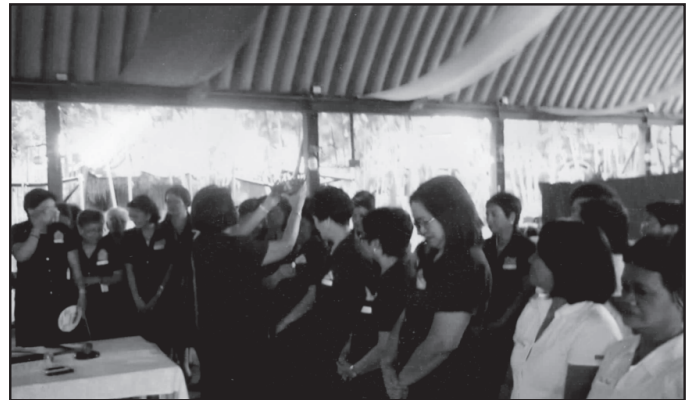
The charter members of the Mary Immaculate Circle during the exemplification ceremony.