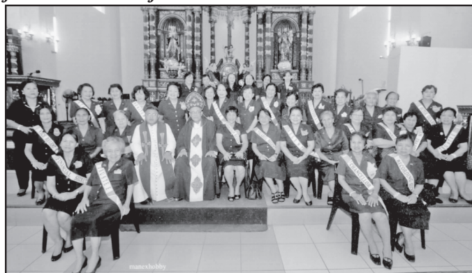
The officers and members of the Our Lady of Peace Circle, the host circle of the Mindanao Area Conference.

given to her by sisters from her circle helped a lot in easing the pain of her loss. She suggested that circles introduce bereavement ministry in their respective parishes.