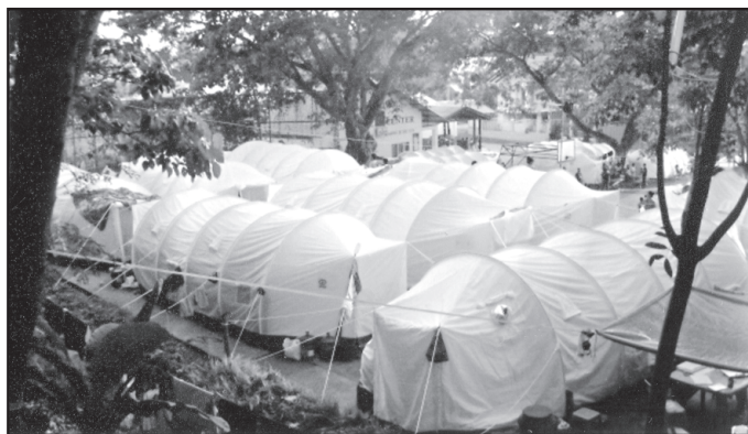
A tent city for Sendong victims

Dear God, these duties do not end here . . . for when You answered my prayer to make the remaining years of my life truly meaningful, You did not tell me: "It ends today".