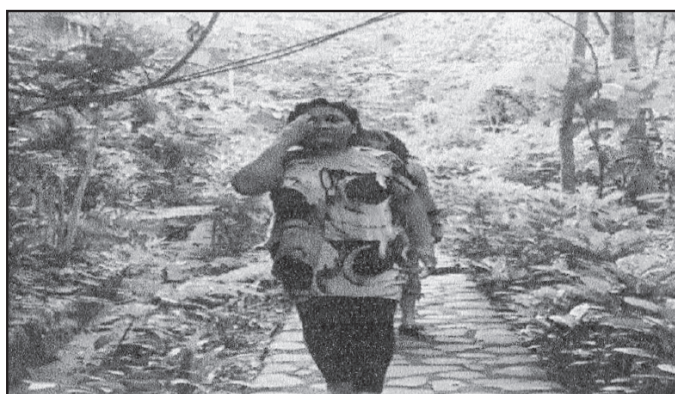
Our trek through a wooded path to Bulong ng Simoy Formation Center.