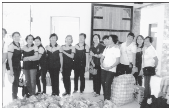
DMI sisters prepare relief packages for distribution.