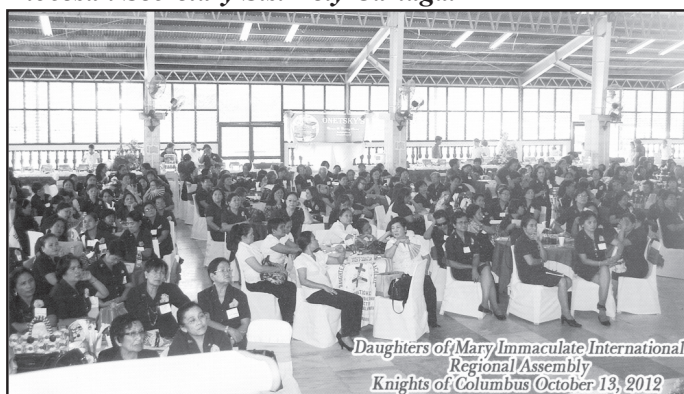
DMI sisters who attended the Regional assembly