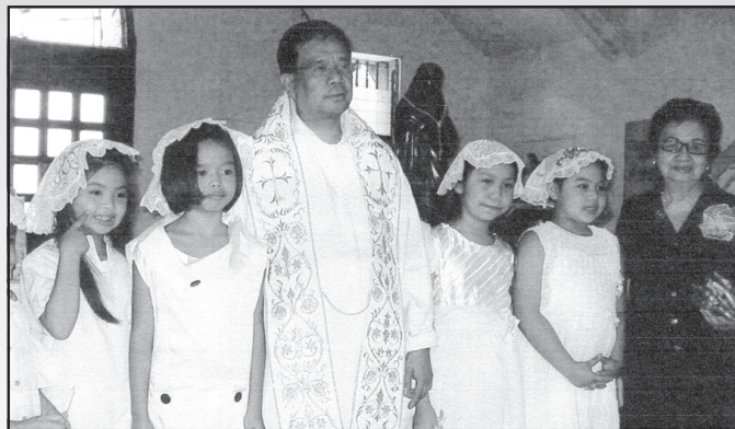
OUR LADY OF RANSOM CIRCLE I CONDUCTS BASIC CATECHISM