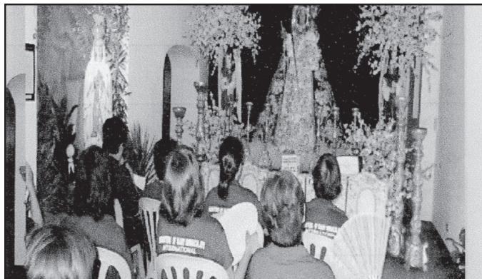
DMI sisters from various circles in the Diocese took turns in keeping daily vigils during the Marian Exhibit.

A Eucharistic celebration at the Cathedral of St. Joseph in Balanga City officially closed the Marian Exhibit on September 11, 2012.