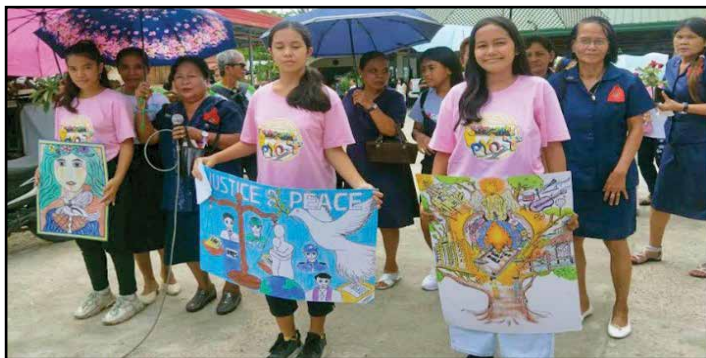
To celebrate the Season of Creation, the St. Isidore the Farmer Circle held a Walk for Nature in Villahermosa, Negros Occidental last Sept. 30, 2023.