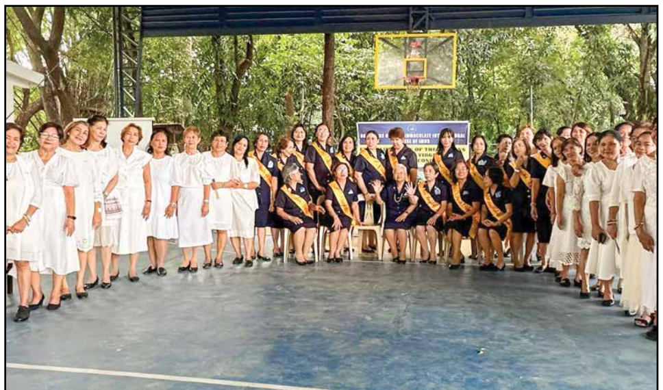
The exemplified DMI sisters with the Exemplification Team