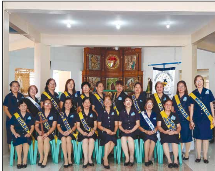
The newly installed officers of Inay Maria Magnificat Circle