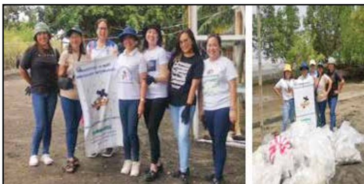
A coastal clean-up was undertaken by the St. Anne Circle at Old Sagay Beach Resort in Sagay City on Sept. 22, 2023.