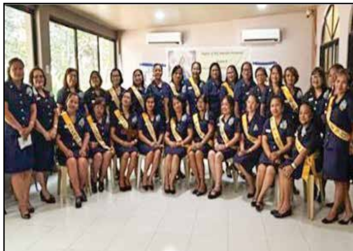
The charter members of Our Lady of the Holy Face Circle