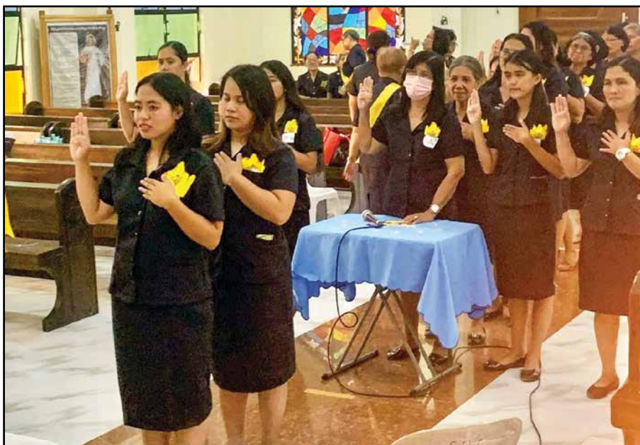
The charter members of the new circle take their oath during the exemplification rites.

The Our Lady of Purification Circle plans to organize three more circles to complete its goal of forty circles in the Archdiocese by the time it celebrates its 41st anniversary.