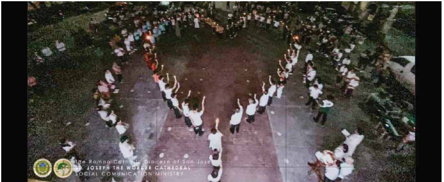
The living rosary formation