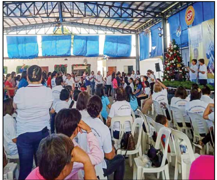
The Family Day Encounter held at the covered court in Sta. Maria, Bulacan.