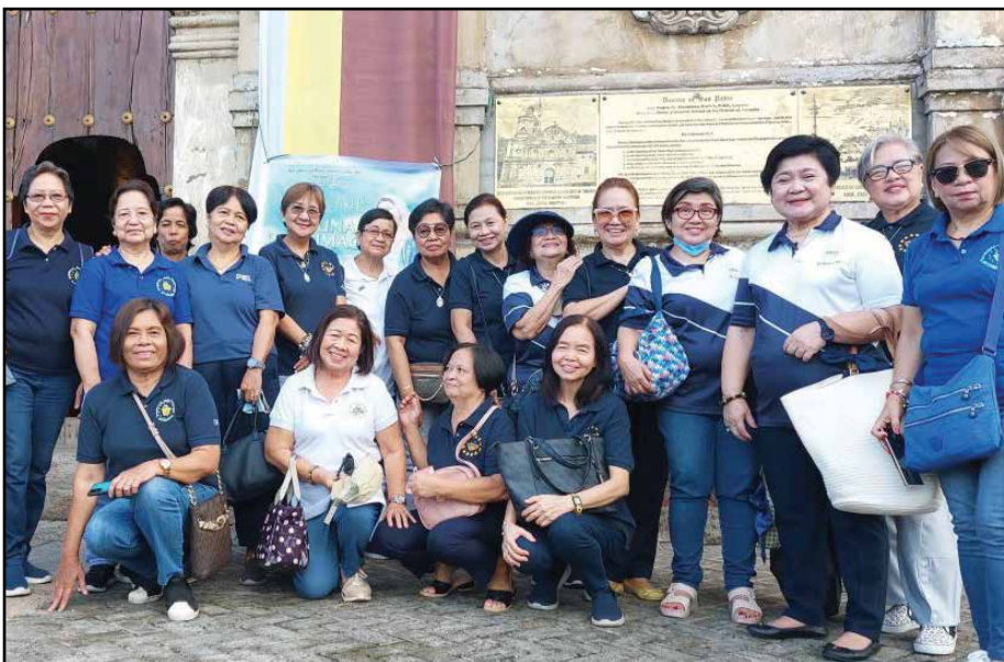
The pilgrims meet with the Region VI hosts at the first church visited, the Diocesan Shrine of the Nuestra Senora de los Dolores de Turumba in Pakil, Laguna.