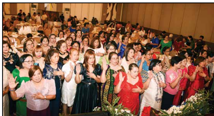
. . . and Vicarial Regents