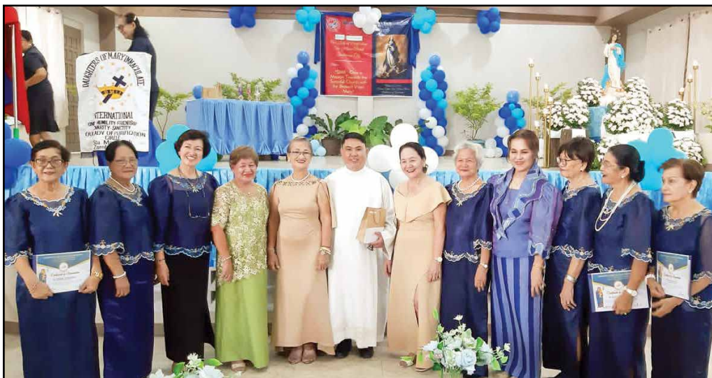
The Past Regents of our Lady of Purification Circle receive their citations and awards during the circle's 40th Anniversary celebration.

The circle aimed at establishing a circle in every parish in the Archdiocese of Zamboanga. Thus far, it has organized seven circles as follows: Our Lady of Mt. Carmel Circle, Ayala Parish in 1992, Our Lady of Fatima Circle, Putik in 1993, Holy Trinity Circle,