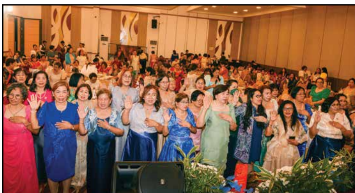
The Diocesan Regents . . .