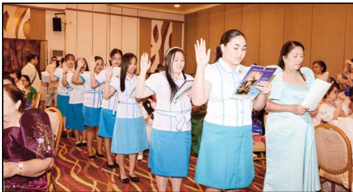
The national officers of the Squirettes of Mary are inducted into office.