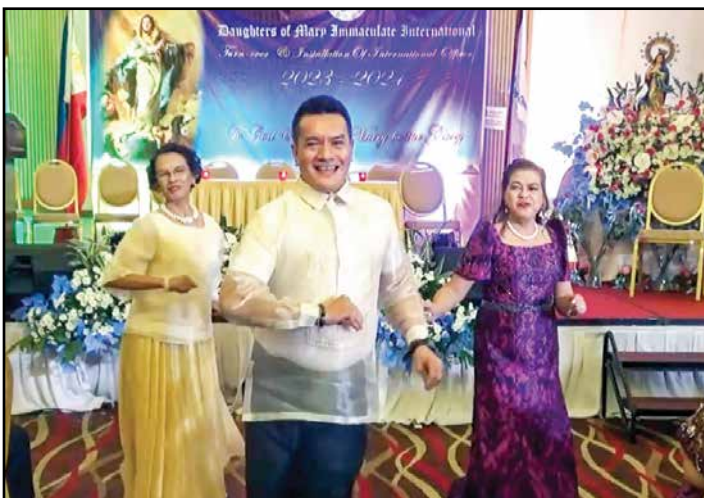
The surprise turn-over dance