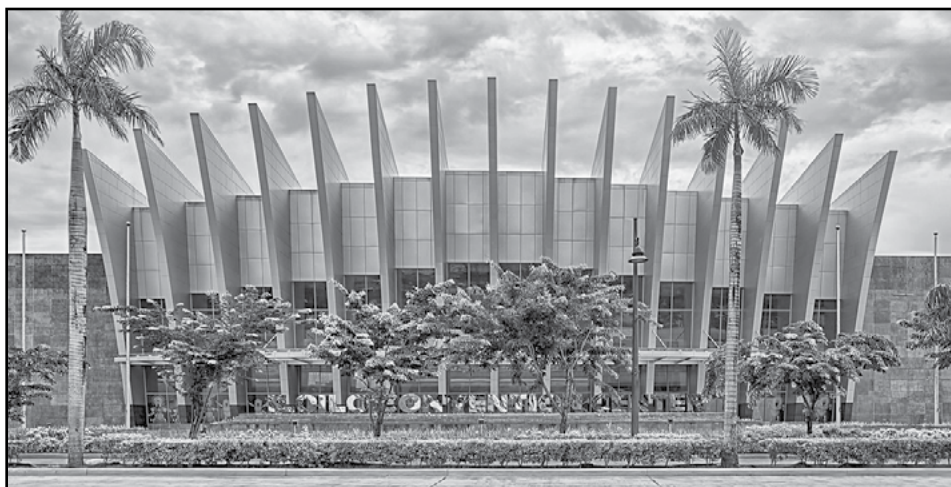
The Iloilo Convention Center, venue of the 22 nd DMII Biennial Convention