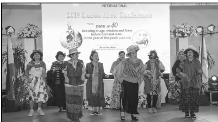
Intermission numbers by the "Weirdos" of Risen Christ Circle, Diocese of Paranaque . . .