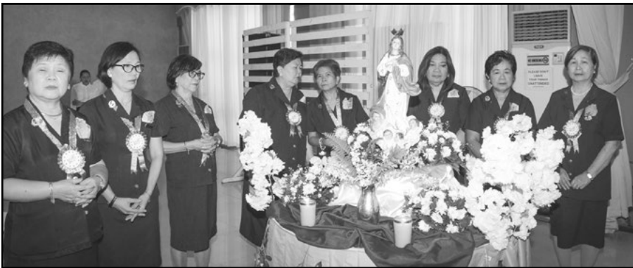
The International Officers and Board stand beside the altar of the Blessed Mother.