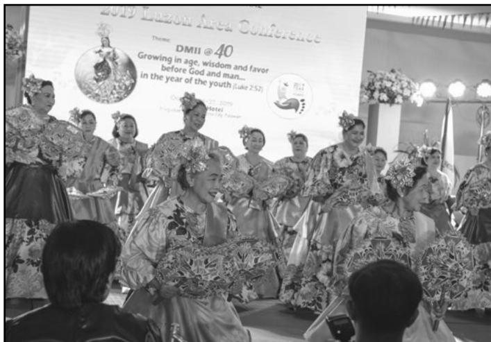
Region III by the Immaculate Heart Circle of Angeles City