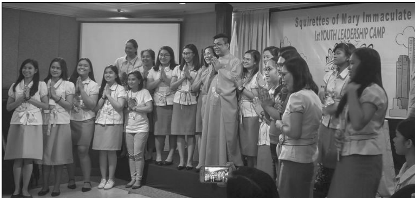
The Squirettes of the Our Lady of the Rose Circlette

Squirettes have become student missionaries. They are buhay na buhay indeed!