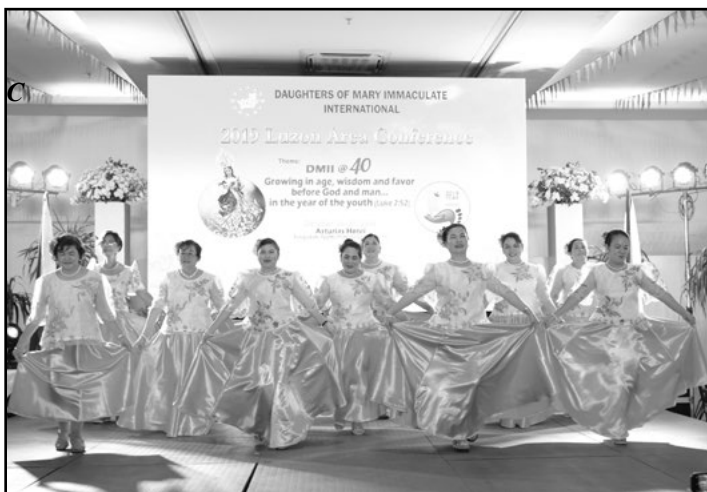
Region IV (Diocese of Malolos)