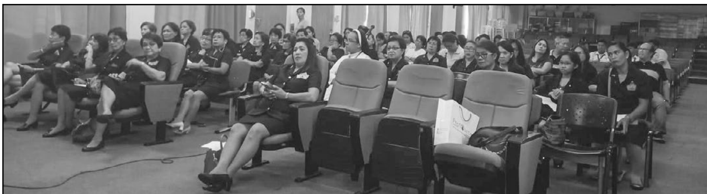
The forum audience