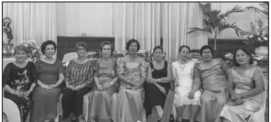
The conference hosts in a formal pose.