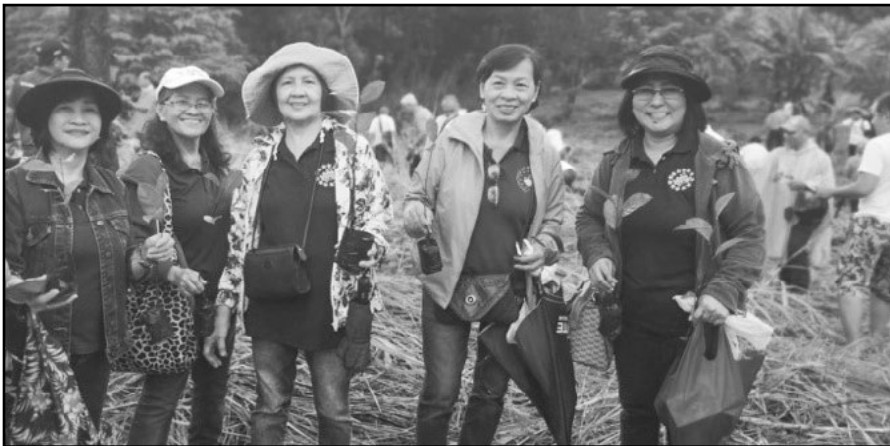
The DMI sisters hold the tree-seedlings that they are preparing to plant.

The DMI sisters battled the inclement weather that day to show their support in saving Mother Earth as part of their pro-life advocacy.