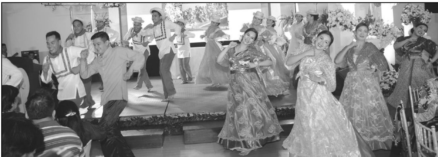
The Palawan Provincial Cultural Group