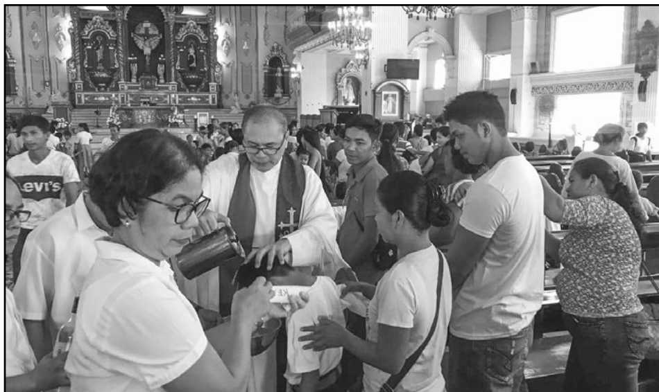
The Libreng Binyagan at the St. Francis Xavier Parish Church

It was the third time that the parish celebrated the “World Day of the Poor”.