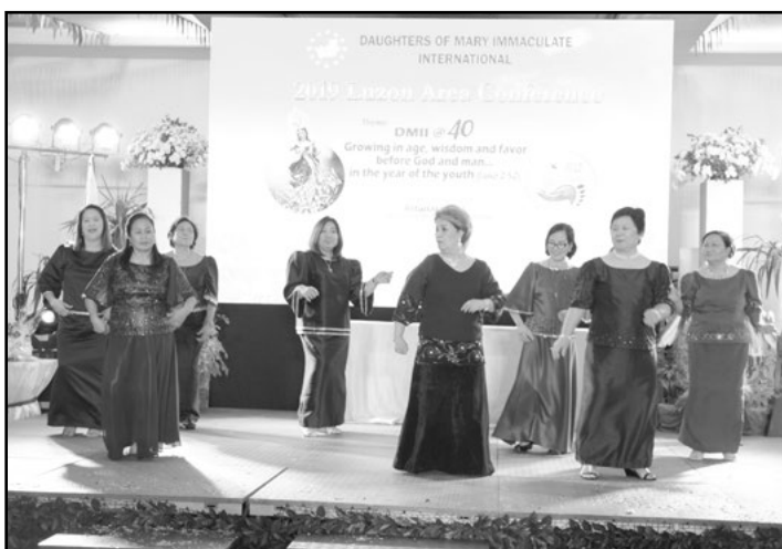
Dance number by the International Board