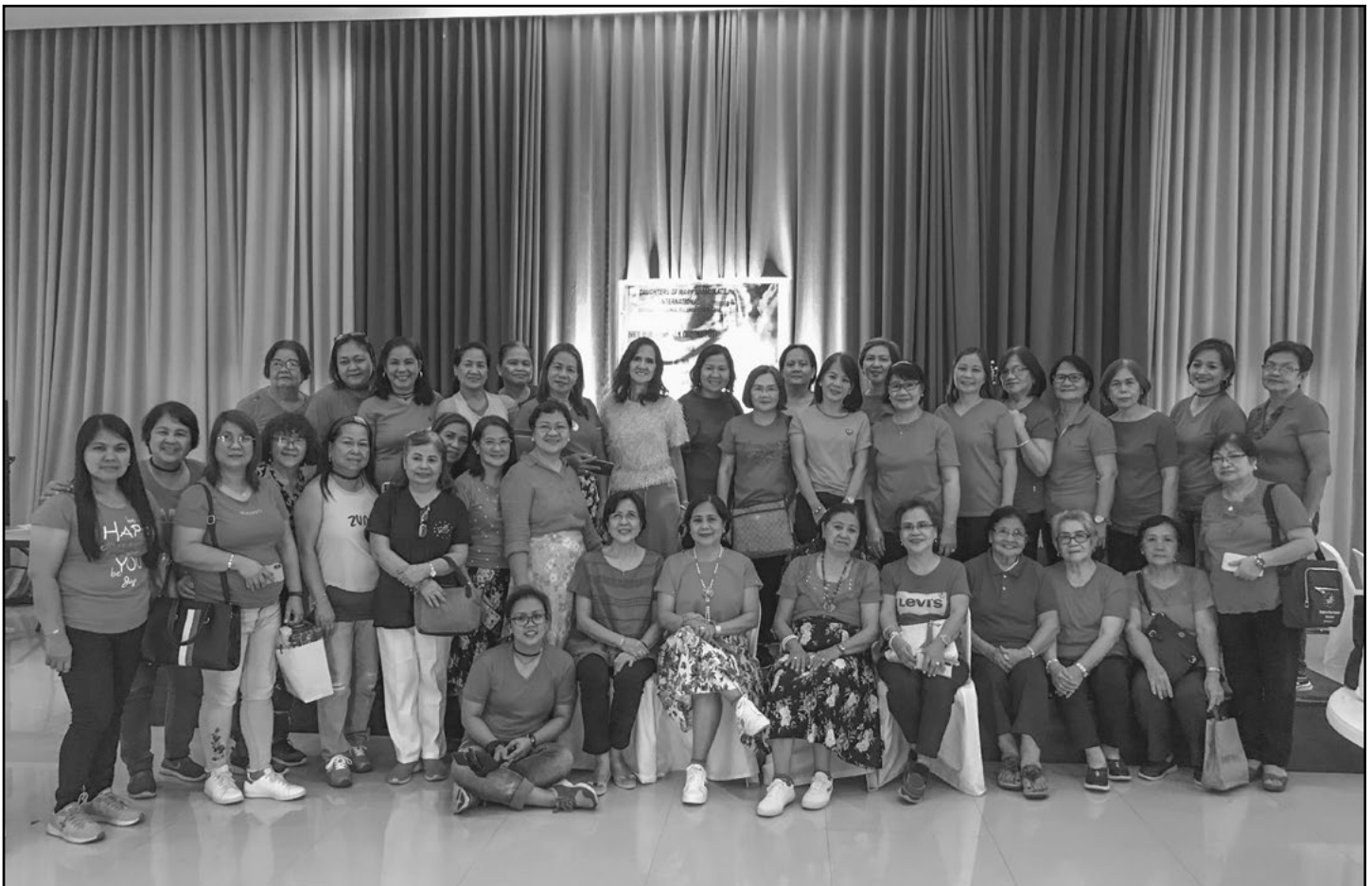
The recollection participants