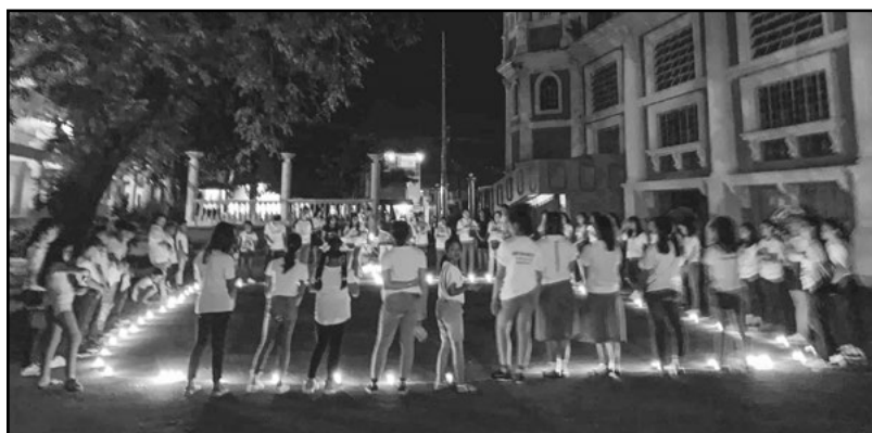
The Living Rosary at the church courtyard

The program included a film showing about the Blessed Virgin Mary and living rosary at the courtyard of St. Francis Xavier Parish Church.