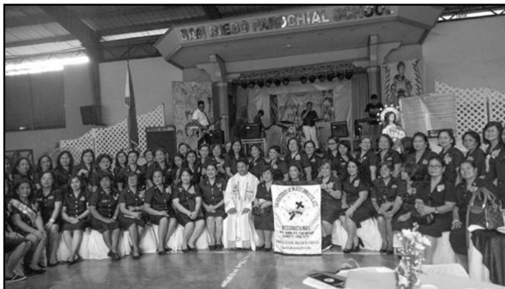
The San Diego de Alcala Circle members