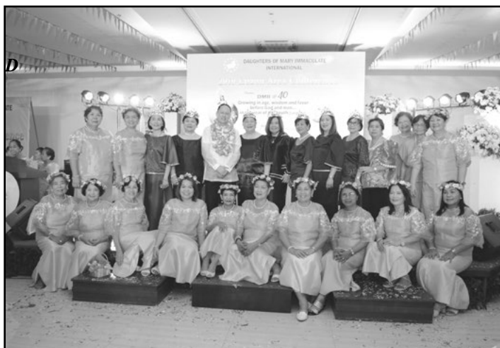
Region VII (Diocese of Calapan's Putungan)