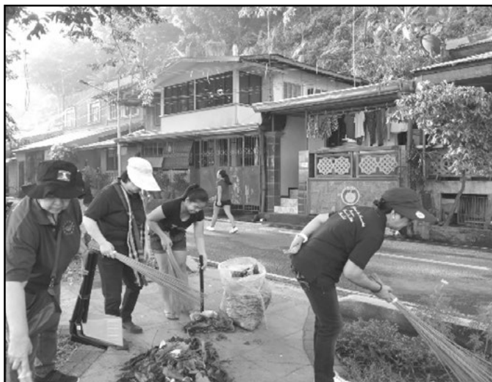
The DMI sisters during the clean-up of Sampaloc Lake.