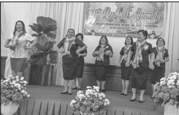
Guests from the International Board perform a dance number.