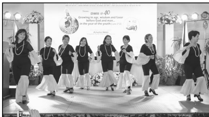
. . . and DMI sisters of the Diocese of San Pablo