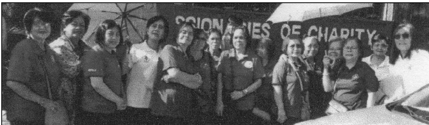
The DMI sisters during their visit to the Missionaries of Charity.