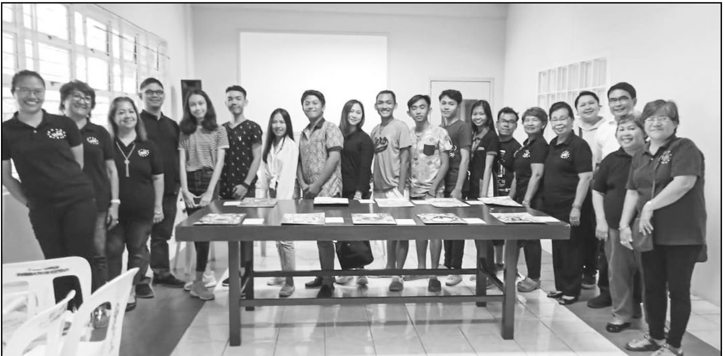
The contestants in the Poster-Making Contest with DMI sisters of Mater Purissima Circle.