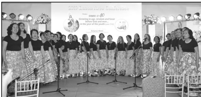
The Puerto Princesa DMI sisters' welcome through song and dance.