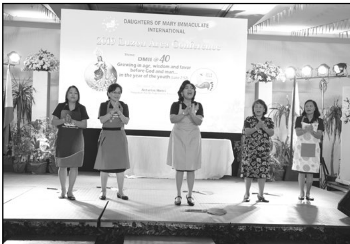
Presentations by Region I (Planting Rice)