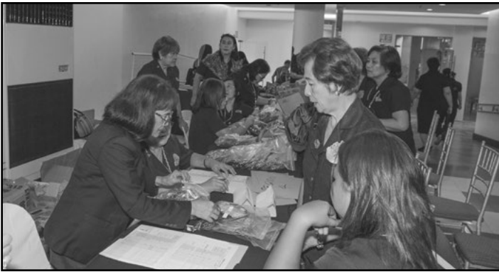
The registration of delegates