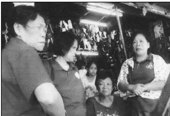
The DMI sisters visit the repair shop of the couple who were beneficiaries of their assistance.