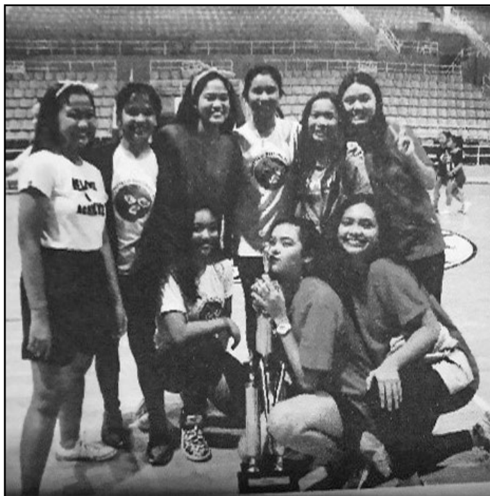
Participants in the SMI Sportsfest

The event was the SMI's culminating activity for the Year of the Youth aimed to promote sportsmanship and camaraderie among the Squirettes in the Diocese of San Pablo.