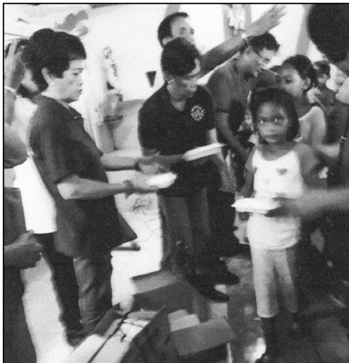
Circle members distribute food during their Feeding Program.