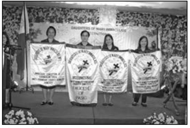
Diocese of Pasig