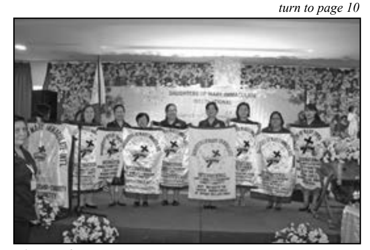
Diocese of Parañaque