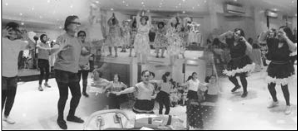
The dance numbers presented by the circles.