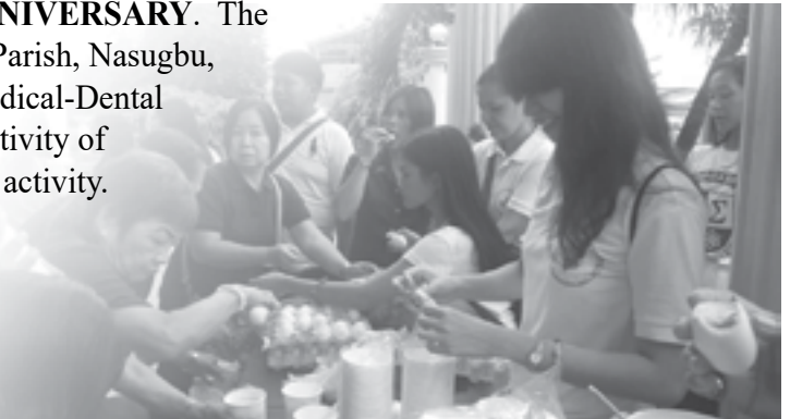
The Squirettes and their Tita DMIs distribute food during the feeding program.