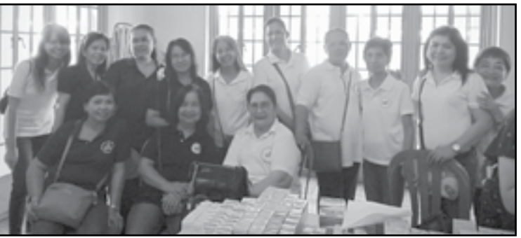
Volunteers in the Medical-Dental Mission with the DMI sisters and the Squirettes.

MALIIT NA PUHUNAN PARA SA MALIIT NA NEGOSYO. The Upliftment of Women Workers Committee of the Our Lady of Peace Circle provides modest capital for small business to housewives to help augment the family income. In photo is shown a housewife from Sitio Hamilo, Bgy. Papaya, Nasugbu, Batangas, the project's recent beneficiary.