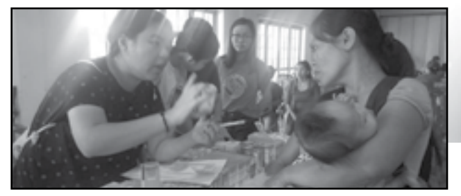
Free medicines are given to a patient after consultation.

SMI Our Lady of Peace Circlette of St. Francis Xavier Parish, Nasugbu, Batangas celebrated its 10<sup>th</sup> Anniversary with a Free Medical-Dental Mission and Feeding Program last Sept. 8, 2018, the Nativity of our Blessed Mother. Shown are photos taken during the activity.