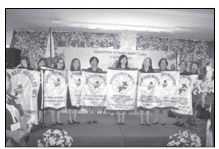
Diocese of Antipolo