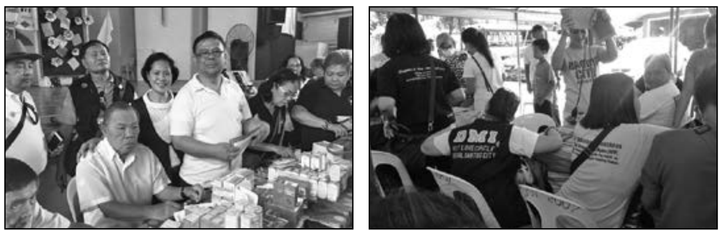
Some of the volunteers who participated in the project

200 patients who were also given free medicines. The Dental Team had nine dentists plus 3 PGI performing 97 tooth extractions. The team provided free toothbrushes and toothpaste and gave a demonstration on proper dental hygiene. There was also a Legal Clinic with seven lawyers providing professional advice to 26 individuals who sought legal aid concerning personal conflicts, marital problems and land disputes. Fifty donors participated in the blood-letting activity. Optical services were also provided with two optometrists giving free eyeglasses to those who availed of regular eye examination numbering some 100 patients.