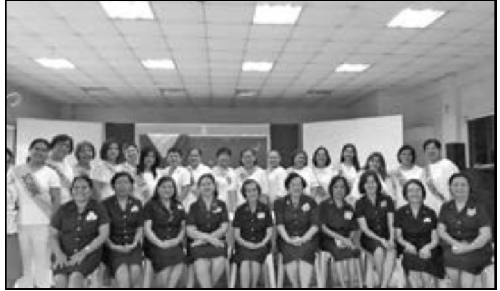
A group photo of DMI sisters of Our Lady of Mt. Carmel and Sacred Heart of Jesus Circles.

The twenty-five aspiring recruits who will compose the circle's charter members were given an orientation by a team from the Our Lady of Mt. Carmel Circle in September, 2018. On Oct. 28, they were exemplified by the Exemplification