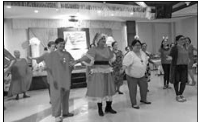
A dance presentation added color to the occasion.