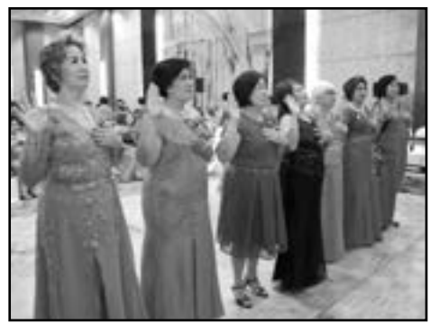
... Chairpersons of special committees