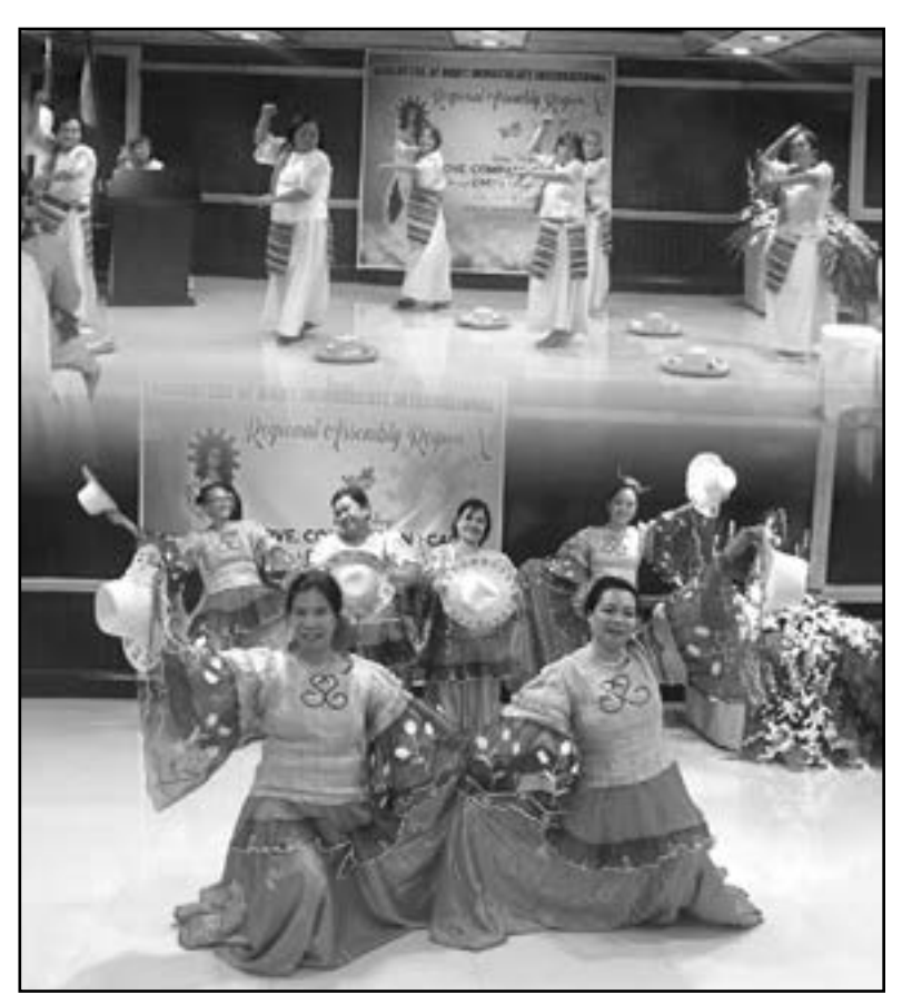
Dance presentations by the Holy Rosary Circle and the Diocese of Dumaguete