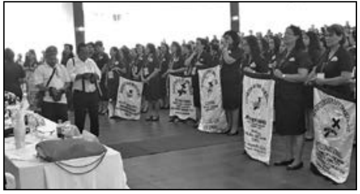
The Parade of Circles