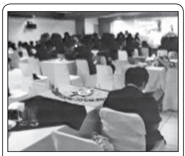
A Diocesan Assembly was attended by the DMI sisters at the Sacred Heart Center on Jakosalem St., Cebu City on Sept. 15. Some 100 DMIs from various circles in the Archdiocese attended the assembly with the theme "Living Mary's Love, Compassion and Care through DMII's Presence and Mission".

The circle members joined a parish activity on Aug. 24, 2018 called : "United in Prayer- Cebu Answers the Call of Mama Mary". A mass prayer and novena were offered in her honor at the courtyard of the Our Lady of Lourdes Parish in Mabolo, Cebu City.