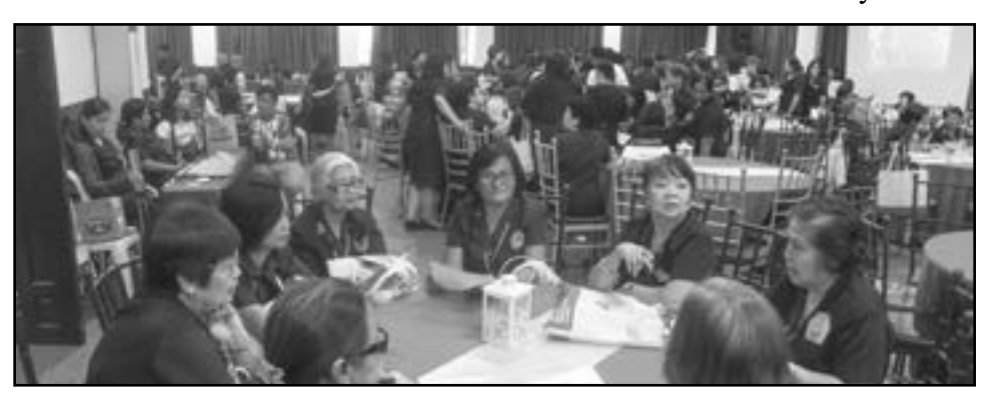
The delegates' plenary session after the mission workshops.

Hindrances – The lack of funds and the lukewarm response of members.