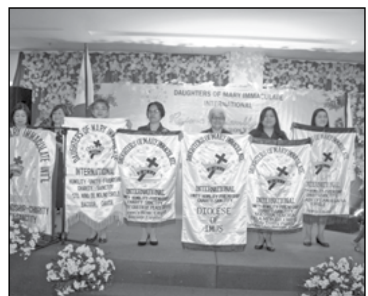
Diocese of Imus