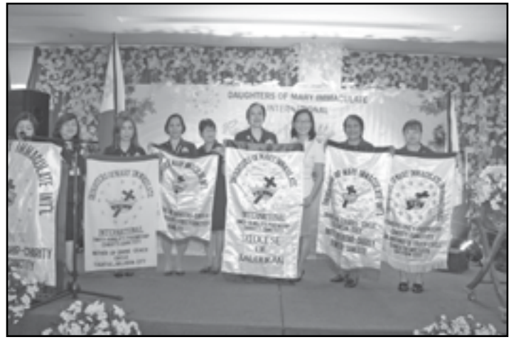
Diocese of Kalookan