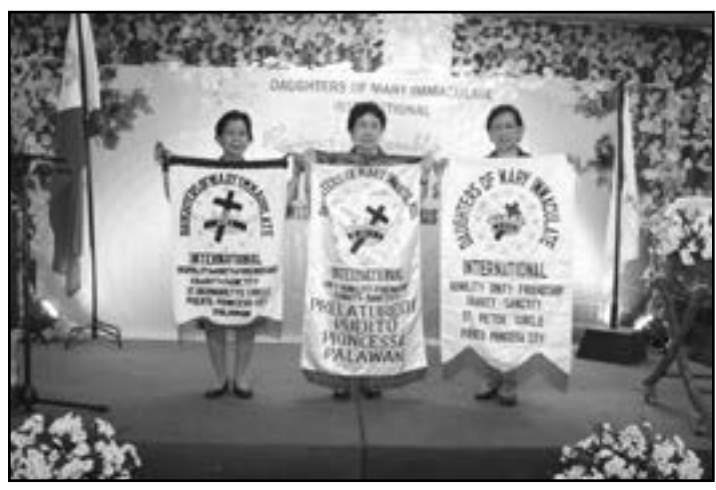
Prelature of Puerto Princesa