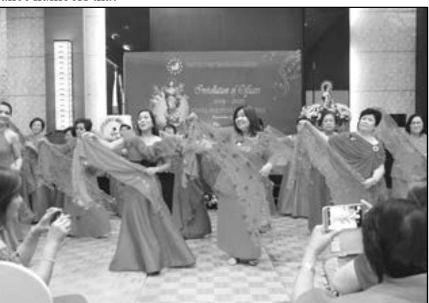
The outgoing Board in a surprise dance number.