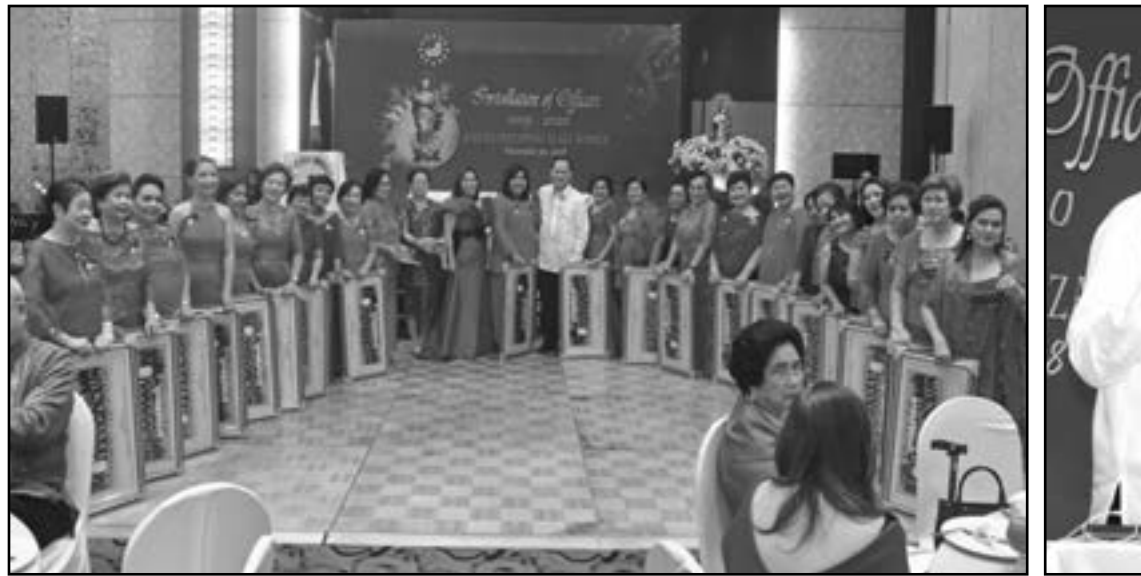
The outgoing officers and Board are presented token gifts as keepsakes.