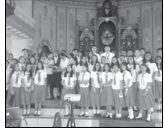
Some of the student participants who attended the media symposium.