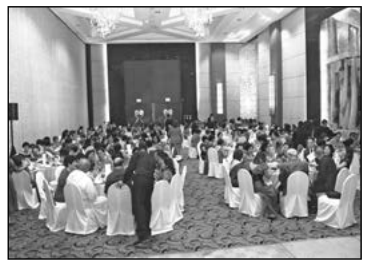
Dinner at the Visayas Hall of Hotel Sofitel