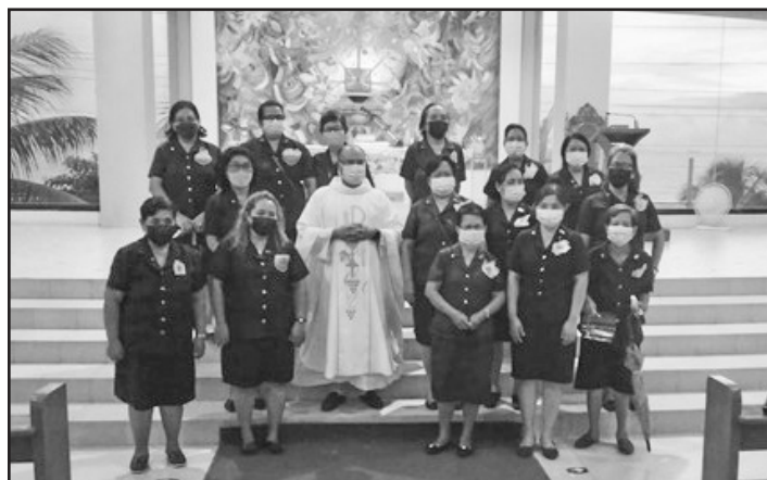
Transfiguration Circle - The DMI sisters with their parish priest after the Holy Mass.