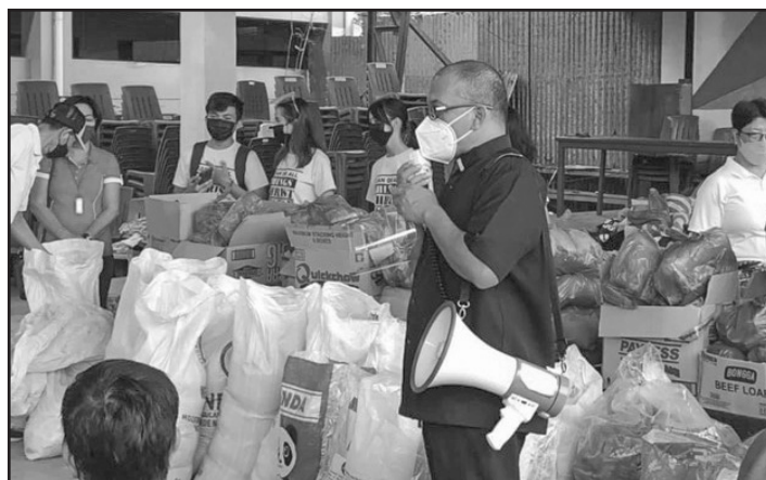
Our Lady of Penafrancia Circle – Distribution of gift packs to indigent families