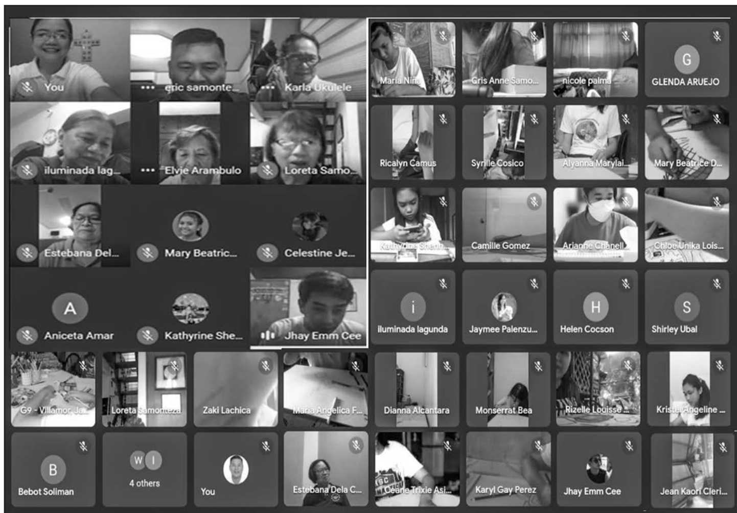
A screen shot of the Board of Judges, contest participants and DMI sisters present.