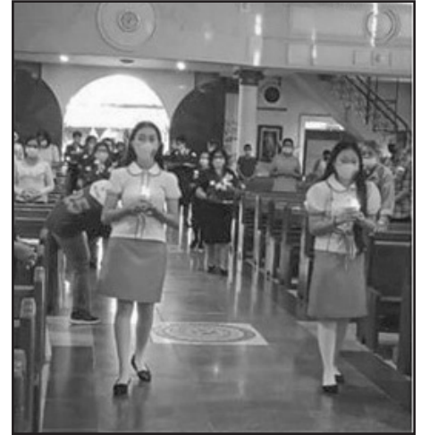
St. Therese of Mampang Circle – Floral offering to the Blessed Mother. Two Squirettes carrying candles lead the offerors during the processional.