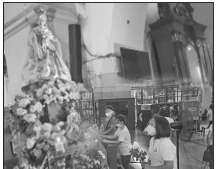
DMI sisters pray and offer flowers before the flower-bedecked altar of the Blessed Mother.

FLORES DE MAYO CELEBRATED. The San Jose Diocesan Shrine and Parish celebrated Flores de Mayo simply during Mama Mary's month. The rosary and May Flower devotion were conducted by the circle in coordination with other parish organizations. They led the Rosary prayer and offered flowers on May 8 and 28, 2021.