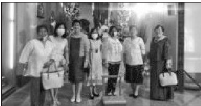
Some DMI sisters before the image of San Jose.

The DMI sisters came in their special Filipiniana attire as the day was also a special occasion for the circle, its 43 rd anniversary. Happy that they were able to see each other again face-to-face, they took great care to strictly observe pandemic health protocols.