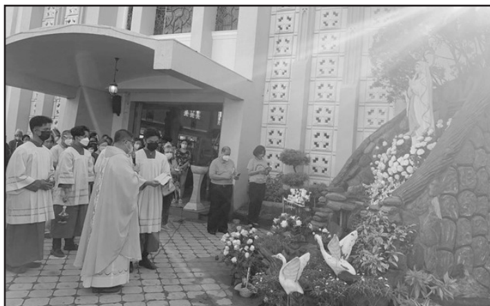
St. Joseph Circle - Blessing of Mama Mary's newly restored image mounted on a special altar in front of the church.

A nine-day novena and Holy Masses preceded the celebration of the Nativity of the Blessed Virgin by DMI circles in the Archdiocese of Zamboanga as well as in the Prelature of Isabela de Basilan. Aside from live activities by some circles, others conducted the activity online consisting of the Rosary and blended prayers to enable DMI families and Squirettes of Mary to participate. Here are some photos of circle activities to celebrate Mama Mary's birthday.