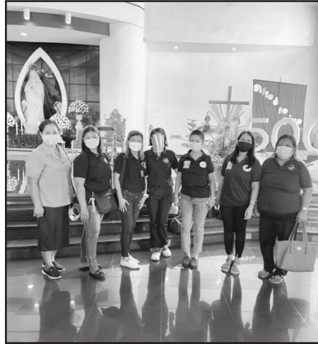
Metropolitan Cathedral of the Immaculate Conception Circle - A group of circle members poses for a photo during the celebration.