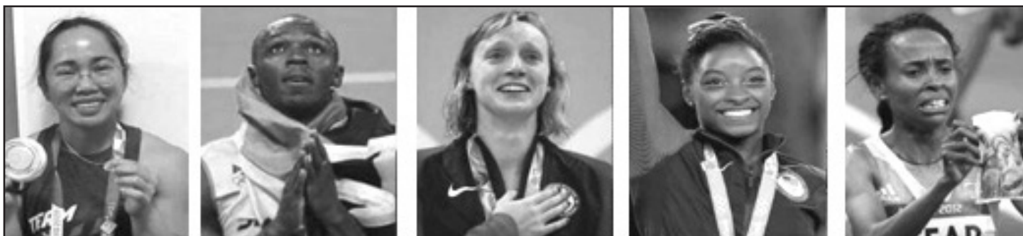
Hidilyn Diaz Philippines

It is very heartening to know that these Olympics athletes hold on to their Marian devotion as they hone their skills. I see them not only as champions in their respective sports but also as champions in their faith.