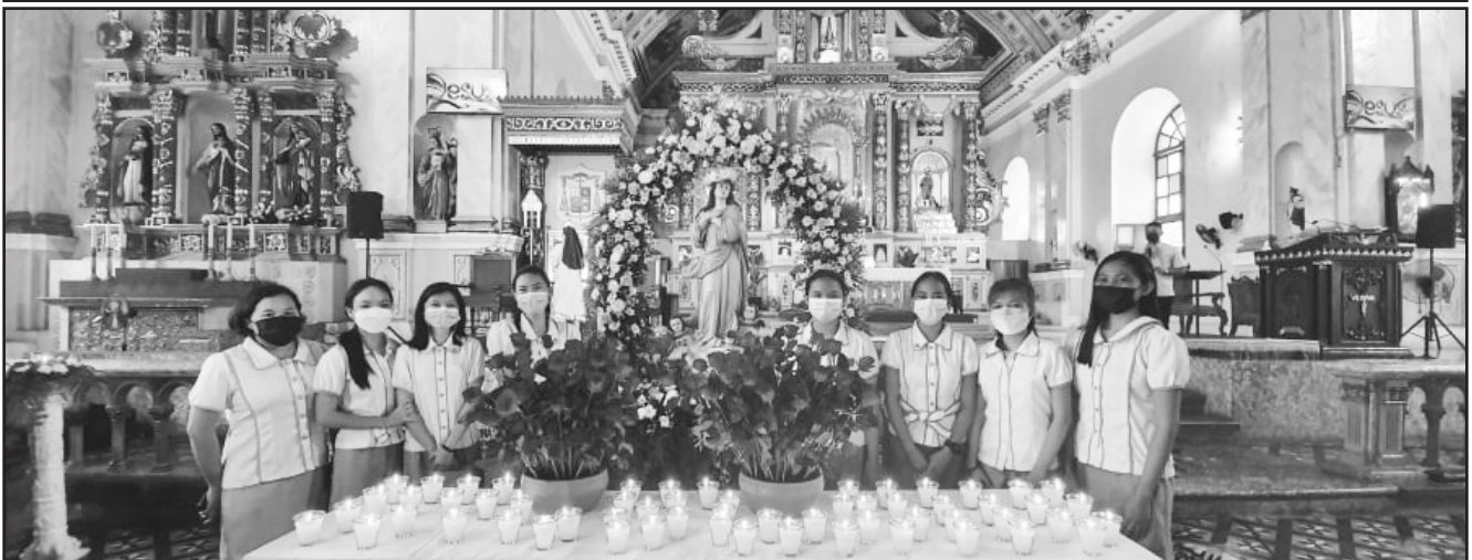
The San Jose de Tagbilaran DMI Circle and SMI Circlette flank the special altar of the Blessed Virgin Mary at the Tagbilaran Cathedral.