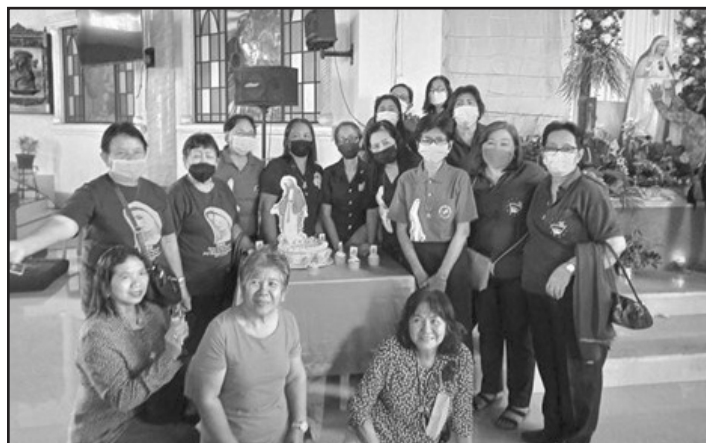
Sta. Isabel Circle of the Prelature of Isabela de Basilan - Circle sisters surround the altar of the Blessed Mother.