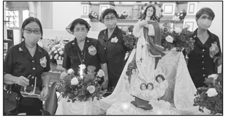
Mother of Perpetual Help Circle – Circle sisters flank the Blessed Mother’s altar which they helped put up.