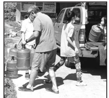
Donated plastic containers are delivered to the container garden site.