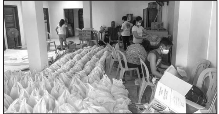
Gift packs are readied for distribution to indigent families of the parish.

The St. Thomas of Villanova Circle worked closely with the Social Action Ministry of the parish during the occasion.