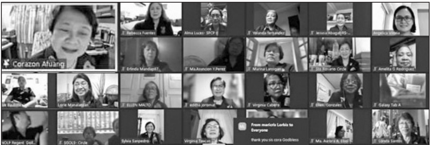
A screenshot of some webinar participants

Based on the reactions of most of the participants, it was an afternoon well spent, save for a few distractions created by some participants who have yet to get accustomed to using Zoom in on-line conversations and meetings – to MUTE their devices when listening to someone talking.