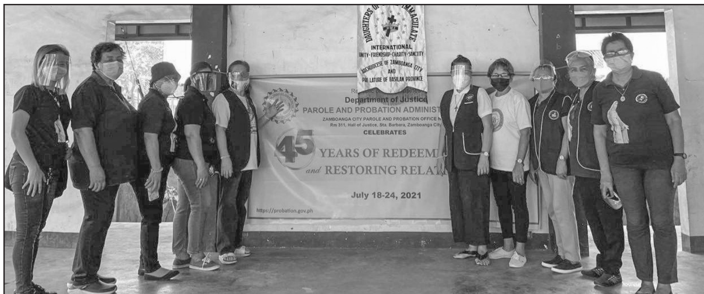
The DMI sisters flank the tarpaulin streamer announcing the project