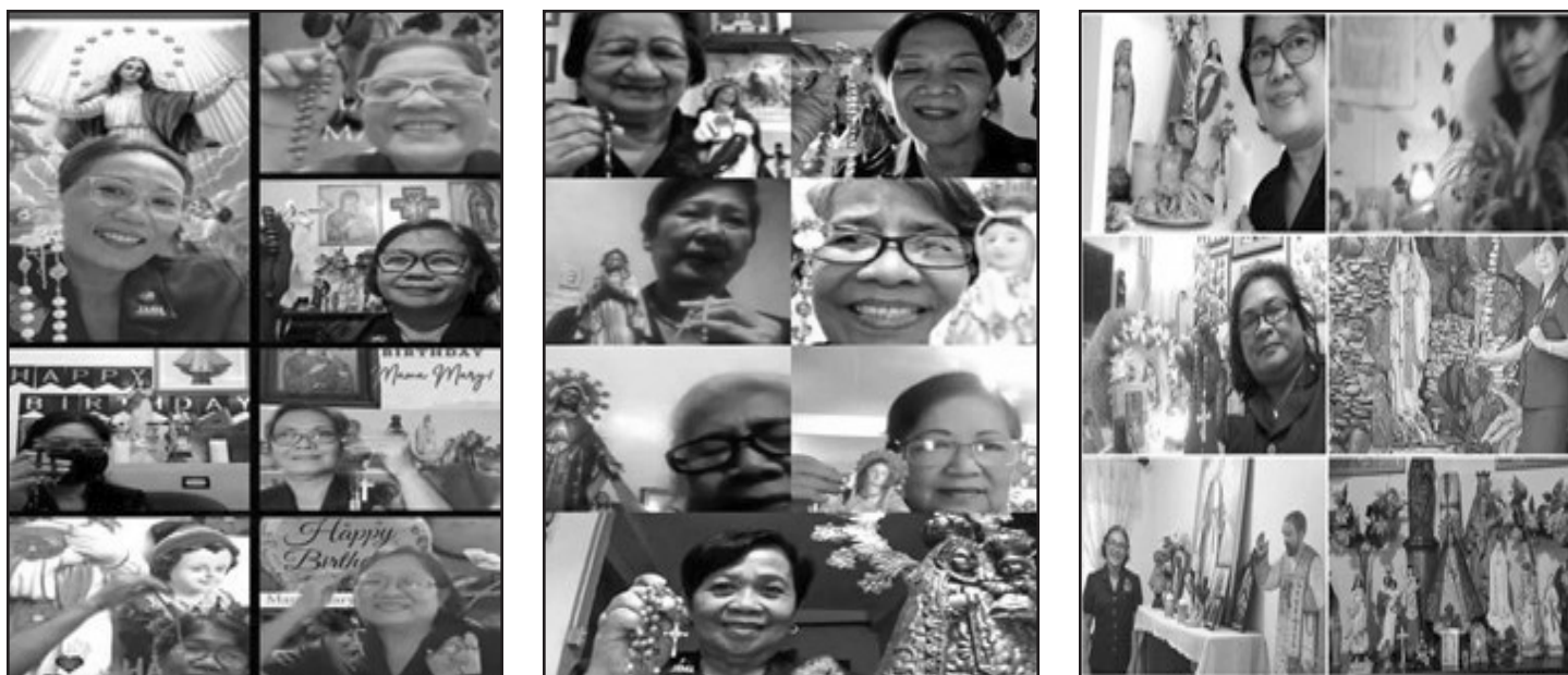
Screenshots of participants in the Birthday Tribute to Mama Mary