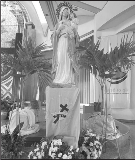
St. Ignatius of Loyola Circle – A special altar to honor the Blessed Mother