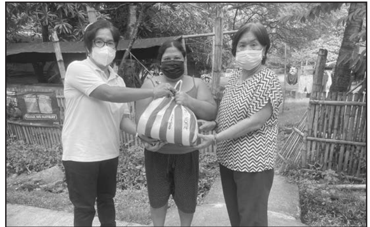
A beneficiary receives a gift pack from DMI sisters.