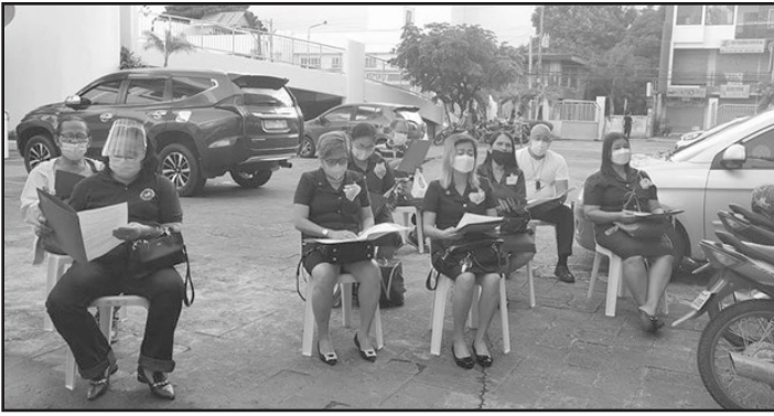
Nuestra Senora la Virgen del Pilar Circle – Rosary and devotional prayers at Mary’s shrine at Fort del Pilar.