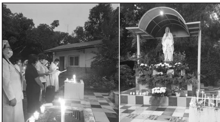
Our Lady of Mt. Carmel Circle – Praying before the altar of the Blessed Mother.