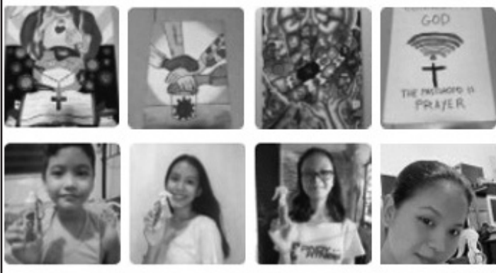
The contestants and the posters they designed.