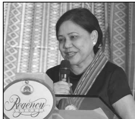
Sen Cynthia Villar, guest of honor and speaker