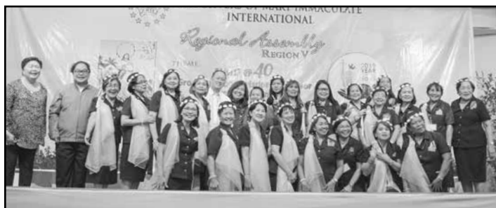
And it's a tie for first place by the Diocese of Kalookan . . .