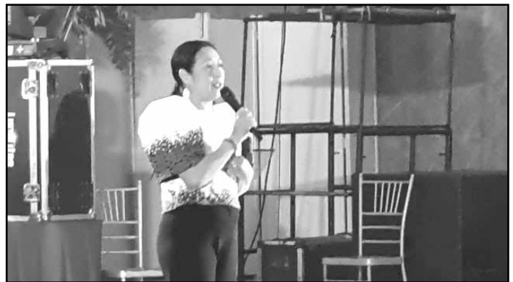
Zamboanga City Mayor Isabel Climaco-Salazar welcomes the delegates to her city.

she concluded, lives by the Word of God and a model for everyone, especially the youth.