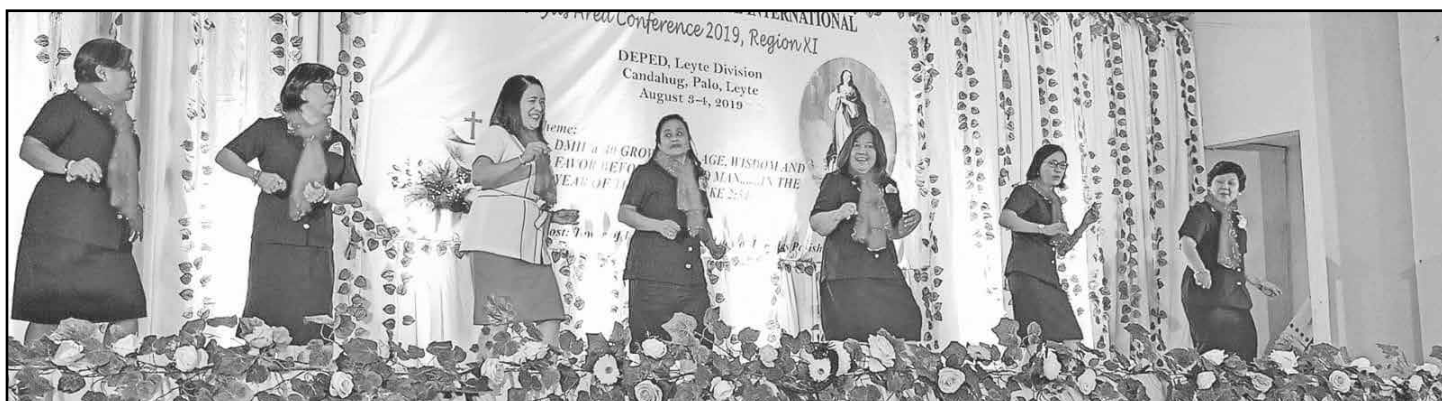
A surprise dance number by the International Officers and Board