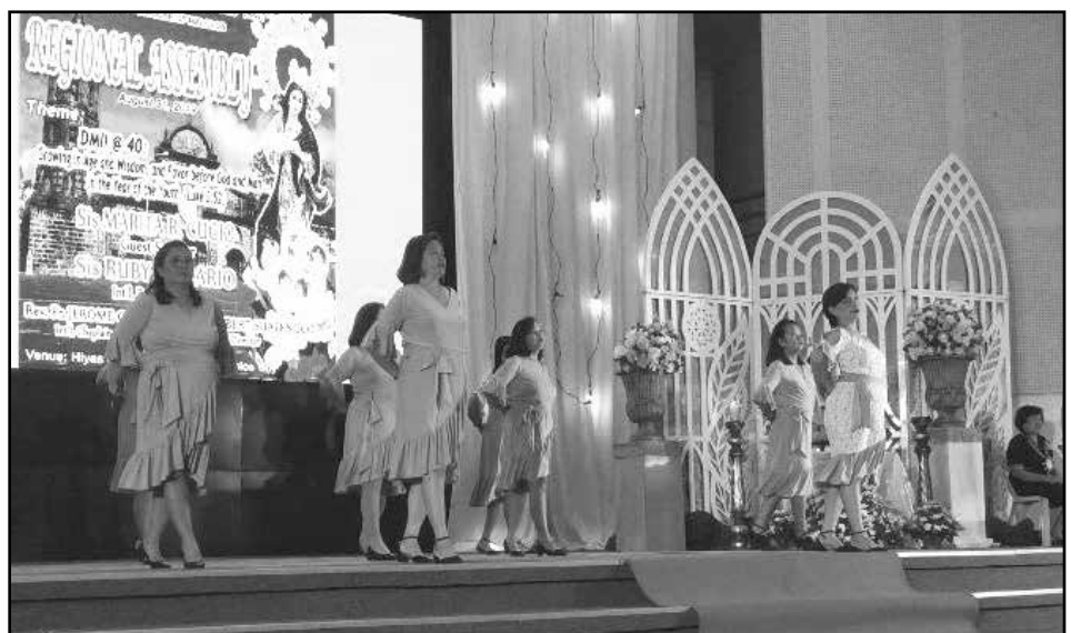
Intermission number by the Queen of Flowers and Our Lady of Consolation & Cinture Circles.