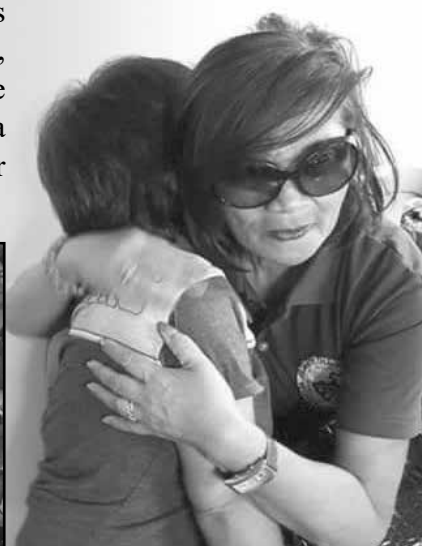
A resident finds comfort in a DMI sister's warm embrace.