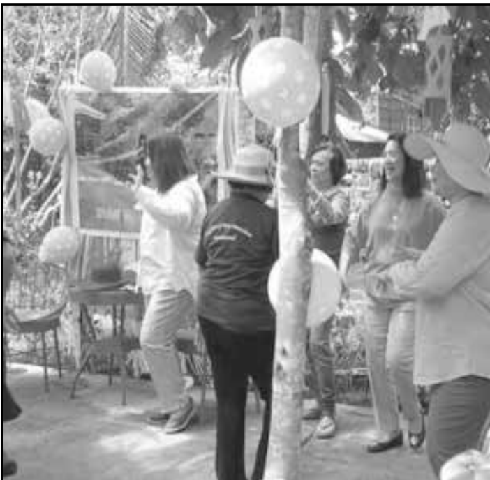
A festive atmosphere at AC Farm