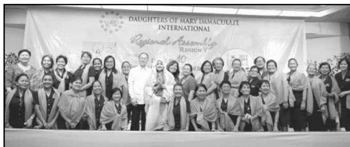
. . . and the Diocese of Manila