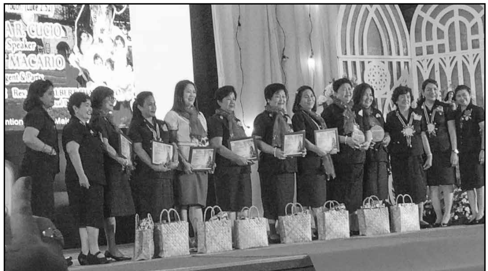
Guests from the International Board and the assembly hosts receive plaques of appreciation and token gifts for a successful regional assembly.