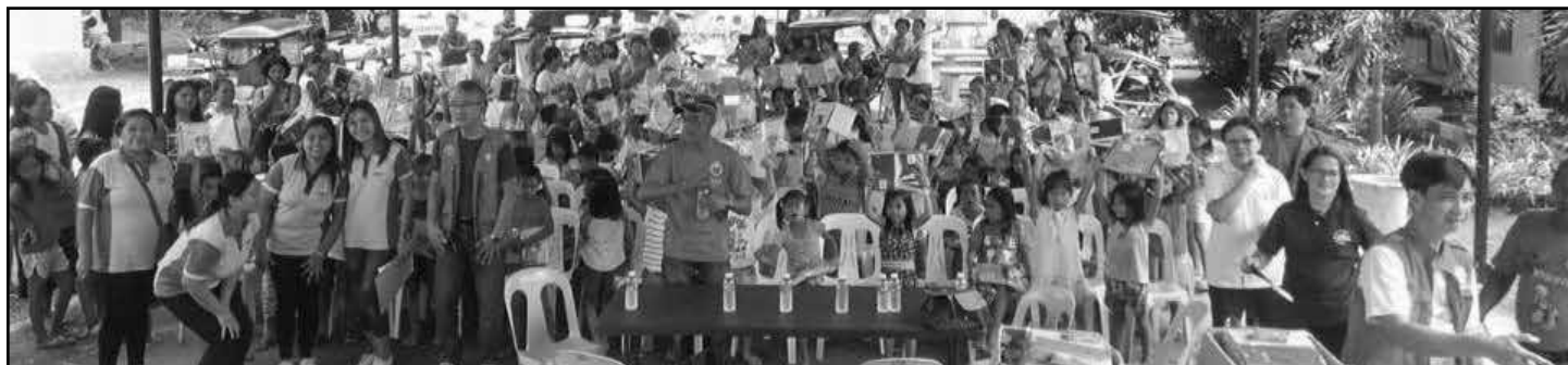
The DMI and KC members get ready for the distribution of school kits to Grade 1 pupils of Bani Elem. School.