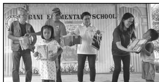
The children thank their benefactors as they receive their kits.