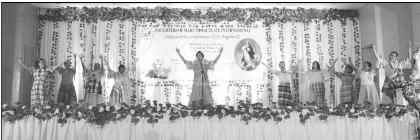
“Sayawit” during Fellowship Night

After the Mass, the Plaque of Apostolic Blessing awarded to the DMII by Pope Francis was unveiled for all to see.