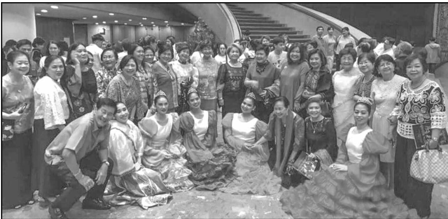
The Risen Christ Circle members with some Bayanihan dancers after their performance.