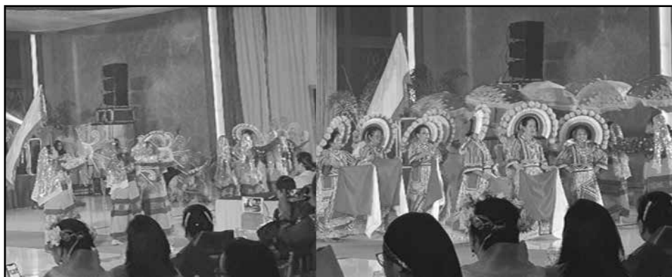
Cultural dances performed during Fellowship Night. At left is the presentation of the Archdiocese of Zamboanga. At right is the entry of the Diocese of Iligan which won the grand prize.