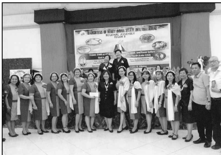
The Diocese of Cabanatuan, first place winner in the DMII Hymn Choral competition.