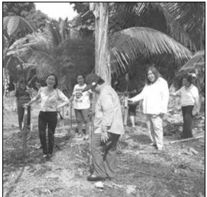
Getting ready for tree-planting