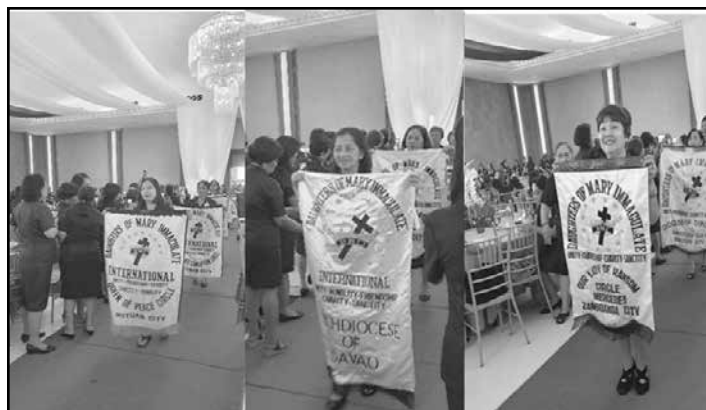
The Parade of Circles