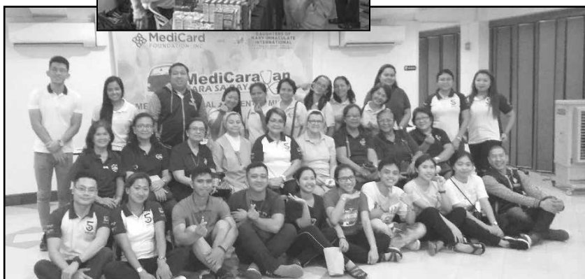
The Regina Mundi Circle DMIs with project partners and volunteers.