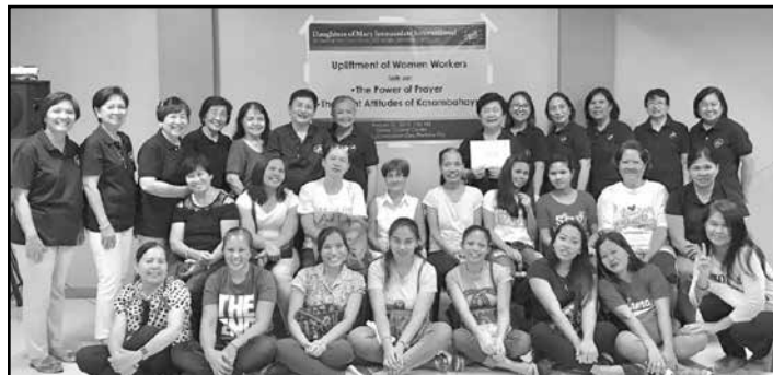
The symposium participants