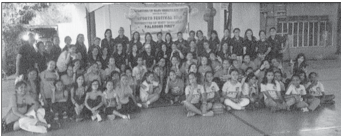
Participants in the Sports Fest with their Tita DMIs

The Immaculate Heart of Mary Circlette emerged as overall champion of the sportsfest.