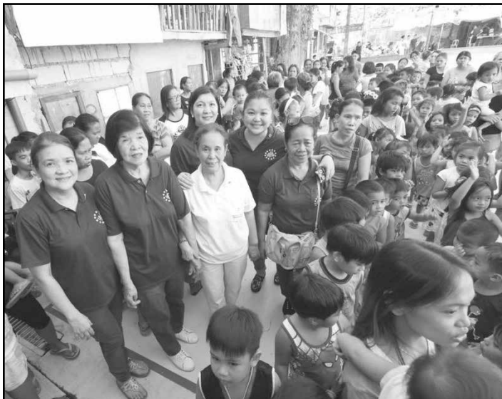
The DMI sisters with the beneficiaries of the Tsinelas-Giving Project.

TSINELAS-GIVING PROJECT. The Upliftment of Women Workers Committee of Our Lady of Beautiful Love Circle of Merville, Paranaque City sponsored a Tsinelas-Giving Project benefiting some 1,000 women and children from the mission areas of the parish – Sitios Wella, Manggahan, Tuyuan, Cubic and Malaya. The Commission on Service to Human Promotion of Our Lady of Beautiful Love Parish was a project partner with generous parishioners donating funds for the project. The help of Sitio Coordinators ensured an orderly distribution of the slippers.