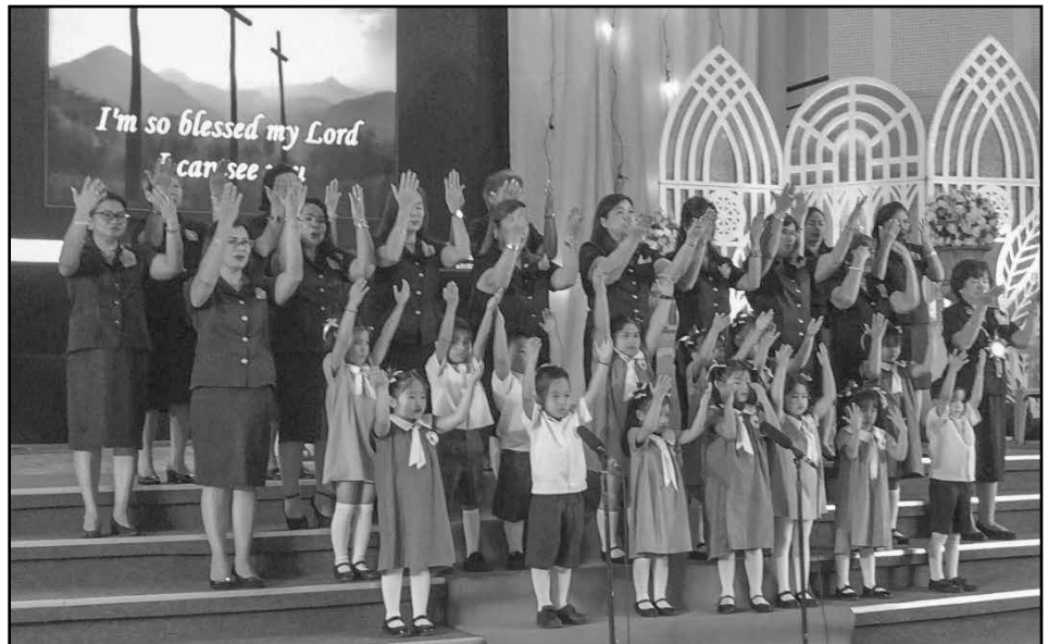
Pupils of the St. Martin of Tours Day Care School join the DMI sisters in an action song.

Plaques of appreciation were awarded to the assembly speakers as well as to the hosts of the Region IV Assembly.