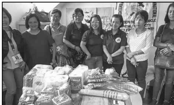
The St. Joseph the Worker Circle members brought gifts and food for the Haven's residents.

eyed. But more than the material things they received, the encouraging words, the tight hugs and other affectionate gestures from the sisters gave them a reassuring feeling that they are cared for and loved by God.