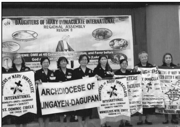
Delegates of the Archdiocese of Lingayen-Dagupan, the assembly host, during the Parade of Circles.