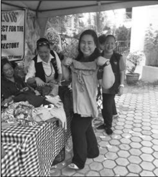
CIRCLE FUND-RAISING. The Our Mother of Perpetual Help Circle of Guiuan conducted a fund-raising activity on May 27, 2018 to support the circle's projects and activities for the DMI missions.