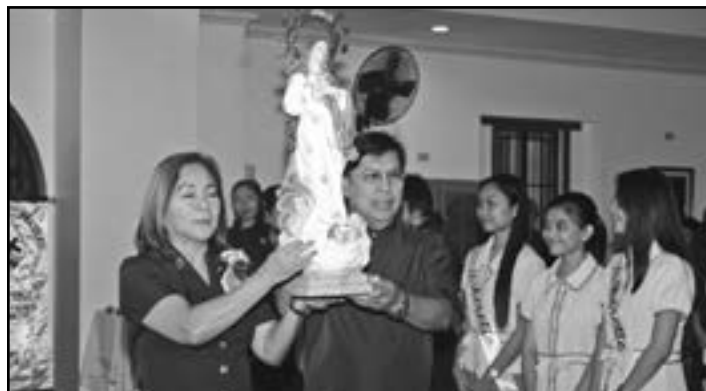
The image of the Blessed Mother is carried to the altar for the enthronement ceremony.