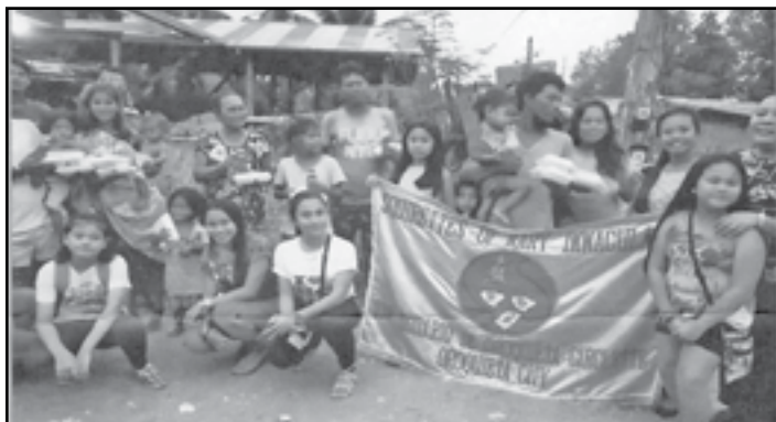
The Squirettes with the Badjaos