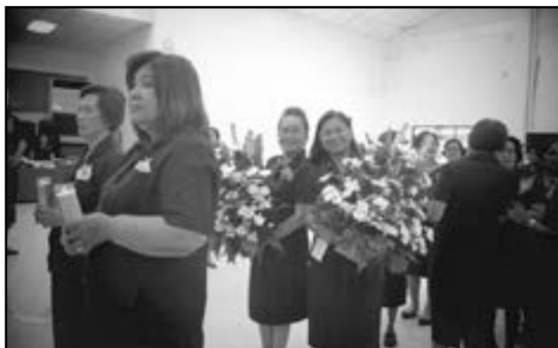
Enthronement and consecration of the Blessed Virgin Mary

On July 7, 2018, the Vicariate of San Antonio de Padua hosted the 2018 Region VI Assembly of the Diocese of San Pablo (Laguna). The assembly was held at the Central 2, Calamba City with the theme “Embracing a Life of Humble Service and Credible Witnessing to Jesus through Mary” attended by 204 DMI sisters.