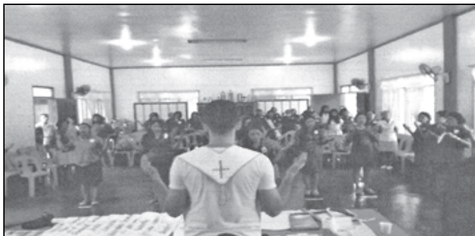
The Long Conferral ceremony for the 30 new circle members.