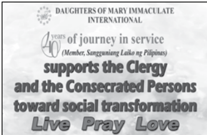
A DMII tarpaulin in support of the National Laity Week celebration.

DMI circles all over the country participated in the week-long activities held in their respective parishes in support of the National Laity Week celebration. They also displayed tarpaulins and posters announcing the event in the courtyards and bulletin boards of their respective parish churches.