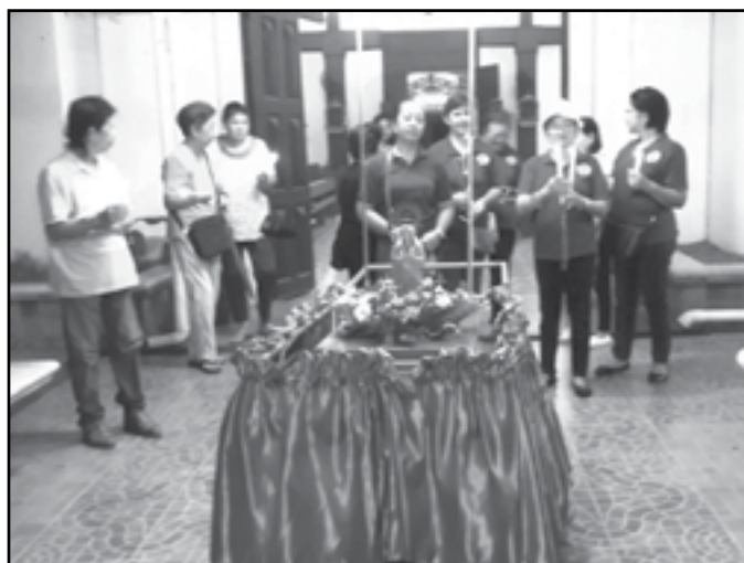
The icon of Our Mother of Perpetual Help and image of Our Lady of Mt. Carmel are readied for the procession.

The St. Bernadette Circle officers and members participated actively in the celebration of the Feast of Our Lady of Mt. Carmel on July 16, 2018 and of Our Mother of Perpetual Help on July 22 highlighted by a procession.