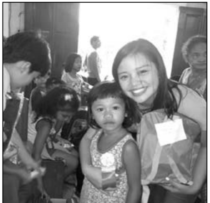
SMI's AS FLORES DE MAYO CATECHISTS. The SMIs of the Archdiocese of Zamboanga taught catechism to children in various parishes in Zamboanga City during the month-long celebration of Flores de Mayo last May, 2018. The children were prepared for their first communion and given school supplies during the culminating activity of the Flores de Mayo celebration.