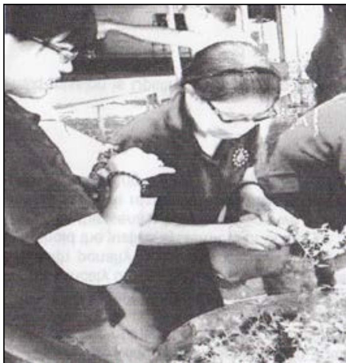
Seminar participants apply the technology they learned from the resource speaker.

The speaker also emphasized that aside from pots, containers that may be considered garbage and thrown away such as old tires, plastic bottles and jars and sacks may be used. The participants were also shown how to prepare organic fertilizer from molasses, brown sugar, peelings of fruits and vegetables and internal organs of fish. These are stored in containers and left to ferment