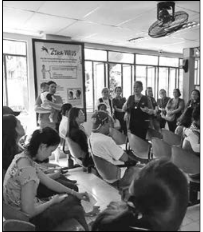
PRO-LIFE/MORALITY IN MEDIA PROJECTS. The Our Lady of Ranson Circle conducted activities for Pro-Life and Morality in Media last June 11, 2018.