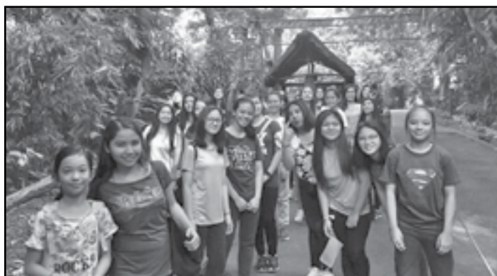
Squirettes of the Mater Dei and Our Lady of Fatima Circlettes pose for a group photo at Ecopark before the start of their Team-Building Workshop on June 30, 2018.