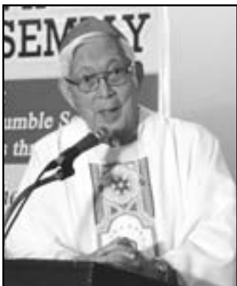
His Eminence Gaudencia Cardinal Rosales, keynote speaker