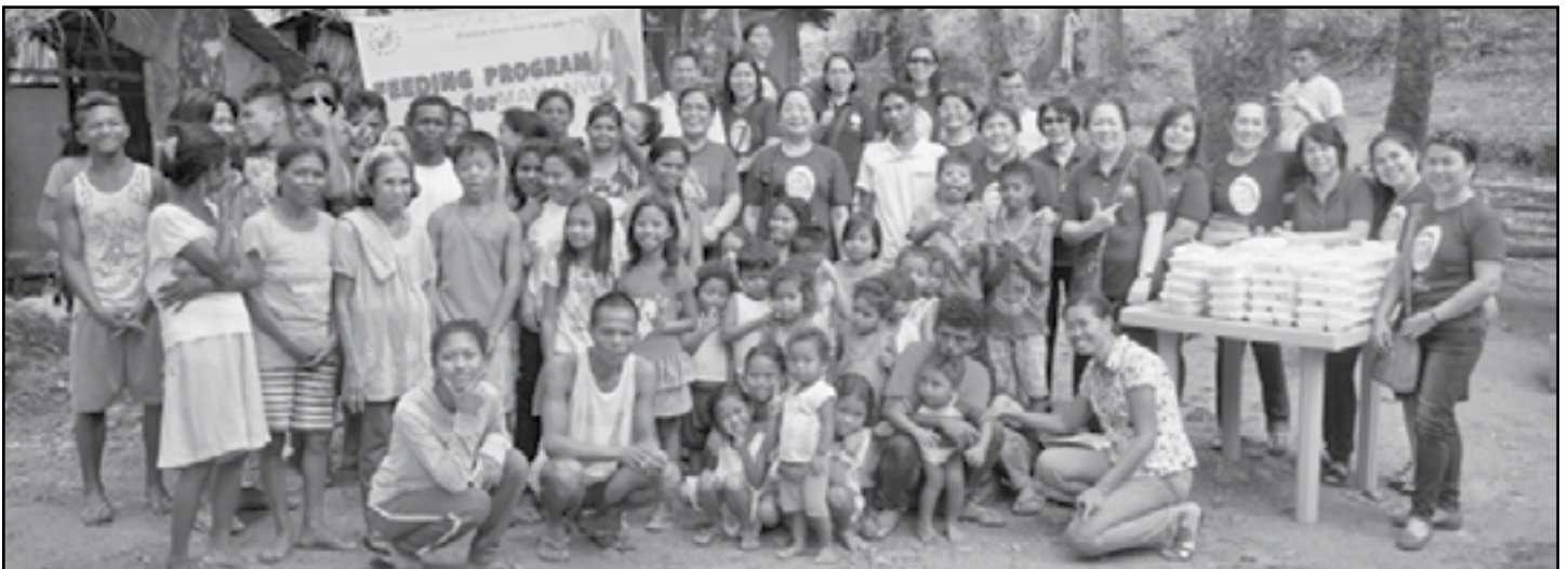
The DMI sisters and medical volunteers with the 'Mamanwas'.