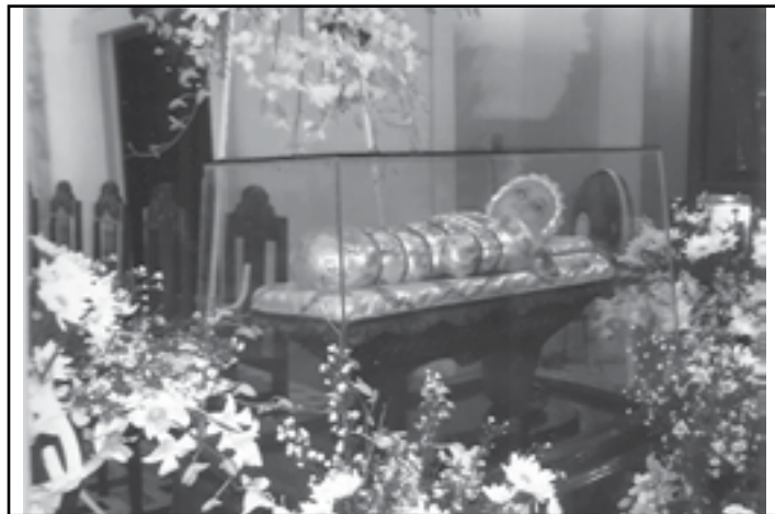
Image of Maria Bambinella