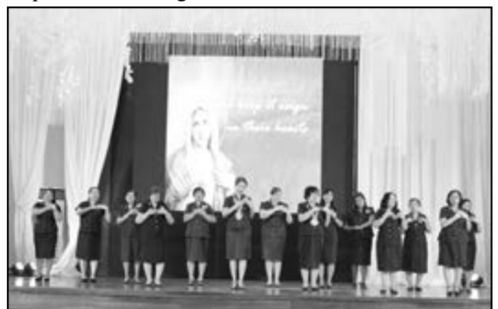
DMI sisters of Region IV act out the DMI Hymn being sung by the assembly delegates.