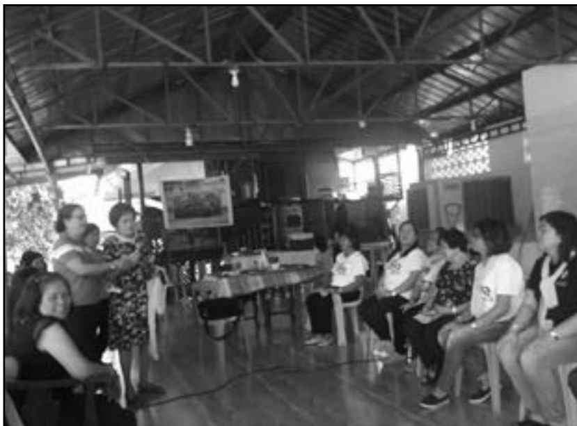
The Team-Building Workshop in session.

The workshop reinvigorated the circle members' spirit as they actively participated in the group dynamics and games in the day-long activity. Food and drinks were generously shared by the participants in the true DMI spirit of sisterhood and friendship.