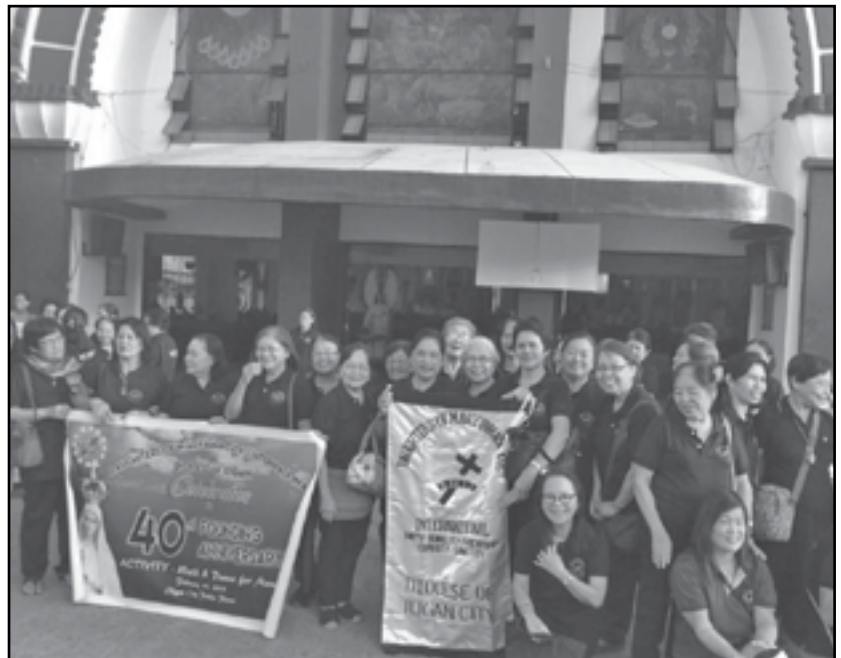
The participating DMI circles in a group photo before the Walk.

The participants walked to the public plaza and went zumba dancing. Snacks were later shared by all.