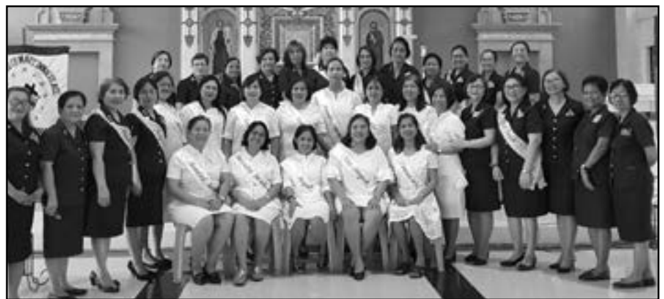
The officers and members of the Our Mother of Perpetual Help Circle with the DMI sisters from the Our Lady Queen of Peace Circle, their mother circle.

A diocesan long conferral ceremony is scheduled to be held in November and the new circle promised to complete the required