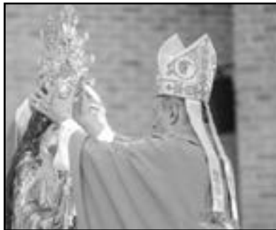
The Papal Nuncio crowns the image of the Blessed Mother . . .