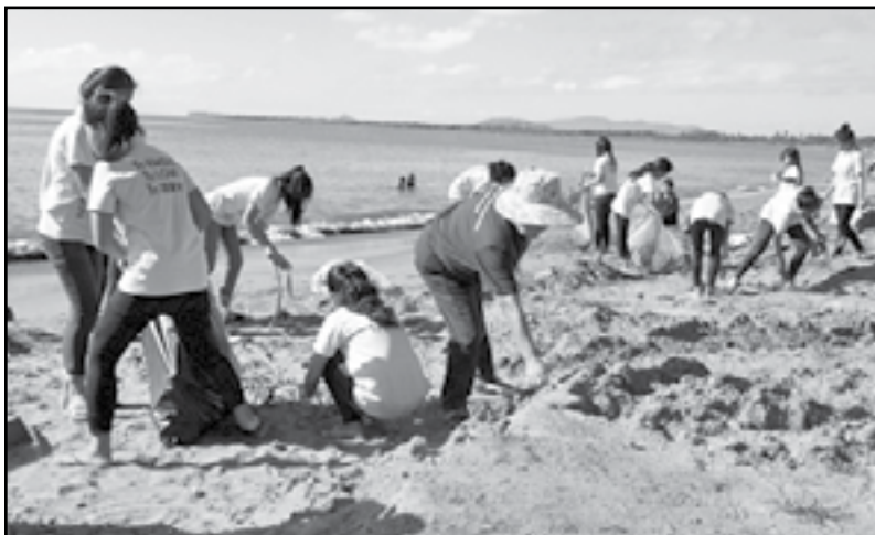
The SMIs and their Tita DMIs in action.