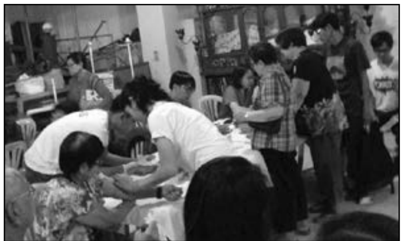
The Operation Health Alert in progress.

A package of laboratory tests for a basic fee of only P250 includes EKG, FBS, total cholesterol, CBC, SGPT, urinalysis, BUN and uric acid. Other tests are available at nominal fees. An Executive Package costs only P1,000.