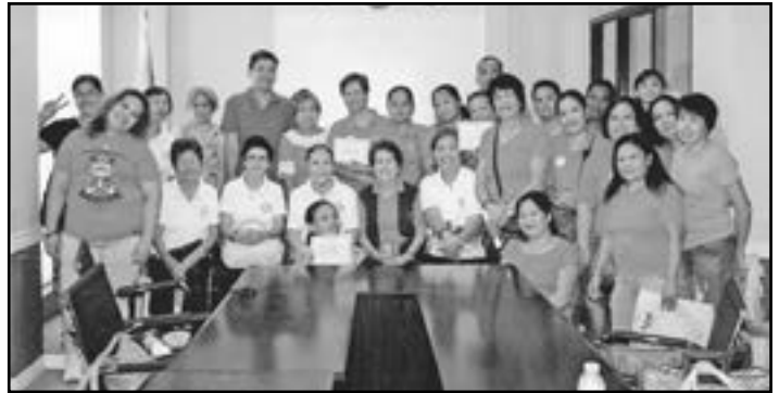
Workshop participants in a group photo with the DMI sisters after the activity.