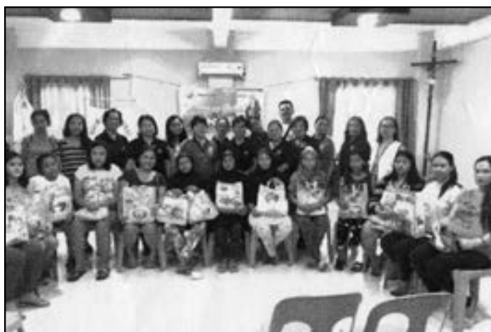
Participants during the ‘Alalay sa Buntis’ Project.

they thankfully received. Tokens of appreciation were also given to the resource speaker and the RHU staff. Serving of simple snacks closed the activity.