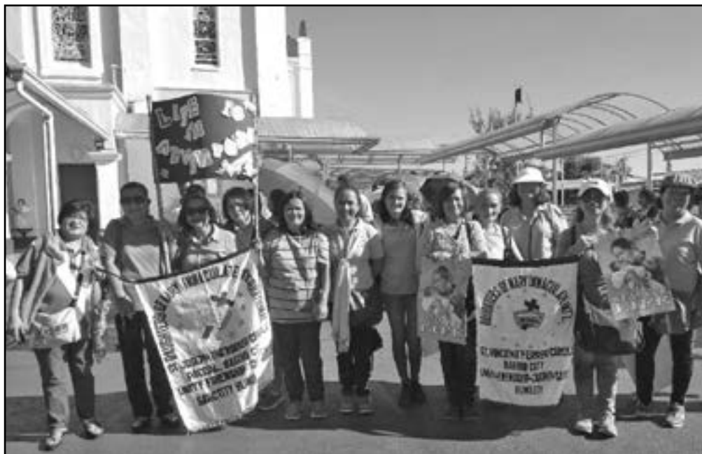
The delegation of the DMIs carrying their circle banners.

In solidarity with the Diocese of Baguio-Benguet, all the DMI circles of Baguio supported the week-long pro-life program that culminated in a Walk for Life on April 28. The participating circles were the St. Joseph the Worker, Our Lady of Atonement, St. Vincent Ferrer and St. Aloysius Gonzaga Circles. The sisters joined some 3,000 others who were clad in green attire symbolizing life. Many held