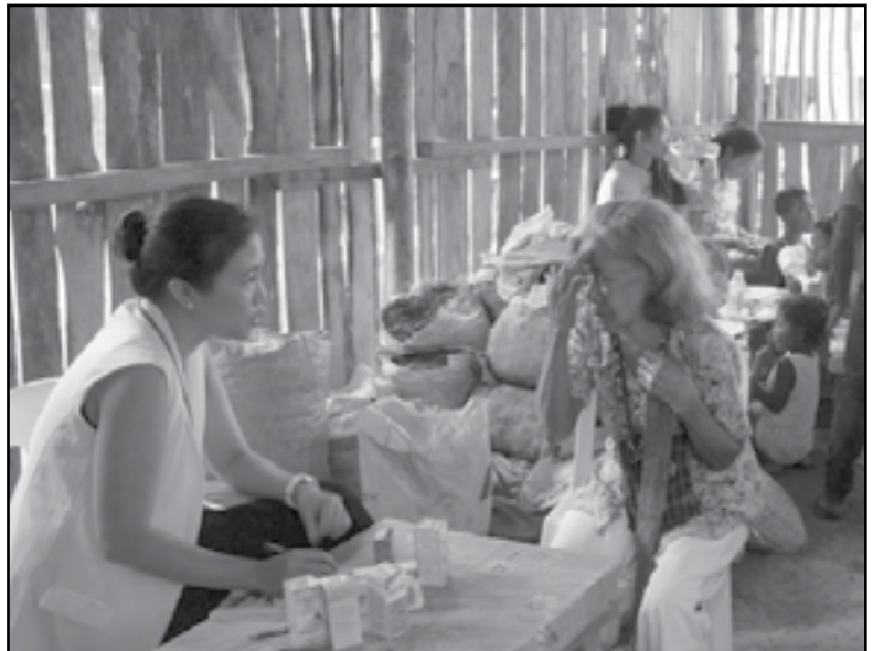
The medical mission in progress

The DMI sisters also prepared food for the community and gave a short orientation on hygiene and sanitation such as washing of hands before eating and proper waste disposal. The 'Mamanwas' were also taught the prayer before meals.