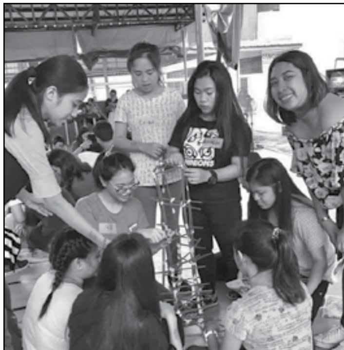
Tower-Building, a group dynamics exercise, teaches the SMIs the values of cooperation, interdependence, strategies and leadership in a team.