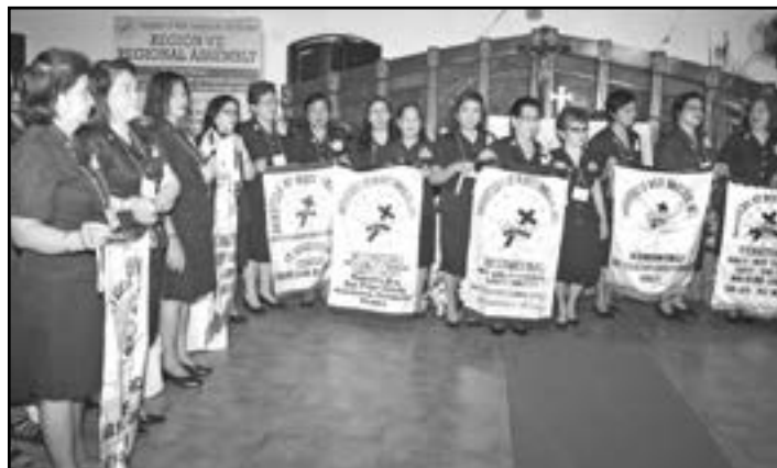
The parade of Circles