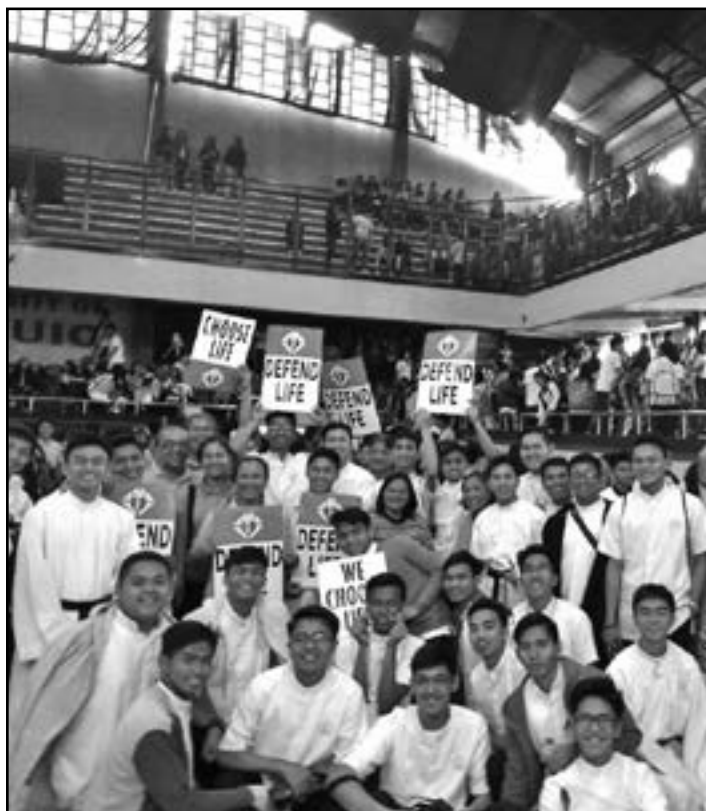
A delegation of young men composed of students and seminarians who joined the Walk.

A week prior to the march, the pro-life organizations in Baguio spearheaded a forum on the teachings of the Catholic Church in addressing the pressing issues that threaten life and family. Venue of the forum was the Maryheights Seminary in Bakakeng, Baguio City. Participating church-based groups exchanged thoughts and ideas in support of the Walk for Life.