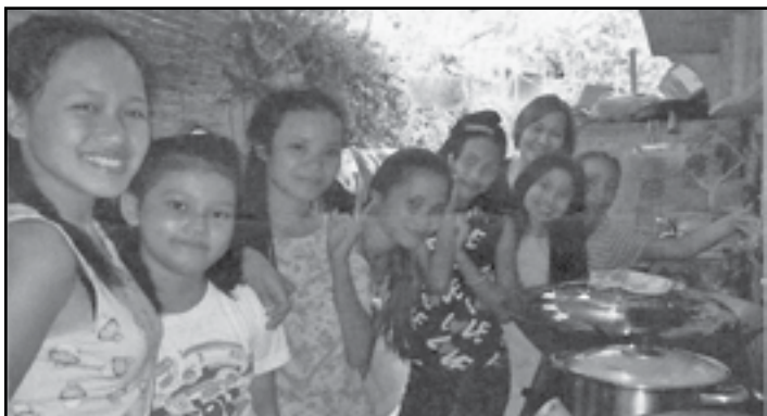
The Squirettes with their Tita DMIs prepare the food that they will distribute to the Badjao families.

During the outreach the Squirettes were able to see for themselves how Badjao families live in their houses on stilts, being very careful walking on the footbridge leading to their houses on the water. They were exposed to the stark reality of how it is to live in poverty and the realization of the need to be "good neighbors" to others. The Badjaos in turn happily and thankfully accepted the food boxes. It truly was Christmas in February!