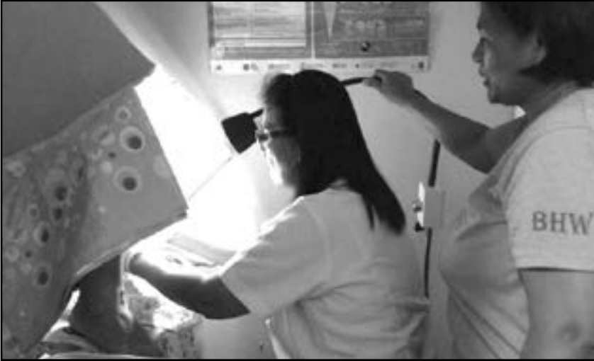
A Pap Smear procedure is being done on one of the project beneficiaries.