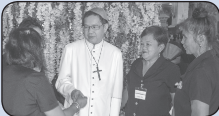
Region 11 Assembly August 19, 2017