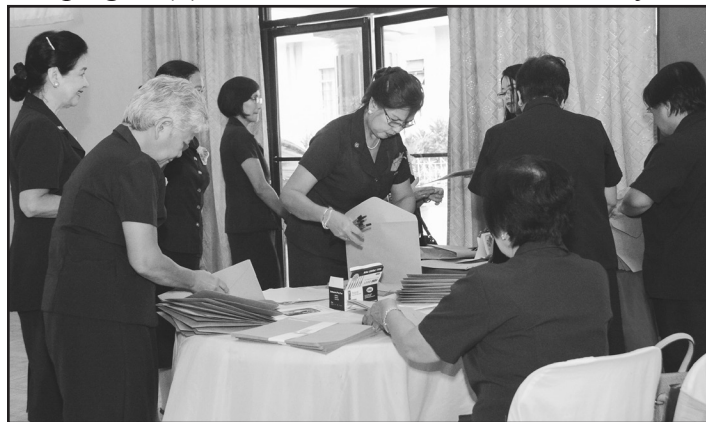
The host committee gets the assembly kits ready.