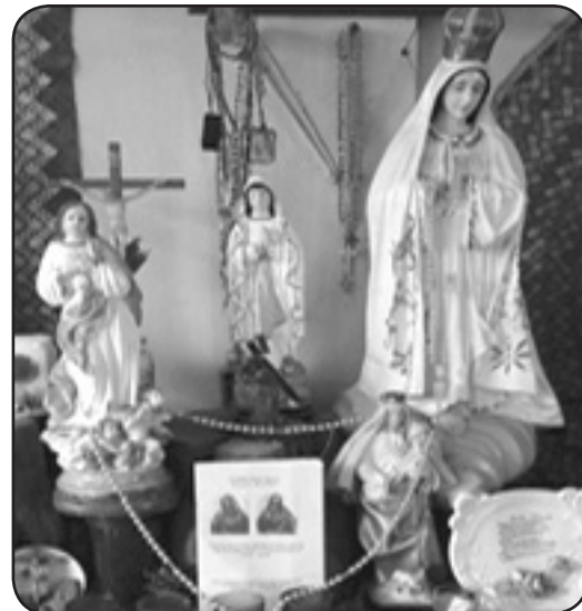
The altar of the Blessed Mother during the 2000 Hail Marys devotion.