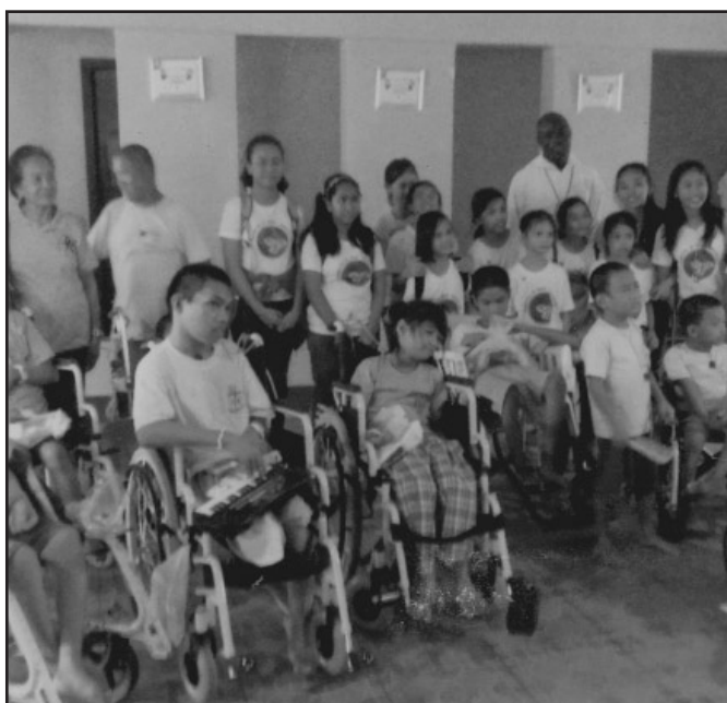
Visit to Missionaries of the Poor Facility. Members of the Mary Mother of the Church DMI Circle and SMI Circlette visited the Missionaries of the Poor facility in San Andres Bukid, Manila to bring cheer to some 150 children staying in the facility.