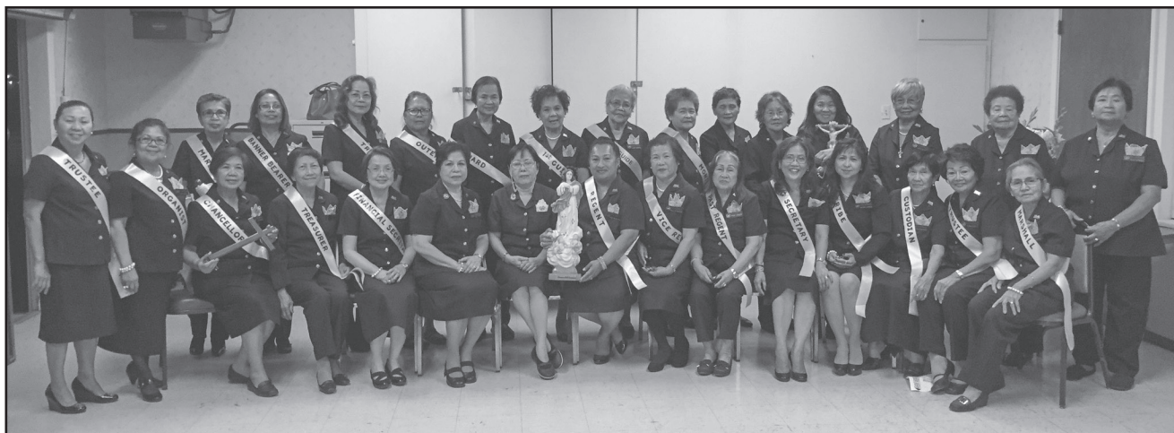
The newly-installed officers of St. Charles Circle