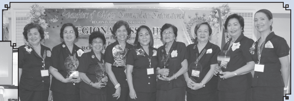
Region IV Assembly - September 16, 2017