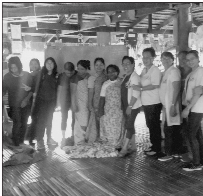
Interaction with Aetas in Botolan, Zambales. The DMI sisters of Mary Mother of the Church Circle of BF Resort Village, Las Pinas City traveled to Botolan, Zambales for their outreach, mentoring and interaction with the Aetas of Botolan.