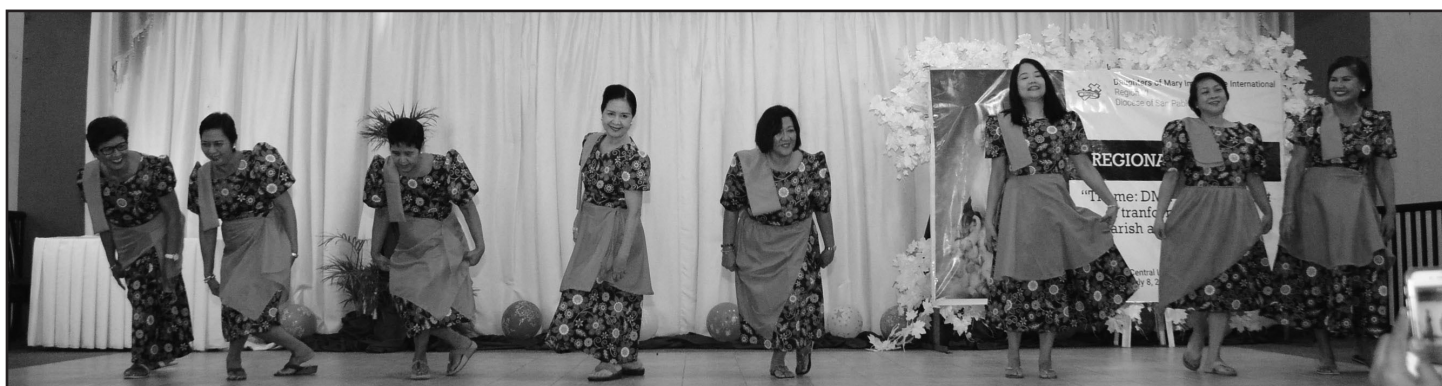
The intermission numbers