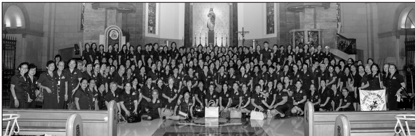
A group photo of the Mass participants before the altar of the Manila Cathedral.

On August 12, 2017, simultaneous Masses were celebrated in the 14 DMII regions of the country as part of the year-long celebration of DMII's 40 th Anniversary.