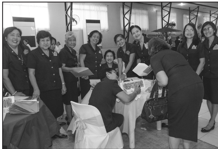
Registration of delegates was brisk.