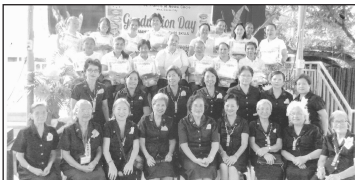
The graduates of the Manicure/Pedicure Training Seminar with the DMI sisters of St. Francis of Assisi Circle during the graduation ceremony.

The seminar ended on May 20, 2017 at St. Claire Hall of the St. Francis of Assisi Parish Church with a simple graduation ceremony. The successful trainees were awarded certificates and a kit each containing the tools and supplies needed to start their livelihood venture.