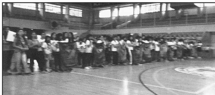
The SMI Sportsfest participants in formation for the opening ceremony.

San Lorenzo Ruiz Circlette of San Pedro City garnered the over-all championship by winning the top position in four of the seven events. The Circlette was also over-all champion last year. The St. Polycarp Circlette placed second and St. John the Baptist Circlette, third place. The top three winners received trophies and cash prizes.