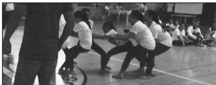
A tug-of-war in progress.