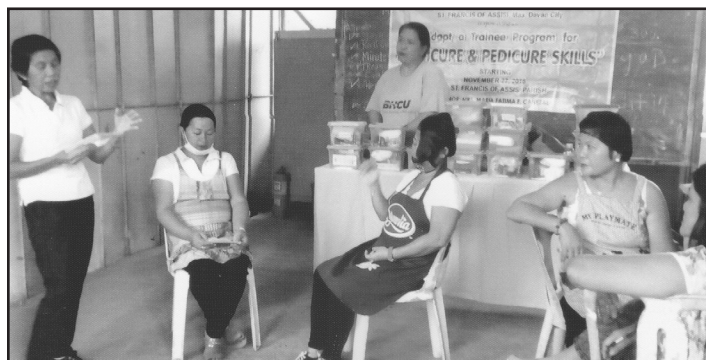
A training session in progress.