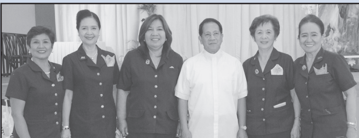
Region VI Assembly - July 8, 2017