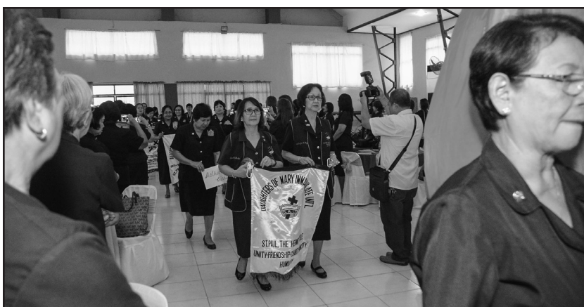
The parade of circles during the opening ceremony.

to draw them away from gadgets; and (4) Values formation and spirituality. The mission focuses on the character of the individual which will help immeasurably in the DMI's goal of shaping good members of society. She asked the DMIs present to adopt these four major projects and to follow the matrix distributed to all the circles earlier in the preparation of quarterly reports submitted to the National Office through their vicarial and diocesan regents to be turned over to their regional representative.