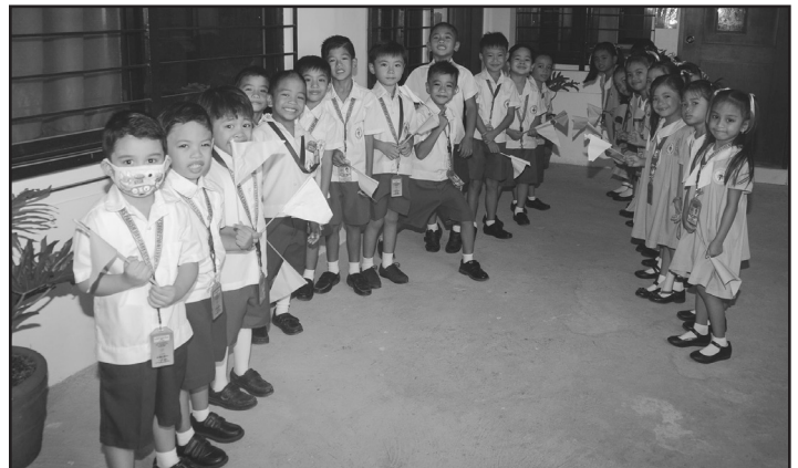
The pupils of St. Martin of Tours Parish Day Care Center wave flaglets as assembly participants arrive.