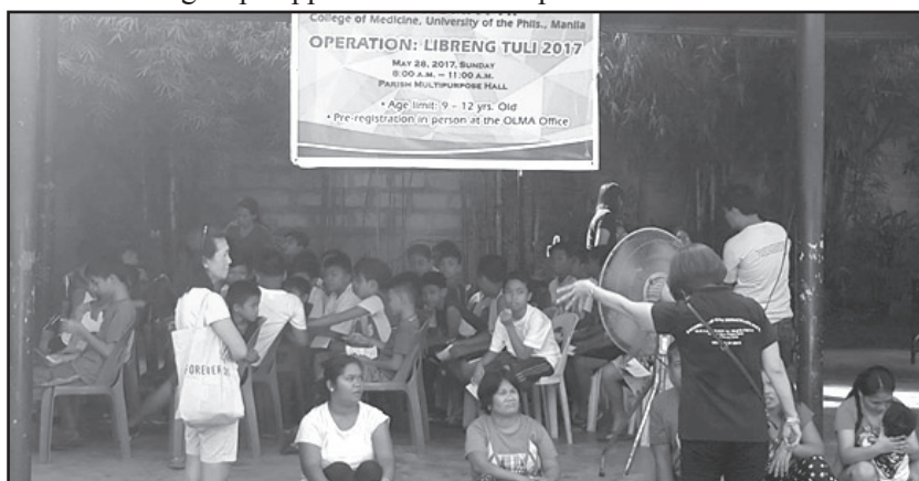
Boys await their turn during the “Operation Tuli” conducted by the Our Lady Queen of Peace Circle.

The parents of the boys thanked the Medical Mission Team and the circle for the free yet high quality service and attention their boys received. For their part, the volunteer doctors, feeling fulfilled and satisfied, said that this project of the Our Lady Queen of Peace Circle is one of the best in terms of group support and facilities provided to them.