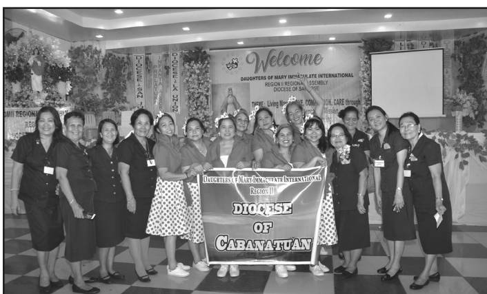
The Diocese of Cabanatuan, dance contest first prize winner.

most effective tool in promoting the organization to its internal and external publics.