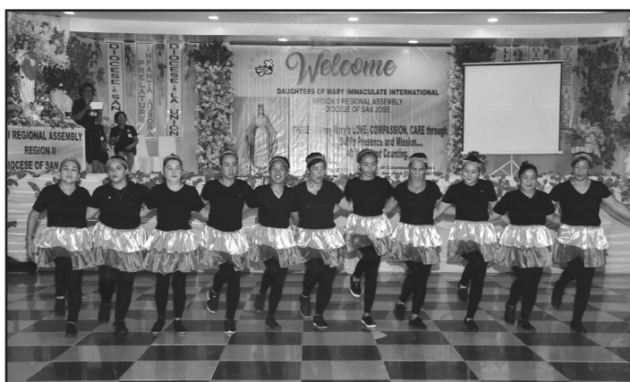
The Archdiocese of Lingayen-Dagupan, second place winner.