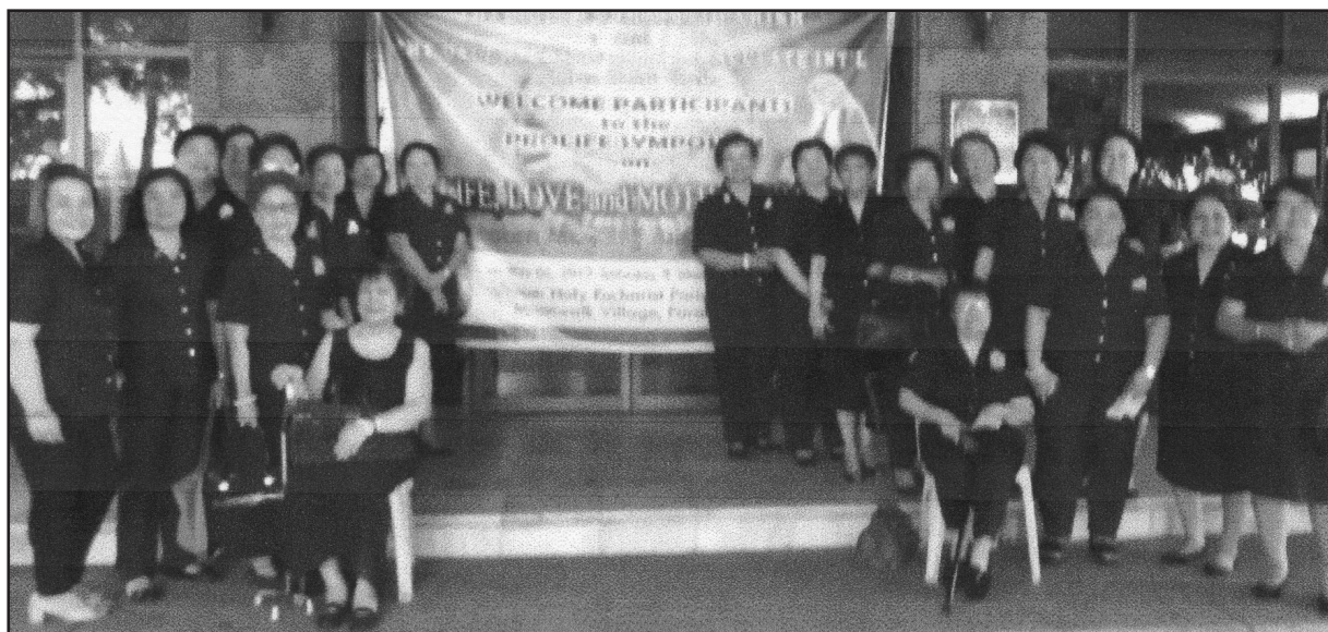
The symposium hosts – the officers and members of Risen Christ Circle.