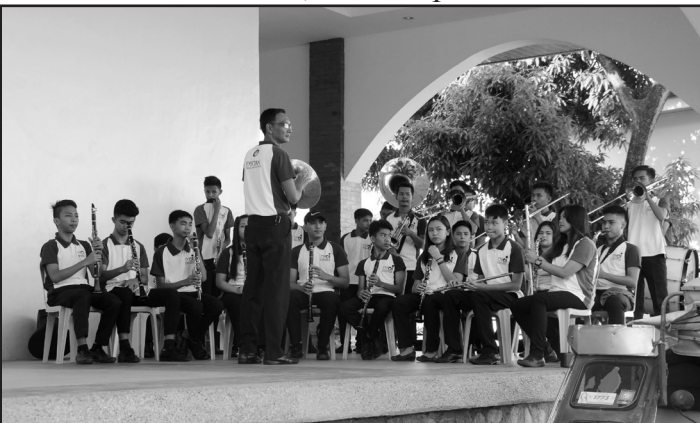
The Dr. Yanga College Band plays Marian music to welcome assembly participants.