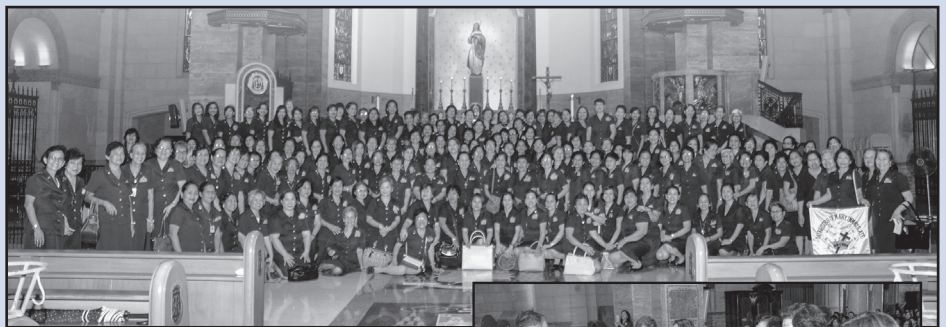
40th Anniversary Mass at the Manila Cathedral August 12, 2017