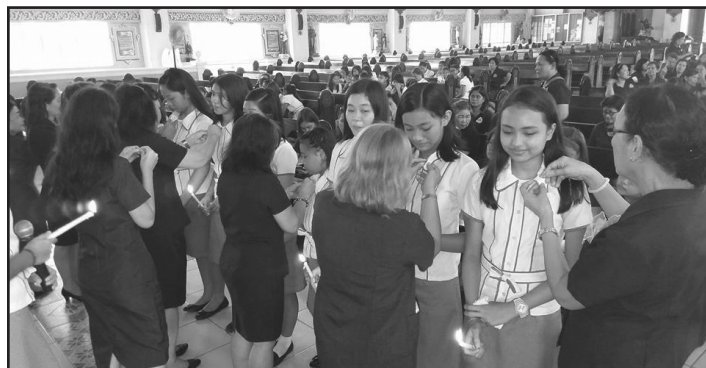
Squirettes during their investiture ceremony.