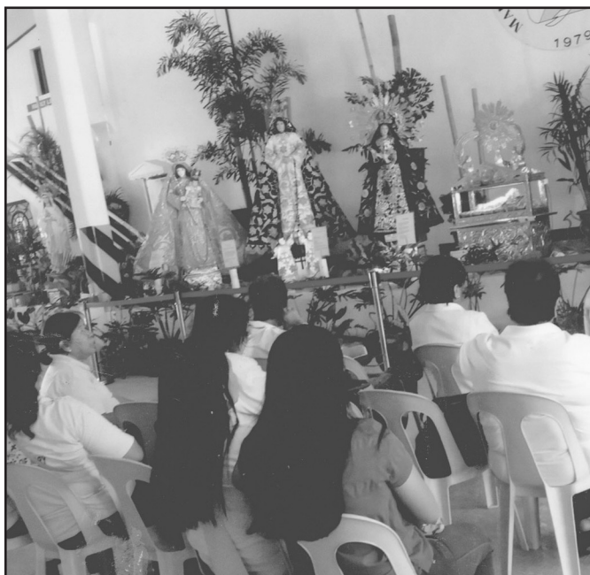
Oktoberfest for Mama Mary. A prayer vigil was held at the Plaza de Maria of Mary Mother of the Church Parish. The MMC Circle was assisted by students of Alternative Learning System (ALS) that it sponsors.