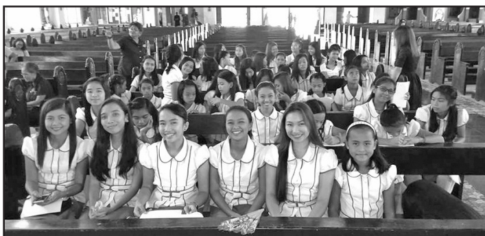
The Squirettes get ready for their investiture.