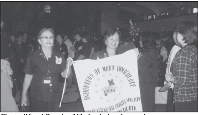
The traditional Parade of Circles during the opening ceremony

The good Monsignor said that service is what life is all about, service after Jesus's example, which is unconditional service. "One who follows God lives peace, serving and loving not only his friends but also his enemies," he continued. He likened such a person to a rainbow which is a symbol of hope and peace, uplifting and peaceful. Invoking the virtues of friendship and charity, he said that DMIs must be disciples of peace and renewal, anchored on the Word of God which purifies, obligates and renews. He concluded his speech with the message: "As DMIs, commit yourselves to be SERVANTS of Mary, of Jesus and of others."