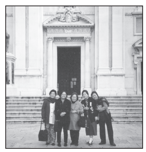
The six Filipino pilgrims in front of the Basilica

Upon entering the Basilica through its huge solid brass doors, one will have to pass through 13 small chapels along the