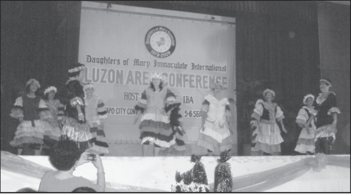
Intermission numbers during the Fellowship Night were dance presentations by the different regions.