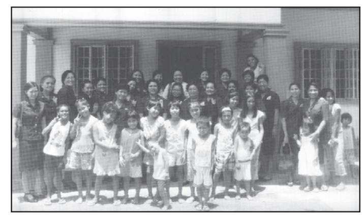
Orphans of Bahay Kalinga ng Bukal with the DMI sisters