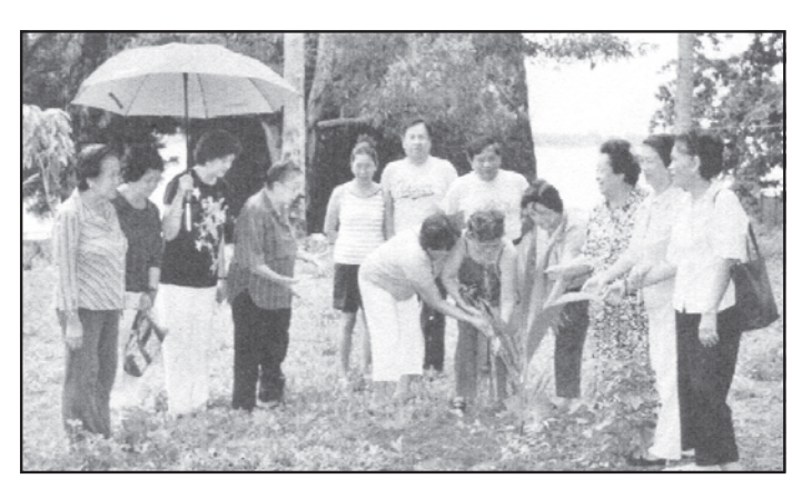
Tree-planting in Bgy. Sabangan in Santiago, Ilocos Sur.