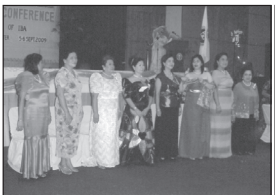
The Ms. DMI Luzon '09 candidates representing the eight regions of Luzon