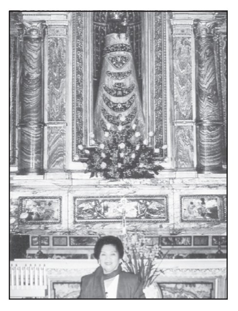
The author in front of the Shrine of Our Lady of Loreto inside the Holy House

In its original form, the Holy House has only three walls because its eastern side, where the altar stands, opened onto the Grotto. The three original walls rise only to a height of three meters. The masonry grave, made of local bricks, was added