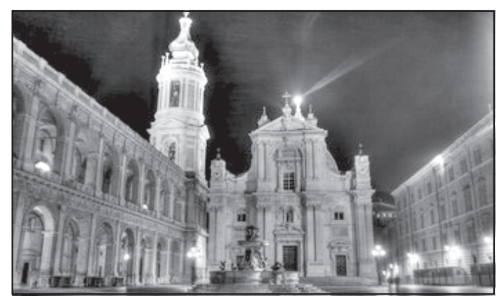
A full view of the Basilica of Our Lady of Loreto

Over the years, numerous artists have worked to embellish the Shrine, which has become the favored destination of millions of pilgrims and whose renown has spread rapidly throughout the world.