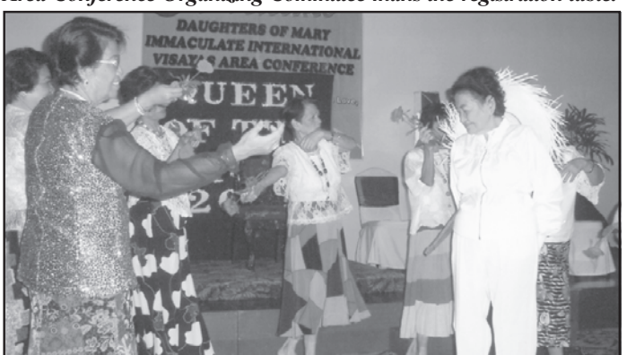
An intermission number presented by the Sto. Nino de Cebu Circle.