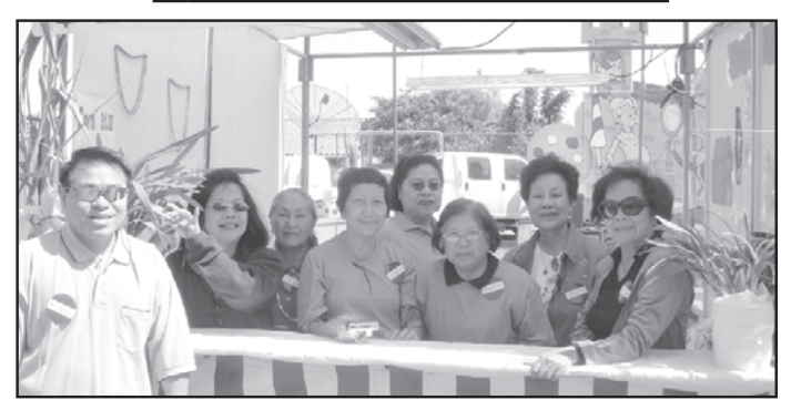
The DMI Corn-on-the-Cob Booth at the Annual Parish Bazaar.