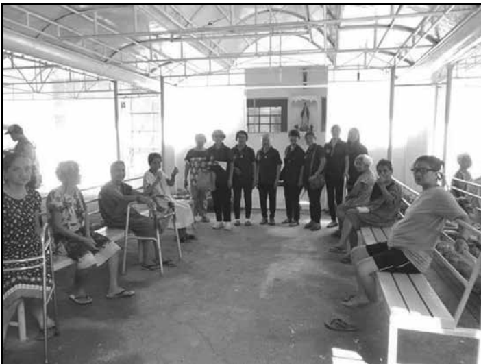
Visit to Bahay Kalinga