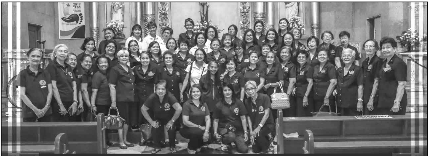
The DMI sisters who attended the symposium.