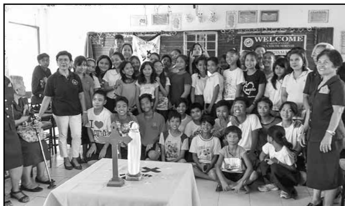
The seminar participants with the DMI sisters and guests.