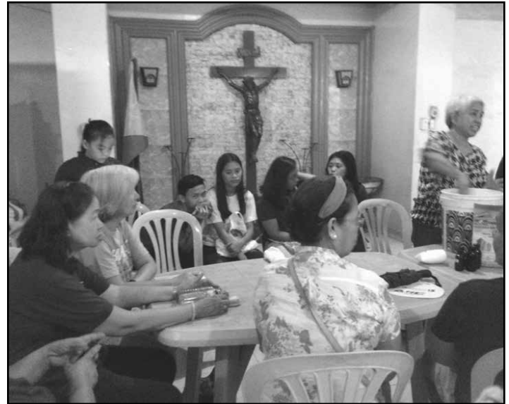
Liquid Dishwashing & Fabric Conditioner Workshop