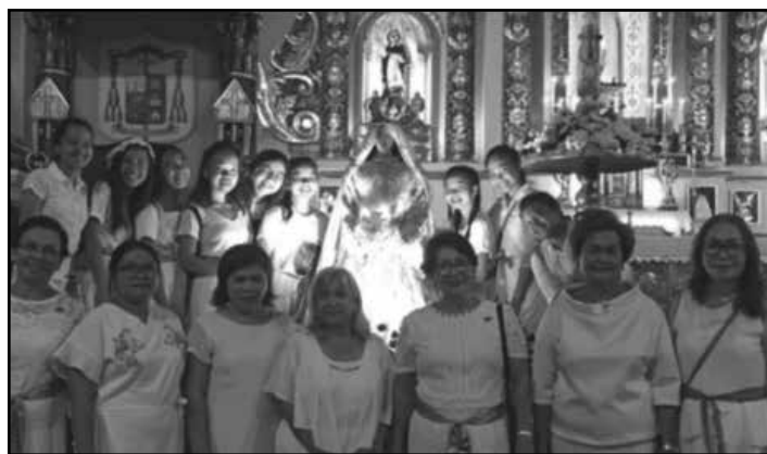
The procession capping the month-long Flores de Mayo celebration led by the DMIs and SMIs of the San Jose de Tagbilaran Circle and Circlette.