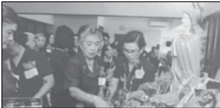
The enthronement and consecration of the Blessed Mother's image.