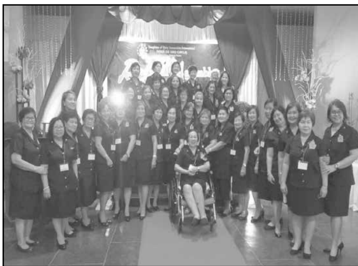
Mina de Oro Circle, the Assembly host