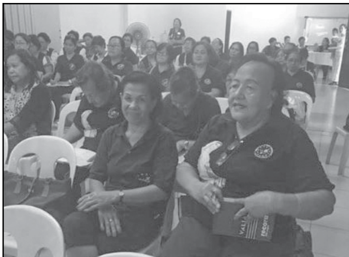
The seminar participants