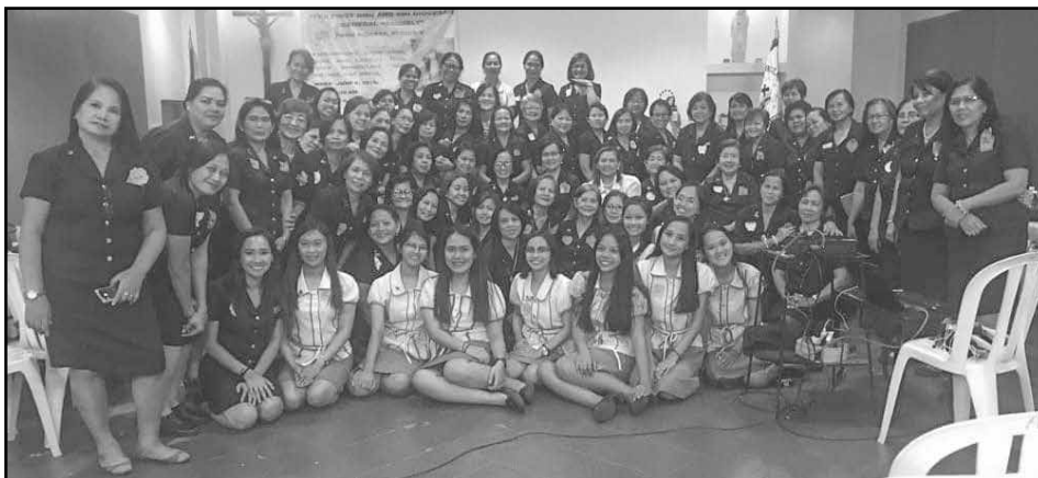
The participants in the Diocesan General Assembly.

Intermission numbers were presented jointly by the DMIs and the SMIs.