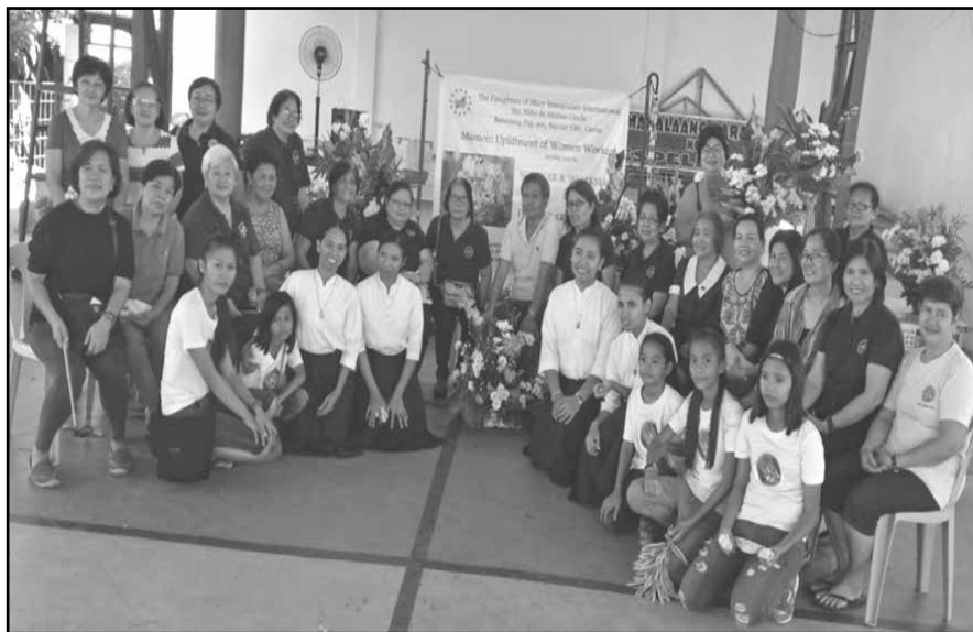
The participants of the Flower Arrangement Workshop

The workshop gave the participants the opportunity to set up a flower arrangement business to help augment the family income. The Sto. Nino de Molino Circle gauged the workshop’s success through the additional skills the participants learned and their enjoyment while learning the skill.