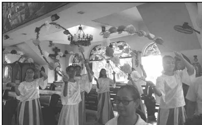
The Squirettes present a dance number during the program held.