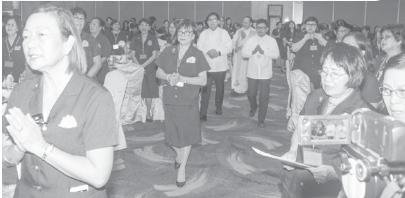
The Mass processional