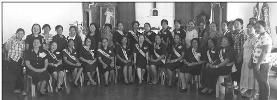
The newly installed officers and members of the Our Lady of the Assumption Circle with officers of their mother circle, the Mother of Perpetual Help Circle.

The Our Lady of the Assumption Circle has just been organized in Culianan Parish in Zamboanga City. It is the 34 th DMI circle in the Archdiocese. The Mother of Perpetual Help Circle of Guiuan is its mother circle. The new circle's charter officers were installed last March 31, 2019.