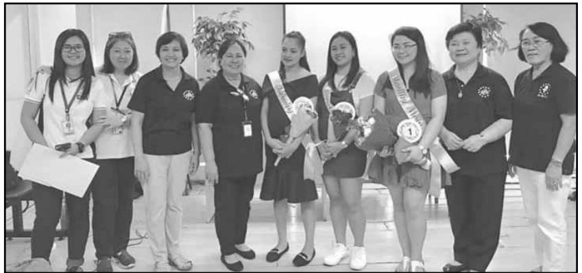
The Gandang Buntis winners with the St. Paul of the Cross Circle sisters.

A highlight of the seminar was the Gandang Buntis, a contest among seminar participants, leading to the selection of the most beautiful and healthy expectant mother.