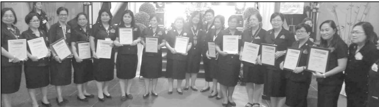
Regents representing their respective circles receive plaques of appreciation for their attendance in the assembly.