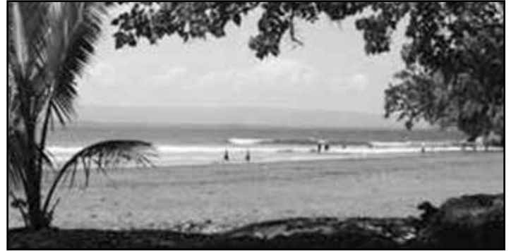
The shoreline of Bgy. Calanguasan that the Nuestra Senora de la Ermita Circle DMIs maintain through their Coastal Clean-up Drive.

The Nuestra Senora de la Ermita Circle of San Antonio de Padua Parish joined the occasion through the circle's clean-up project along the shoreline of Bgy. Calanguasan. The site is in the heart of the town of Casiguran in Aurora Province which is vulnerable to the different harmful activities of the community. It is part of the circle's Pro-Life Committee thrust of caring for the environment. The circle maintains the cleanliness of the shoreline