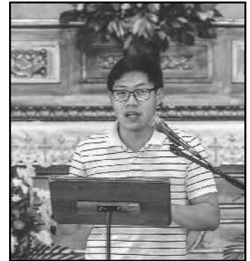
The symposium speakers