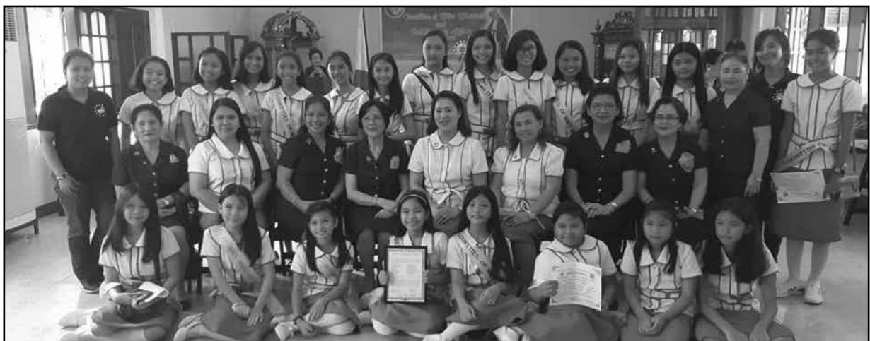
The Squirettes of the St. Catherine of Siena Circlette having the biggest number of new recruits.