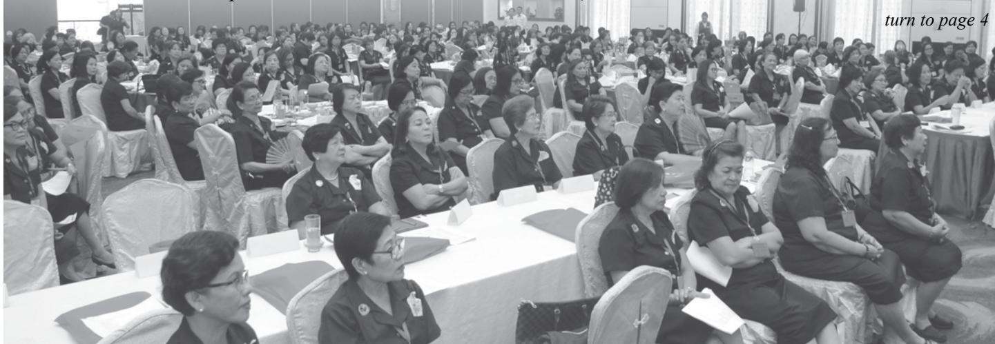
Close to 400 DMI sisters from all over the country during the National Officers' Meeting