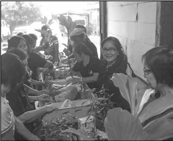
Herbal Plant Gardening Project of Sta. Clara Circle