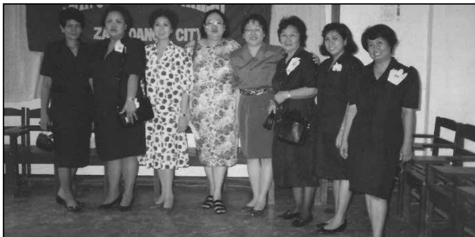
The charter officers of St. Joseph Circle.