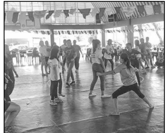
Palarong Pinoy by Squirettes of the Diocese of Antipolo

Palarong Pinoy held on June 15, 2019 was a diocesan activity of the Squirettes of Mary circlettes. Participants in the Palaro were the SMIs of St. Paul of the Cross, Our Lady of the Abandoned and St. Gabriel of Our Lady of Sorrows Circlettes who enjoyed the old Filipino games such as patintero, piko, luksong-tinik, Chinese garter, etc.