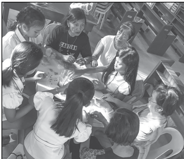
The Squirettes at work.