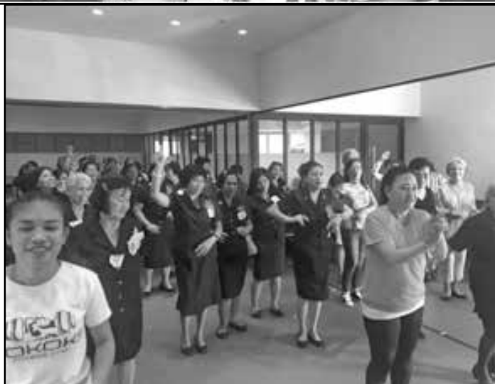
Dance presentations during the afternoon fellowship.

age, never lose their energy and grace while swaying and sashaying to the rhythm and beat of the music that the band played.