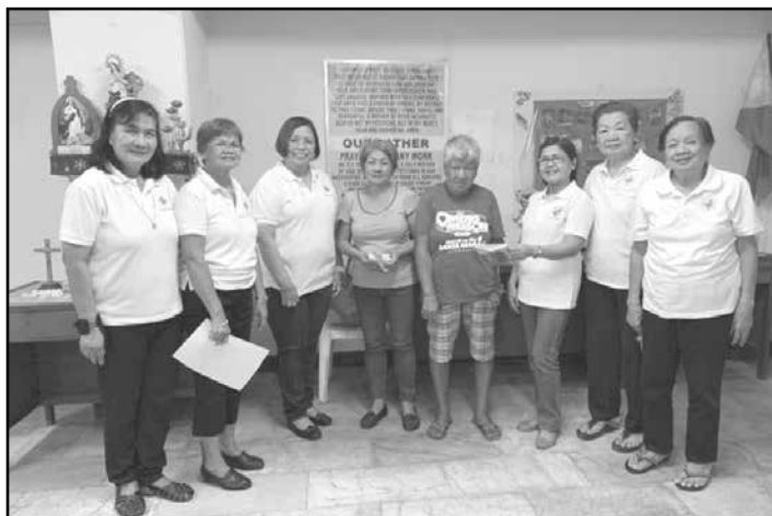
Visit with prisoners' families by the Ina ng Grasya ng Diyos and Our Lady of Consolation & Cinture Circles