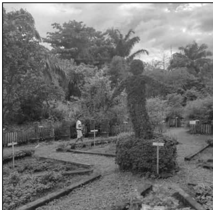
Medicinal Plants Garden of UPLB's Institute of Crops Science.

Dr. de Guzman later conducted a tour of UPLB's Medicinal Plants Garden and gave the participants plant samples and planting materials.