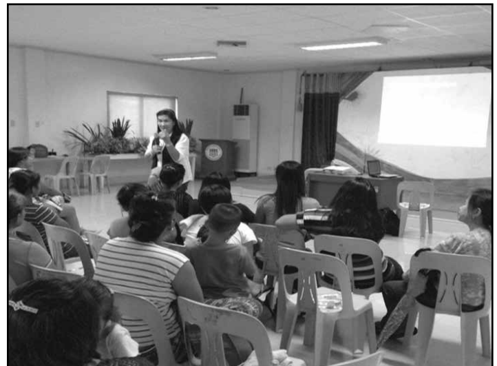
Seminar-workshop for Barangay Health Workers