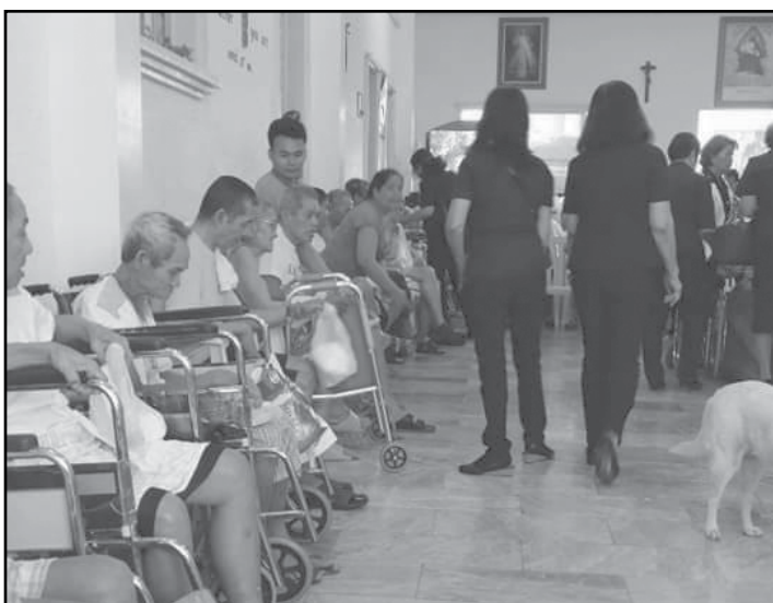
House residents receive gift packages from the visiting DMI sisters.