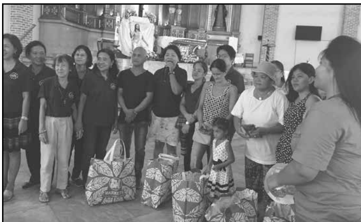
Distribution of gifts to female detainees to celebrate Mother's Day.

It was an immensely enjoyable activity, both for the DMI sisters and their beneficiaries who gratefully received the Love Bags containing rice, frozen chicken and groceries given by the DMIs.