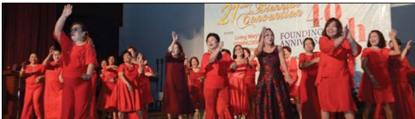
The past IRs and International Board perform a surprise dance number.