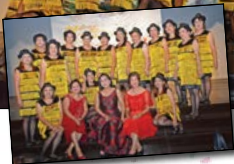
Dance Exhibition by Region IX