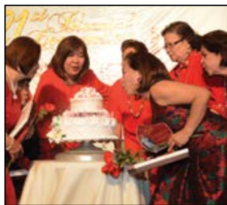
The ceremonial candle blowing of the anniversary cake by the past International Regents