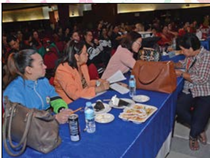
The contest Board of Judges at work