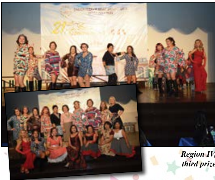
Region IV, third prize