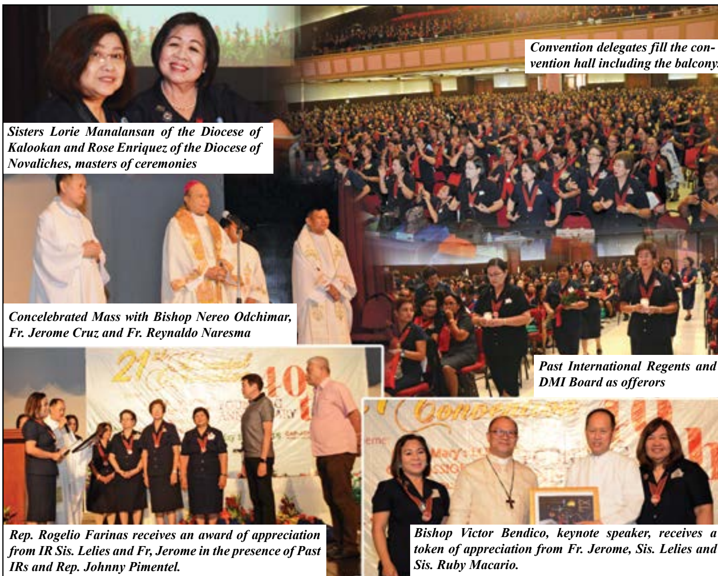
Convention delegates fill the convention hall including the balcony.