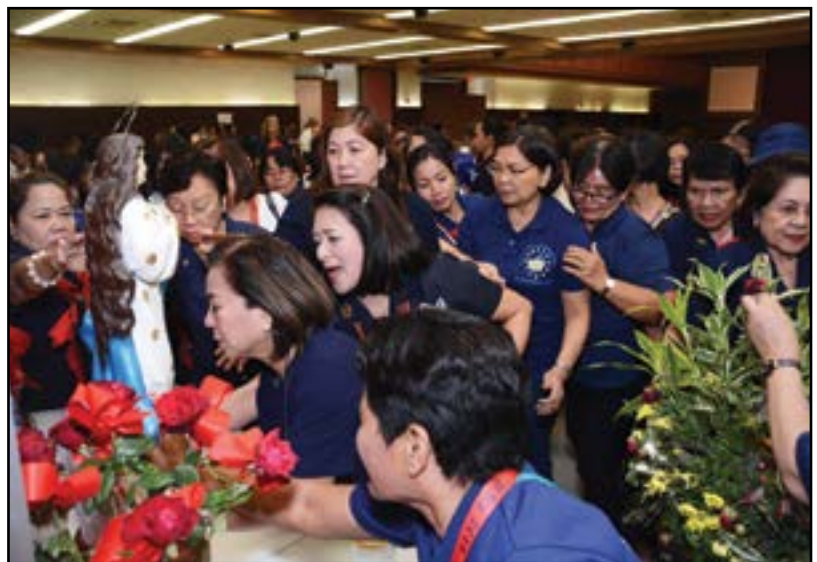
Delegates bid good-bye to Mama Mary during the recessional.