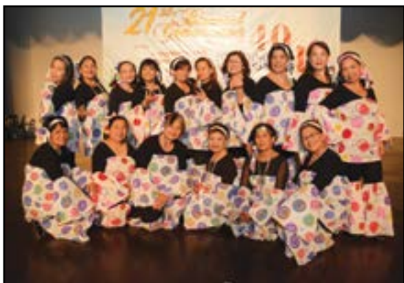
The Fellowship Night

Then came the much awaited contest on Regional Presentations, the piece d' resistance during every DMI Fellowship Night, The contest was won by Region VII – first place, Region III, second place and Region IV – third place. (See separate pictorial on Regional Dance Presentations on page 16.)