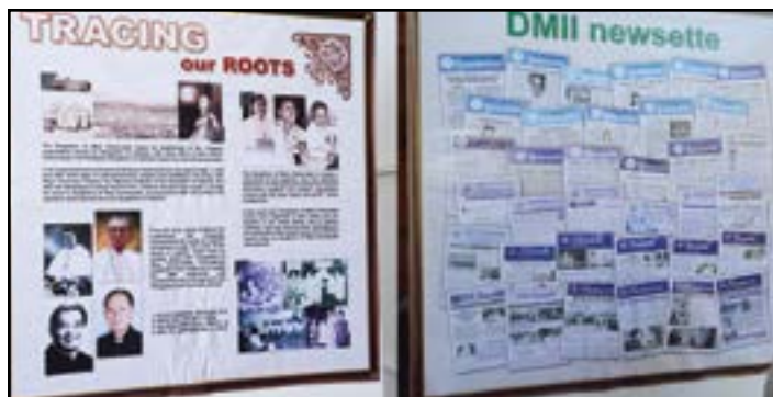
Part of the DMI historical exhibit at the convention hall lobby

The Kalinga Folkloric Troupe, a group of cultural dancers from the Baguio City National High School, performed a welcome dance featuring the various tribal dances in the upland areas of Northern Luzon.