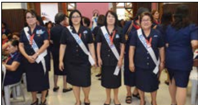
The ceremonial guides prepare for the opening ceremony.