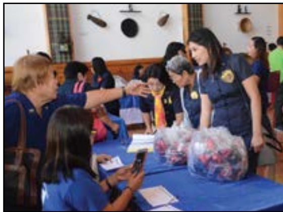
The registration of convention delegates