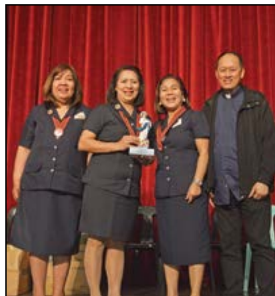
The Star Circle awards