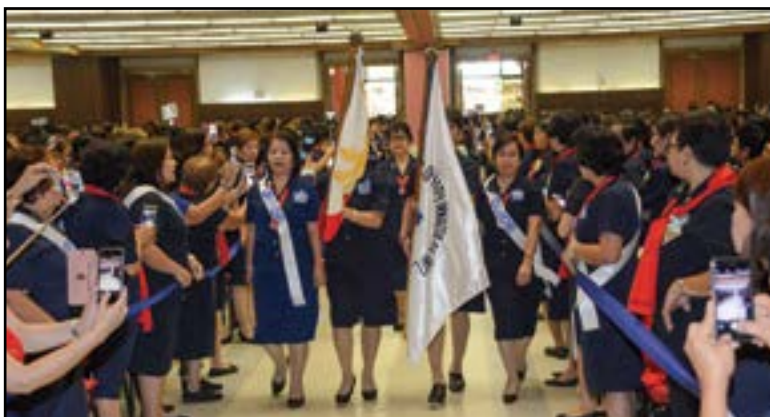
The Parade of Colors