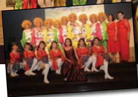
Region VII, 1st prize winner