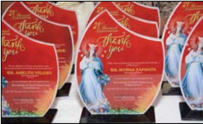
Plaques of appreciation to be awarded to the Past International Regents.