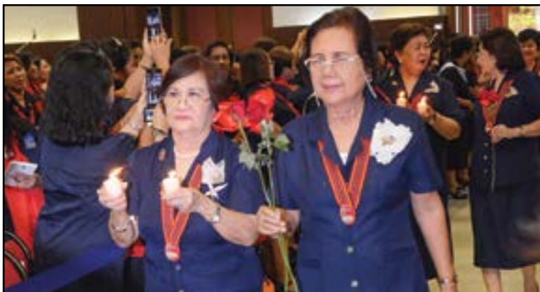
The candle and flower bearers