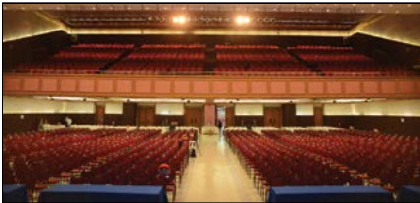
The CAP Convention Hall is readied for the 2,000 DMI delegates.