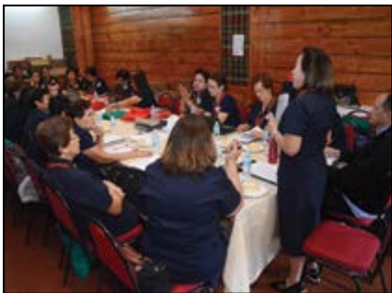
The DMI International Board in session