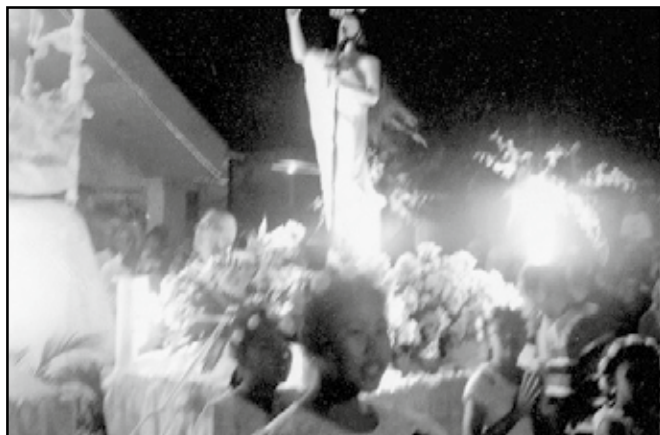
Squirettes of Mary as angels during the “Salubong”

The Mary Mother of the Church Circle of BF Resort Village, Las Pinas City figured very actively in the celebration of Easter in the parish sponsoring various events on Easter Sunday, April 16, 2017. The Squirettes of Mary took part in the traditional Salubong as angels rendering songs and dancing during the Easter procession. Later in the morning, they treated children of the parish to an Easter Egg Hunt with prizes given to the kids.