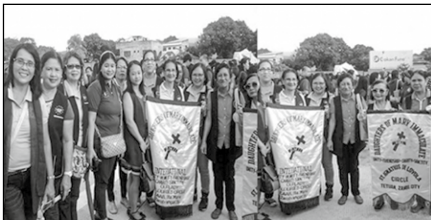
The DMI sisters gather at the KCC Carpark for the “Dia de Mujeres.”

Twelve women shared their experiences in implementing change in their workplaces to show that women can do what men do, thus serving as inspiration to those who attended the activity. The event ended with a zumba session.