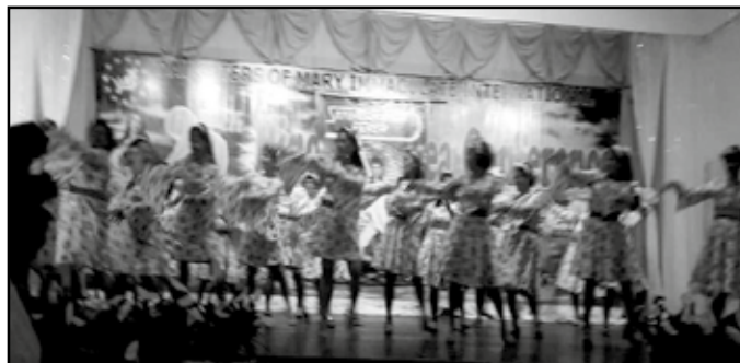
The conference hosts, the Diocese of Cagayan de Oro sisters, perform an intermission dance number.

Aside from the dance contest, an on-the-spot beauty contest meant to be a fund-raiser was also held. The top spot was won by Region XIII which was able to raise and donate the highest amount followed by Region XII, then Region XIV.