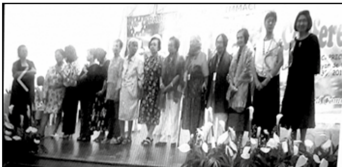
DMI sisters who received loyalty awards for many years of committed service to the organization.

elderly, protection of the environment, promotion of health and wellness, natural family planning and breastfeeding, etc. She also called on the DMI sisters to fully and continuously support the position of the Catholic Church and DMII's campaign: "NO to Death Penalty".