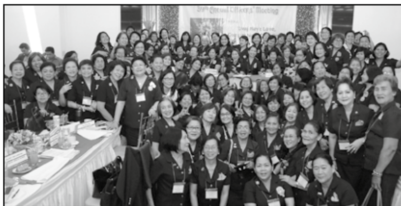
Part of the meeting delegates in a group photo.