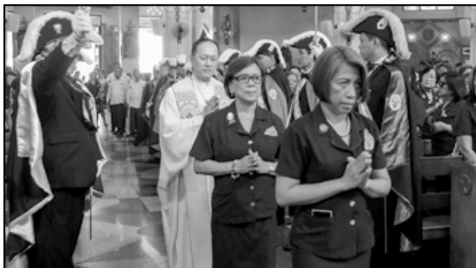
The Mass processional with KC members as honor guards.