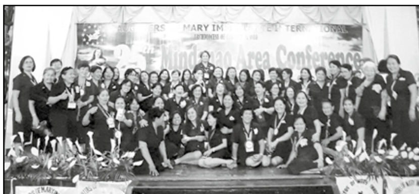
DMIs of the Diocese of Cagayan de Oro, conference hosts.