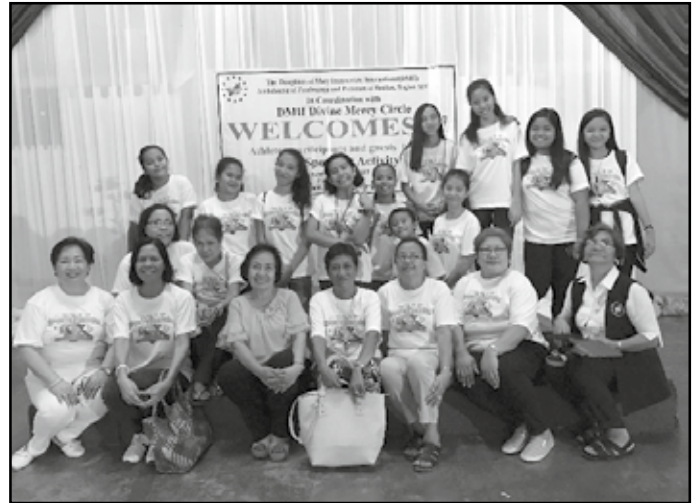
The DMI Mother of Mercy Circle and SMI Mother of Mercy Circlette of Divine Mercy Parish, hosts of the sportsfest.

A new SMI circlette, the St. Therese Circlette was also organized in May, 2017 at Mampang Parish.