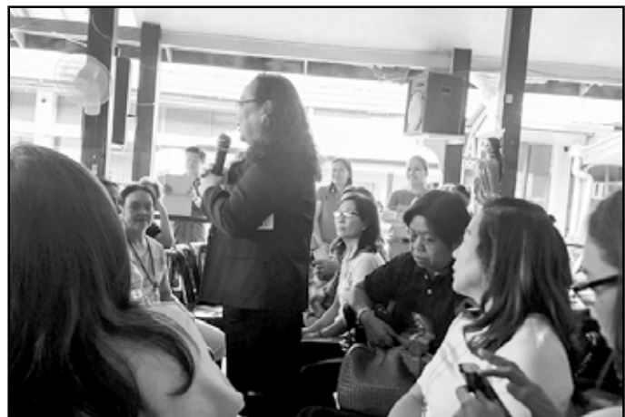
Department of Health Secretary Rossel Ubial also came to greet the women inmates.