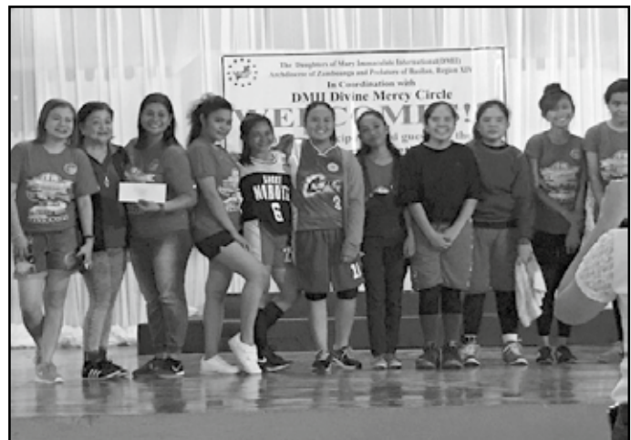
Sportsfest Over-all Champion, the Nuestra Senora del Pilar Circlette.