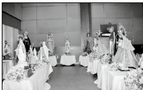
Marian Exhibit during the Region V Assembly