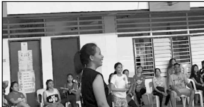
The Squirettes at play during the Sportsfest.