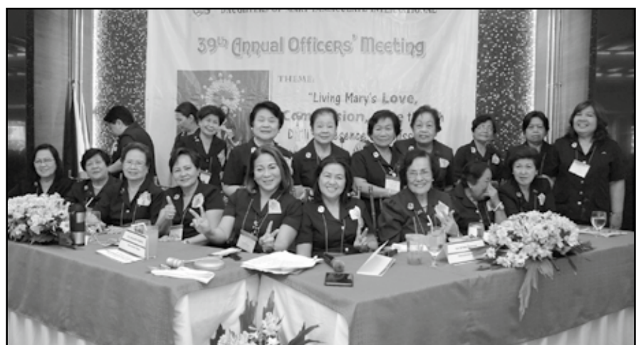
Members of the International Board, past and present, in a group photo onstage.