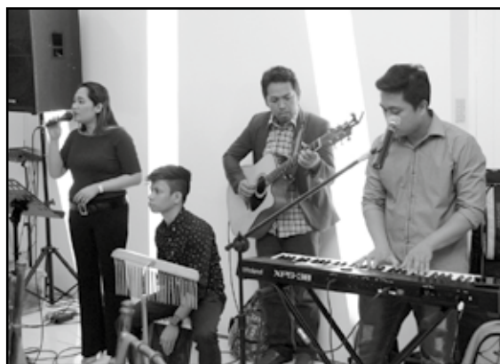
The Alterblare Acoustics Band provides musical entertainment during the lunch hour.