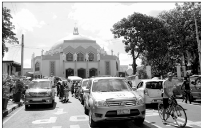
Motorcade to Jamesville Resort for the Annual Officers' Meeting.