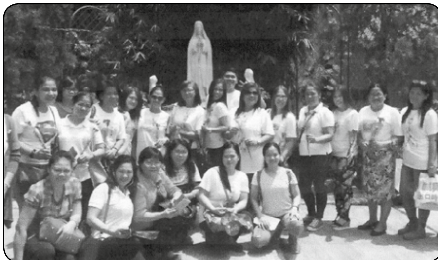
The officers and members of the Our Lady of Fatima Circle of Macau.