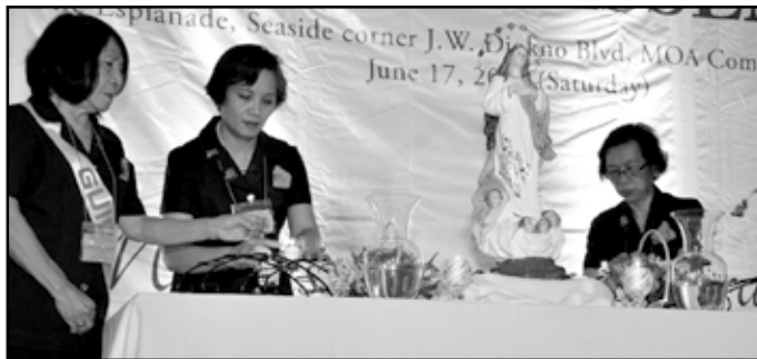
Candles are lit at the altar of the Blessed Mother.

The talks of subsequent speakers who spoke that day carried this central message revolving around the assembly theme "The DMI as Active Agent of Transformation in the Parish and Communities".