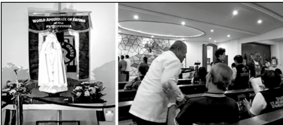
The pilgrim image of Our Lady of Fatima stands on the altar. . . as prayer vigils are held by the DMIs of the Archdiocese of Zamboanga.

In celebration of the 100th Anniversary of the Fatima Apparitions, the World Apostolate of Fatima of the Philippines has been bestowed its own pilgrim image of Our Lady of Fatima from Fatima, Portugal. The image visited Zamboanga from March 31 to April 3, 2017 and was welcomed with a Holy Mass on the first day at the Our Lady of Fatima Parish in Manicahan, Zamboanga City. A prayer vigil spearheaded by the DMI Diocesan officers followed afterwards, participated by various religious organizations in the parish.