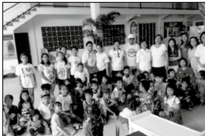
Participants in the Easter Egg Hunt and their sponsors.