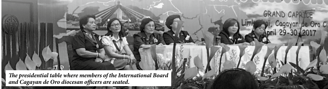
The presidential table where members of the International Board and Cagayan de Oro diocesan officers are seated.