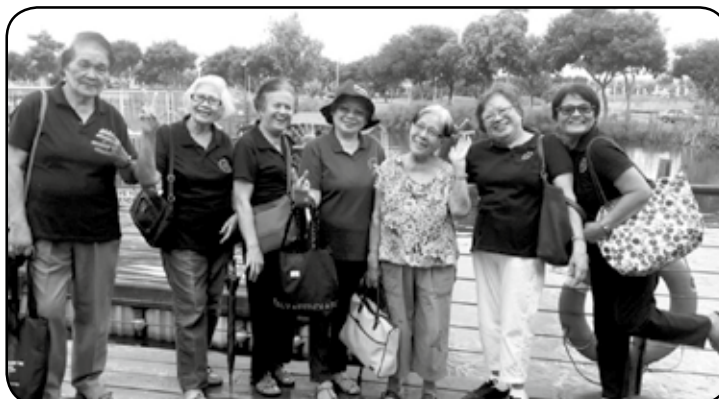
The septuagenarian sisters of Our Lady Queen of Peace Circle.