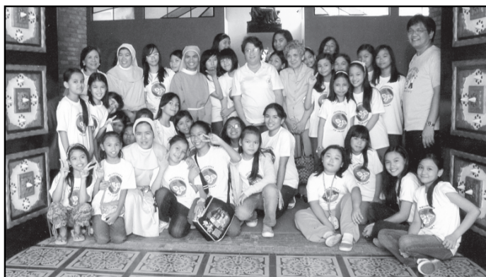
The group poses before the altar of the Shrine of Padre Pio in Sto. Tomas, Batangas.