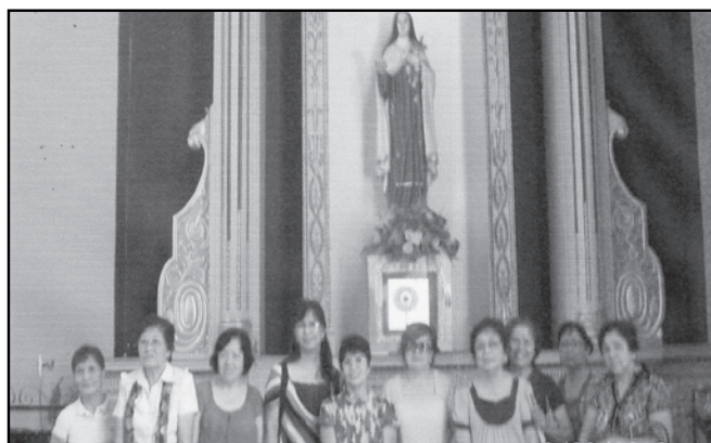
The members of the Queen of Flowers Circle in front of the image of St. Therese of the Child Jesus.

Our last destination was the Church of Jesus, the Way, the Truth and the Life in the Reclamation Area near the Mall of Asia in Pasay City. The church was closed when we arrived and the guard said it will open at 3:00 p.m.. We used the time to go malling in MOA, window-shopping, sight-seeing and having some refreshments. All too soon, it was 3:30 p.m. and we returned to the church. After saying our last prayers, and of course, some photo ops like we did in all the churches we visited, it was time to head for home. The pilgrimage was well worth it. Everyone of us felt full of the Holy Spirit for having gone on that spiritual journey.