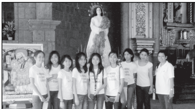
The SMI members pose before the image of Mama Mary in one of the churches they visited.

Capping their summer activities was their participation as "big" angels in the Parish Santacruz held on the last Sunday of May.