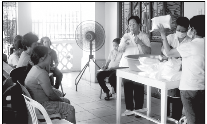
The demo-seminar on detergent powder soap-making for mothers of scholars of St. Philomena Foundation

Venue of the activities was the San Ildefonso Parish