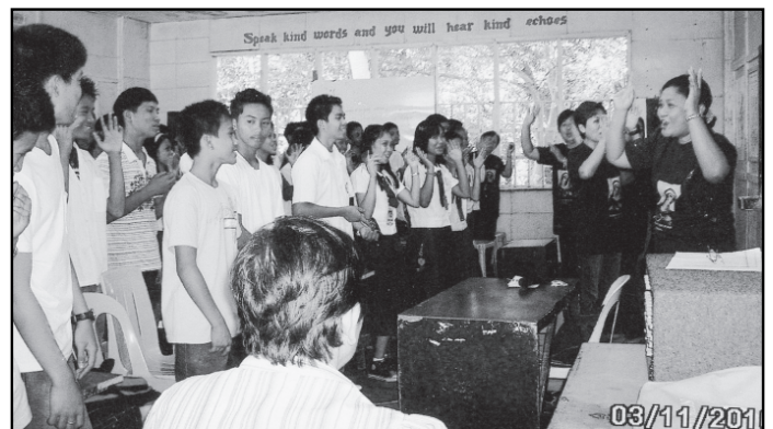
Pro-Life Seminar for students of Northwestern Colleges.