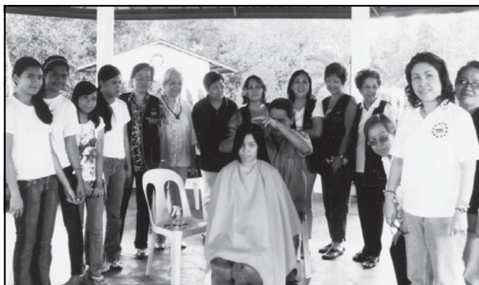
The "Gunting at Suklay" livelihood seminar spearheaded by the Upliftment of Women Workers Committee of the Circle.