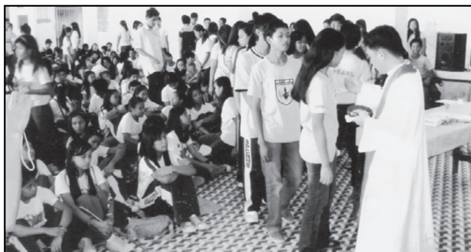
A Eucharistic celebration ended the lenten recollection of 400 graduating students of City High (Lakeside) sponsored by the Circle.