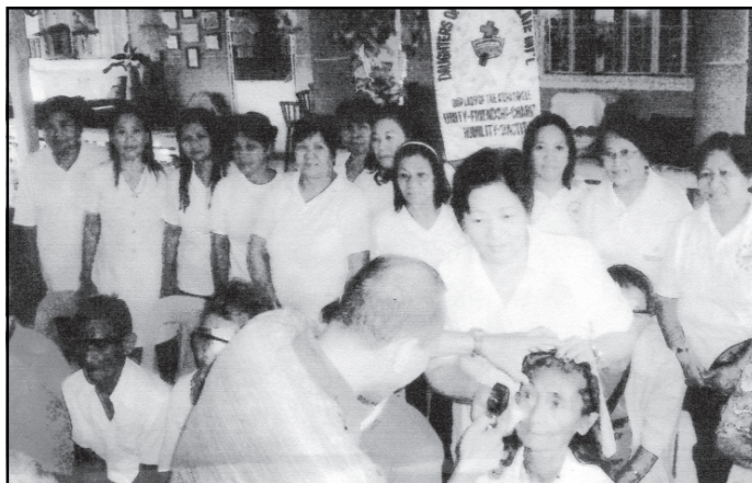
A volunteer doctor attends to an eye patient. In background are members of the Our Lady of Atocha Circle who assisted in the mission.

Last February, the Circle sponsored free ECG and blood sugar screening for some public schools and indigent residents also through the Lucas-Paguila Medical Clinic & Hospital.