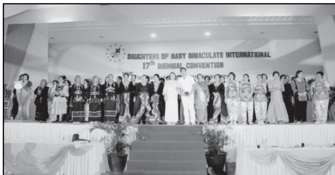
Participants in the dance presentations by Region XIV, convention hosts during Bienvenido Night.