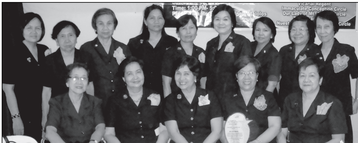
The diocesan officers of the Diocese of Malolos (Region IV)