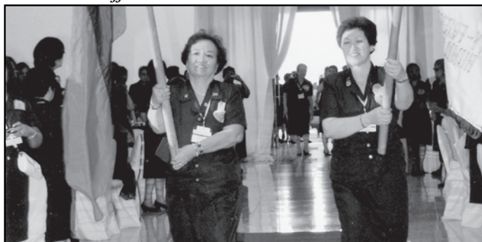
The entrance of colors signals the start of the opening ceremony.