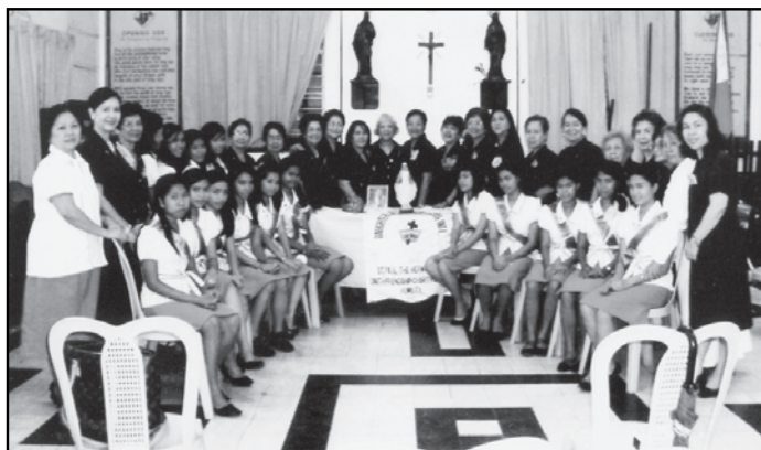
The newly-invested Squirettes of Mary members with members of the Circle.