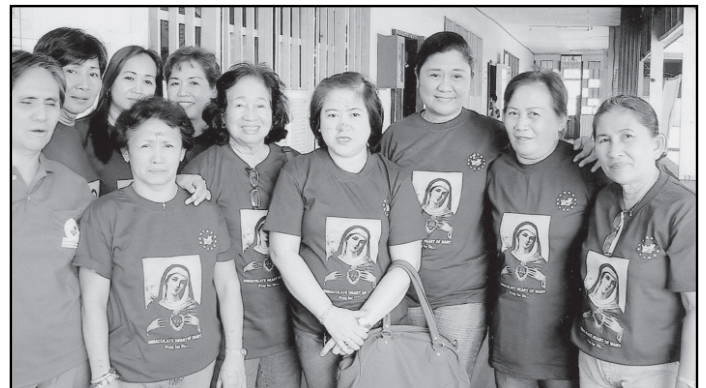
The Queen of Divine Grace Circle members in one of their activities.

The Circle plans to undertake more activities and projects for the formation of its members and in pursuance of the DMI missions.