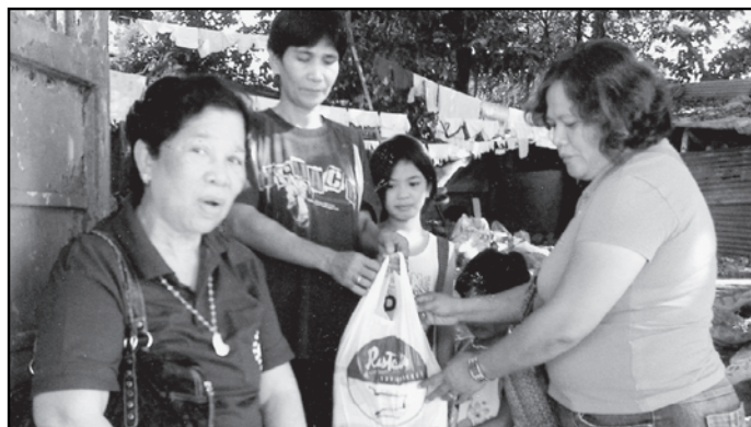
Circle members on one of their visits to their adopted family during which they brought groceries and other provisions for the children.