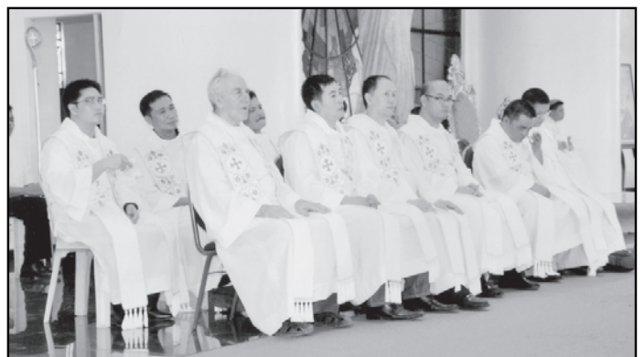
The parish priests of the Archdiocese of Zamboanga and DMI spiritual advisers who took part in the concelebrated Mass.