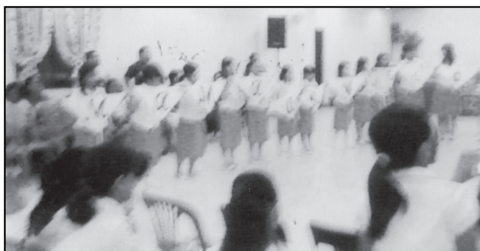
Investiture rites for new Squirettes of Mary members

The circlette has been conducting various activities for members' formation as well as outreach projects for mission areas of the parish, among which was the Christmas gift-giving for indigent children last December, 2009.