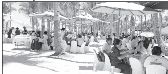
The delegates at South Palms Resort in Panglao