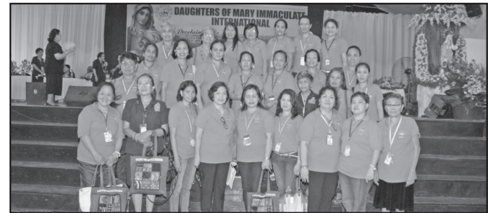
The hard-working Convention Working Committee of the host diocese, the Diocese of Tagbilaran.