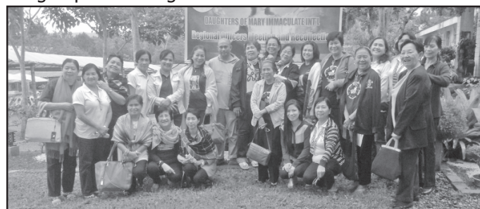
Participants in Region XII's Strategic Planning Workshop and Recollection held in Malaybalay, Bukidnon.

Region's future projects and activities.