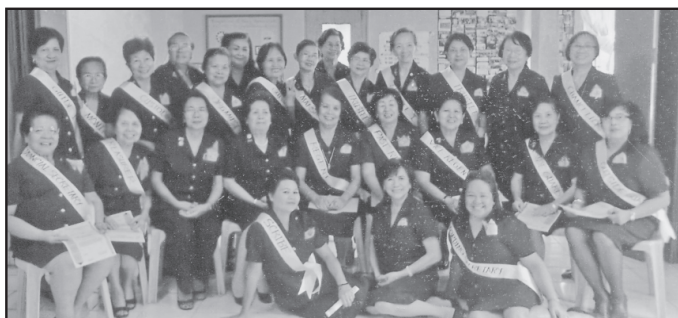
The Diocese of Paranaque Exemplification Team.