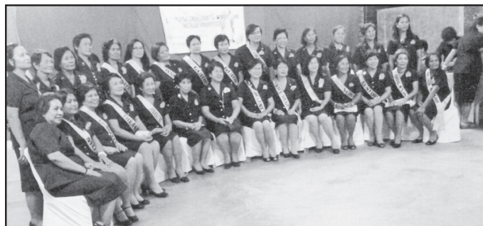
The charter officers and members of St. Catherine Circle.