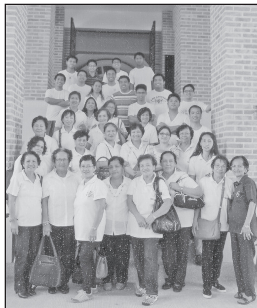
The DMI sisters of St. Vincent Ferrer Circle with the seminarians of Mary Help of Christians Theology Seminary.