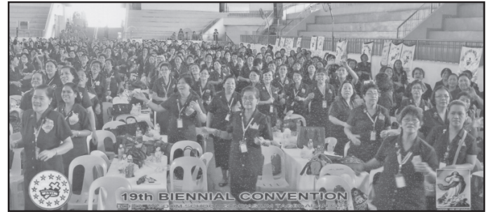
The convention delegates enjoy an ice-breaker.