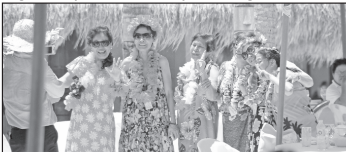
Hawaiian-garbed delegates get ready to dance to a live band.