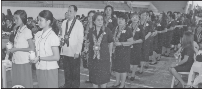
The International Officers and Board line up for the floral offering to Mama Mary during the convention opening ceremonies.