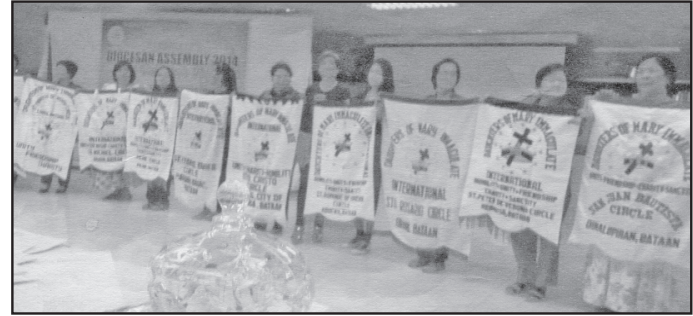
The Parade of Circles during the assembly's opening ceremony

Inspired by the empowerment of the laymen and challenged by the call of the Church to help the religious spread Christianity, the DMI sisters of the Diocese of Balanga held a Diocesan Assembly with the theme "DMII's Renewal of Commitment in the Year of the Laity".