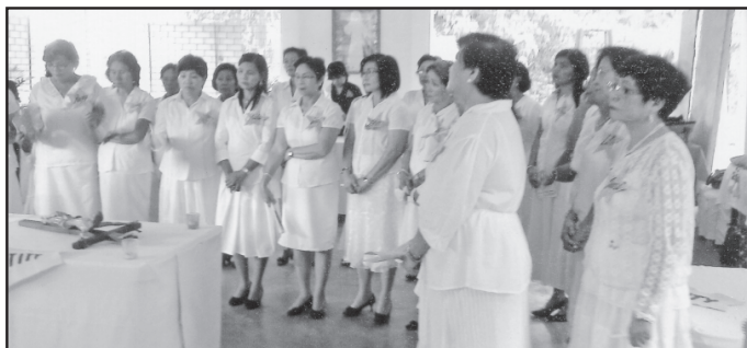
The charter members of St. Catherine of Alexandria Circle during the exemplification ceremony.