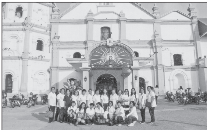
The DMIs at the facade of San Fabian Church.