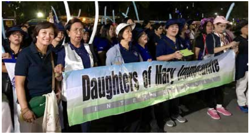
The DMI delegation during the Walk for Life at the Quezon Memorial Circle.

DMI sisters from Regions IV and V participated in the Walk for Life sponsored by the Sangguniang Laiko ng Pilipinas and endorsed by the CBCP. The event was highlighted by a Mass officiated by His Eminence Luis Antonio Cardinal Tagle. More than 300 DMIs joined other participants from other church/parish groups in walking around the Quezon Memorial Circle in response to the call by the Church to stand up for life.