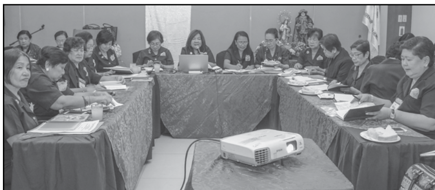
The Board meeting in session.

their plans and programs during their term. The programs and activities have been circularized to all circles in the country through their respective regional representatives. The mission chairpersons suggested that the projects and activities be carried out on the diocesan, vacarial and circle levels.