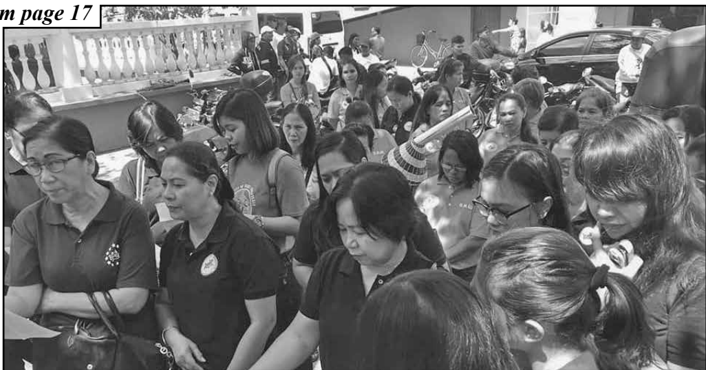
A special prayer for the unborn recited by parade participants caps the day's program.

Capping the day's activity was the recitation of a special prayer for the unborn by the participants at the area where an epitaph for the unborn is situated.