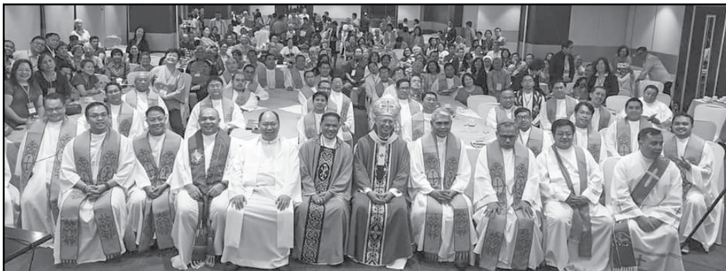
Members of the clergy with delegates who attended the Convention of the CBCP-Episcopal Commission on Family and Life in Cebu City.

Convention of the CBCP Episcopal Commission on Family and Life at the Bayfront Hotel in Cebu City. The 3-day conference was attended by about 400 representatives of various Catholic organizations all over the Philippines having apostolic work on family and life. Priests from Luzon, Visayas and Mindanao were in attendance led by four bishops – Archbishop