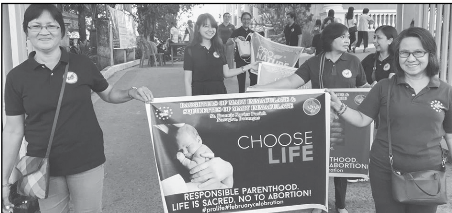
Parade participants carry posters and tarpaulins with Pro-Life messages.