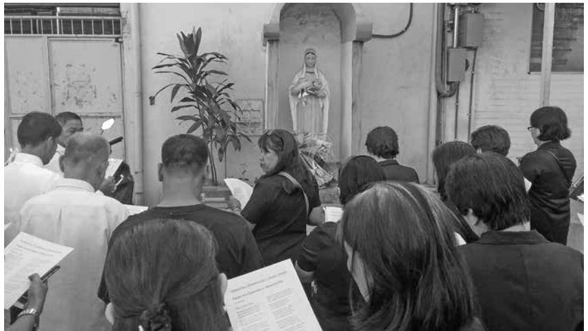
DMI circles all over the country offered Masses and prayers before the Tomb/Memorial for the Unborn and Aborted Babies on Feb. 17.

DMI circles all over the country were asked to offer a Mass for the Unborn and Aborted Babies in their respective parish churches on February 17 followed by a floral and candle offering at the Tomb or Memorial for the Unborn and Aborted Babies. In Region VII, the Our Lady of Peace Circle of Nasugbu, Batangas even held a parade where posters and tarpaulins with pro-life slogans were carried by the participants. (Please see related story on page 17.)