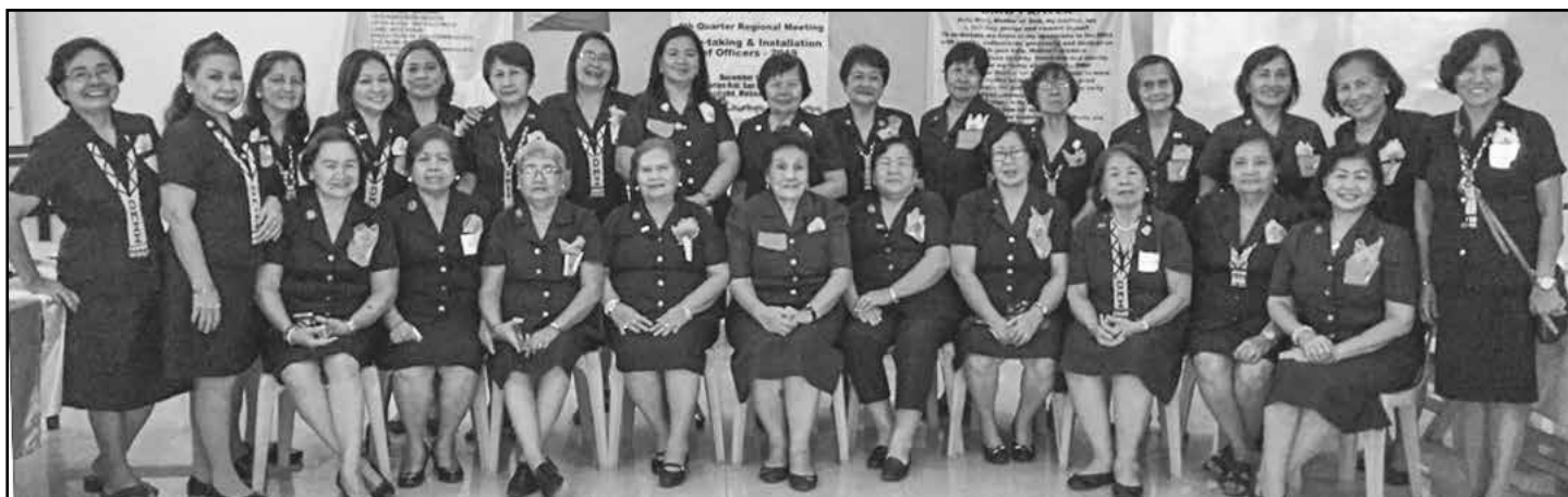
The newly-installed diocesan regents with the Region XIII officers.