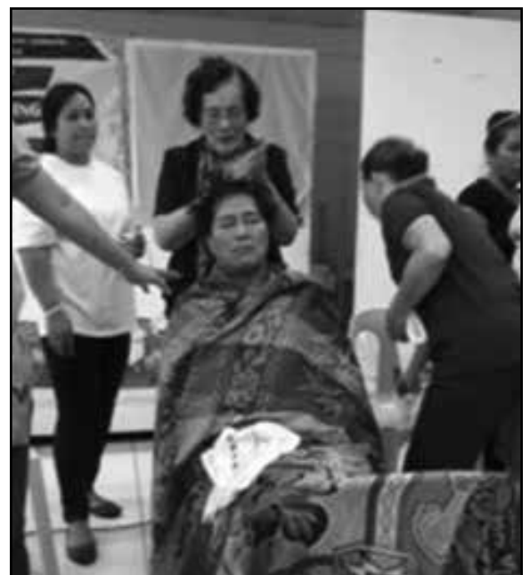
A hands-on exercise on massage and aroma therapy.