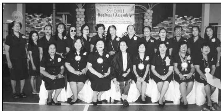
The assembly hosts, the DMI sisters of the Diocese of Sorsogon with their guests.