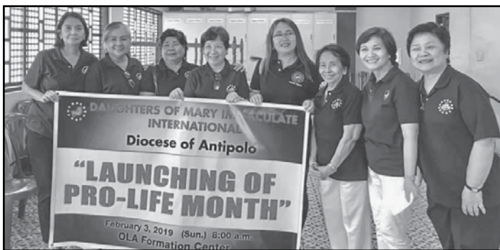
Launching of Pro-Life Month in the Diocese of Antipolo