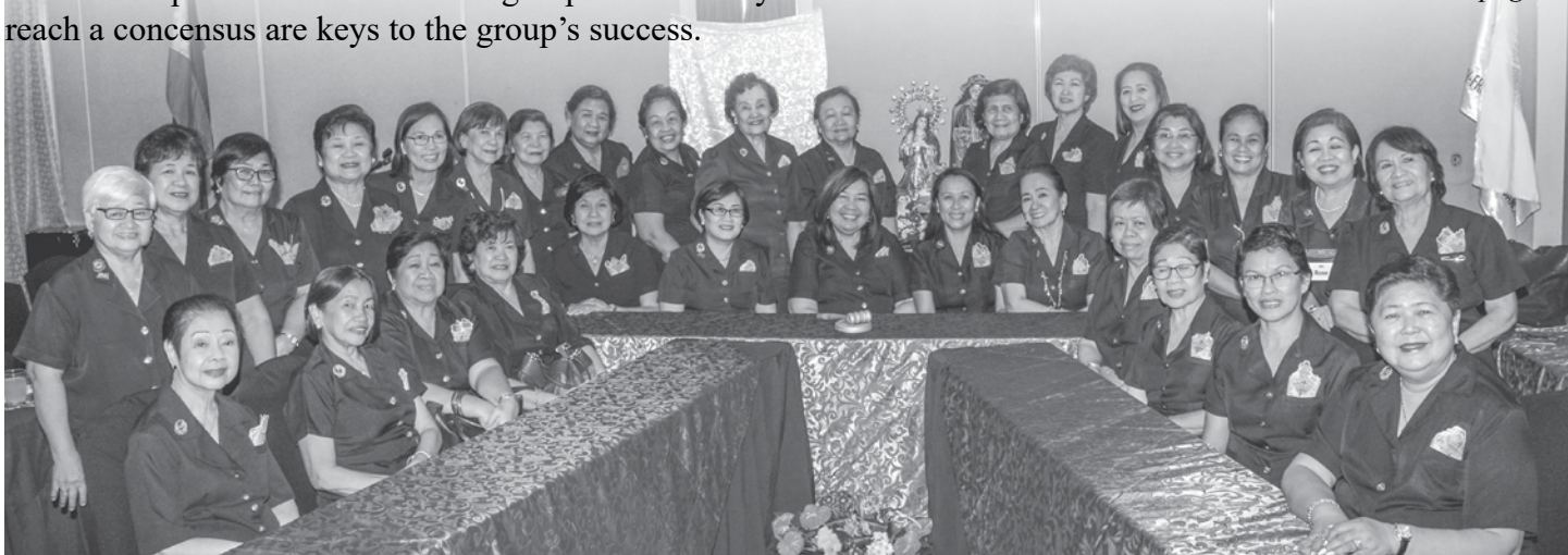
The DMII International Officers and Board take time out to pose for this group picture.