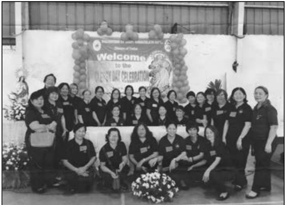
The Tarlac DMIs who sponsored the Clergy Day celebration.

present were given cash and special gifts.