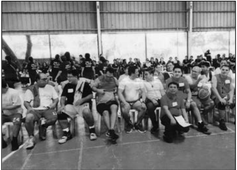
The priests get ready for their basketball game.

Prizes both in cash and in kind were given away to winners in the parlor games and raffle draws. All the priests who were