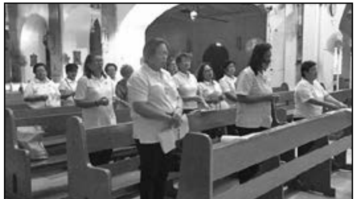
DMI sisters of Holy Mary Circle lead the 2000 Hail Marys prayers.

The Holy Mary Circle of the Vicariate of Sta. Maria I, Diocese of Malolos prayed the 2000 HAIL Marys on February 20, 2018 to start a spiritual activity for the Lenten Season at the La Purisima Concepcion Parish in Sta. Maria, Bulacan. The DMI sisters meditated on each mystery of the Holy Rosary, thus experiencing the peace of God through reflection on His Holy Word. There was spiritual deepening as they reflected on the mysteries of the Holy Rosary that chronicled the life