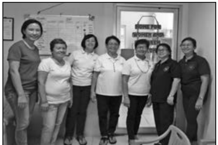
DMI sisters of Theresian Circle and volunteers from the Los Banos, Bay and Calauan Dental Association.