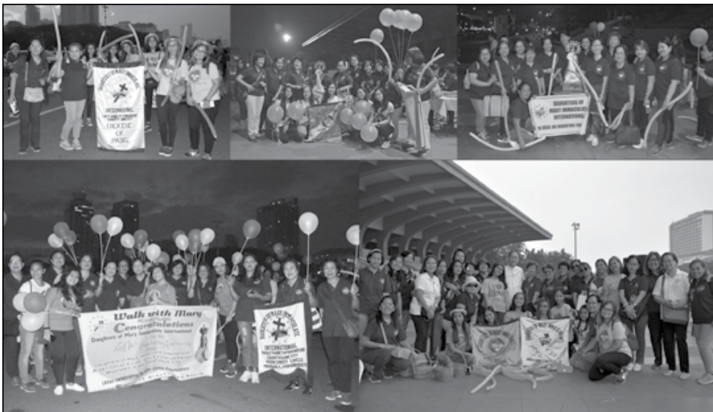
Circle delegations from the different dioceses during the Walk and Dance for Mary.