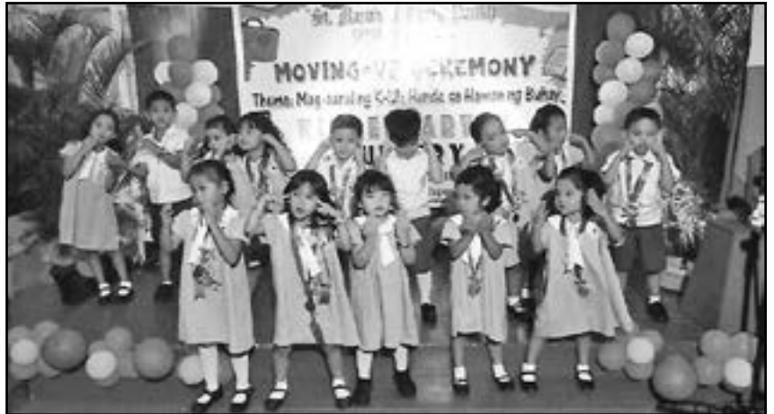
A group of pupils performs a song number during the program.