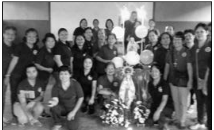
The Palawan DMI sisters before the Cathedral of the Immaculate Conception where the activity ended.

From the Diocese of San Pablo (Region VI)