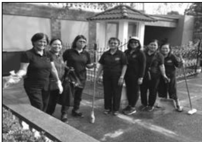
With brooms in hand, the DMI sisters get ready for the clean-up.