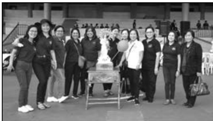
Members of the International Board flank Mama Mary's altar.