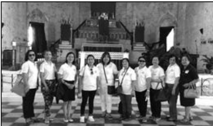
Before the altar of the Our Lady of the Assumption Church in Dauis