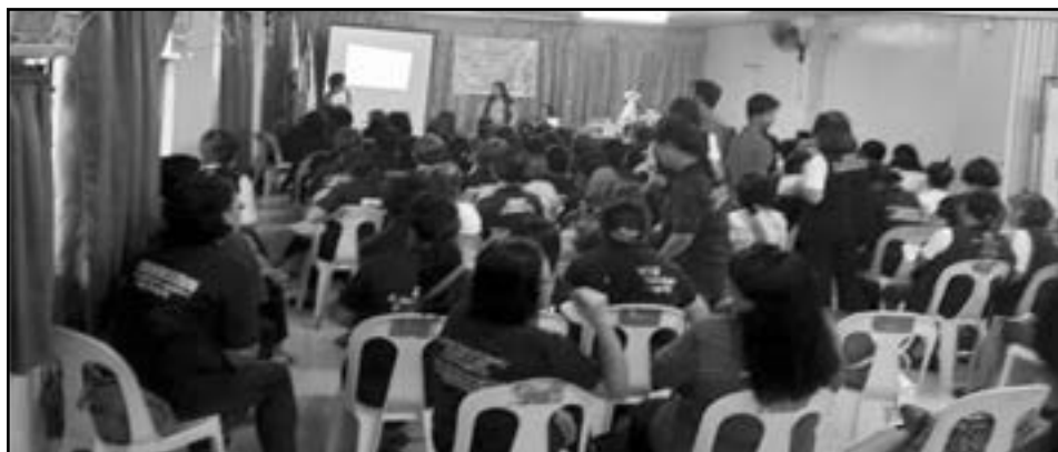
A group pf participants in the Leadership Training

The training was attended by 105 officers of Region XIV. An election of regional officers for 2019-20 was held in the afternoon. Chairpersons of the DMI missions