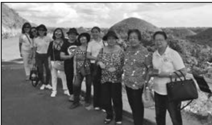
A group photo with the famous Chocolate Hills in the background.