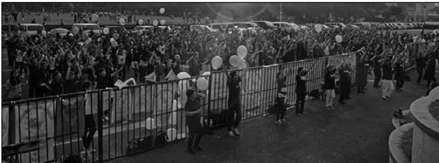
Over a thousand DMI sisters and Squirettes of Mary assemble in front of the Quirino Grandstand.