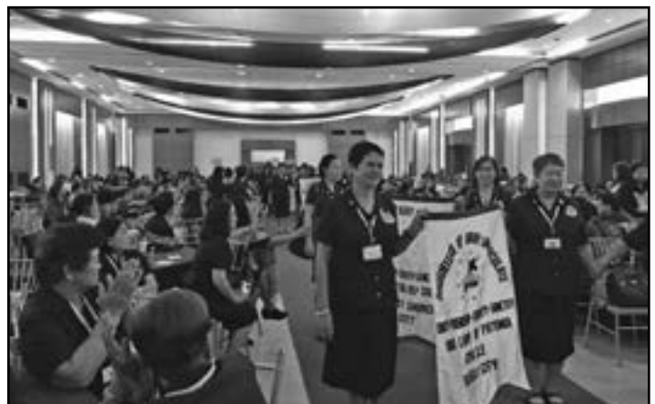
Circle regents carry their respective banners during the Parade of Circles.