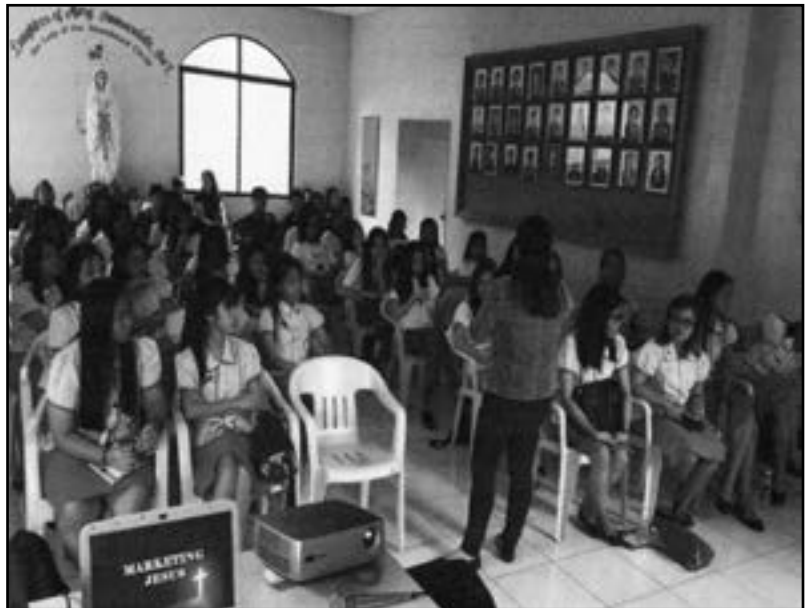
The Squirettes of Mary Immaculate who attended the forum listen intently to a speaker.

Preceding the forum was a Holy Mass. The SMTs, SMT lady counselors and other DMI sisters who attended the forum were from the Dioceses of Antipolo, Cubao, Kalookan and Pasig. It was part of the observance of Youth Welfare Day during the celebration of DMII Mission Week.