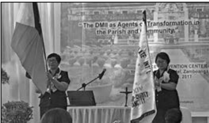
The entrance of colors during the opening ceremonies.