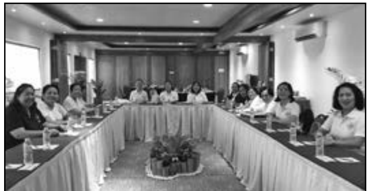
The special meeting of the International Board at the Managat Hall of Blue Water Resort.