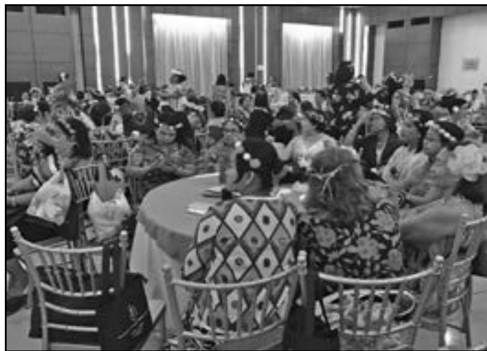
Assembly delegates during Fellowship Night.