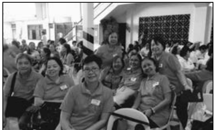
Participants during the symposium