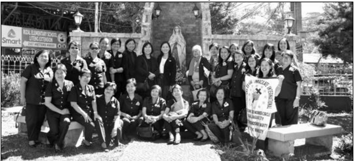
The 21st DMII Biennial Convention Organizing Committee takes a break during one of their meetings for this group photo.

There are so many sights to be seen in Baguio. And many delegates are expected to stay awhile to take in the view of what the Summer Capital of the Philippines has to offer as well as its cool weather and refreshing smell of pine.