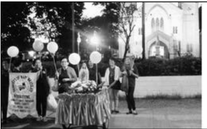
The participants assemble at the Puerto Princesa Amphitheatre to start the Walk.

An agape capped the activity. The food served were brought by the sisters to be shared with everyone who attended. The occasion was indeed a happy expression of love and sisterhood in the DMII.