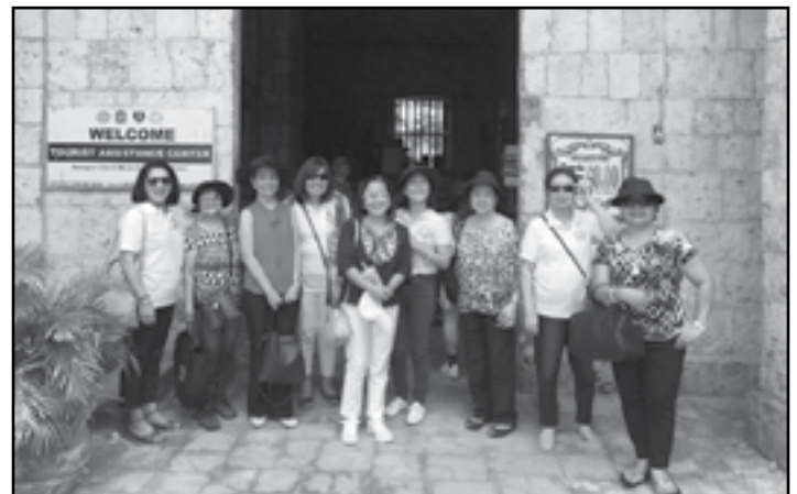
At the entrance of the Baclayon Church Museum.