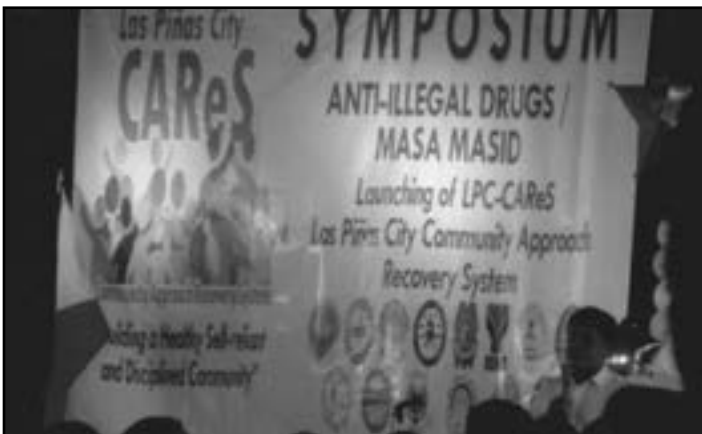
A tarpaulin streamer announcing the project.

is a community approach launched by Las Pinas City to promote a safe environment and disciplined community. It was a well-attended symposium during a parish assembly convened for the purpose.