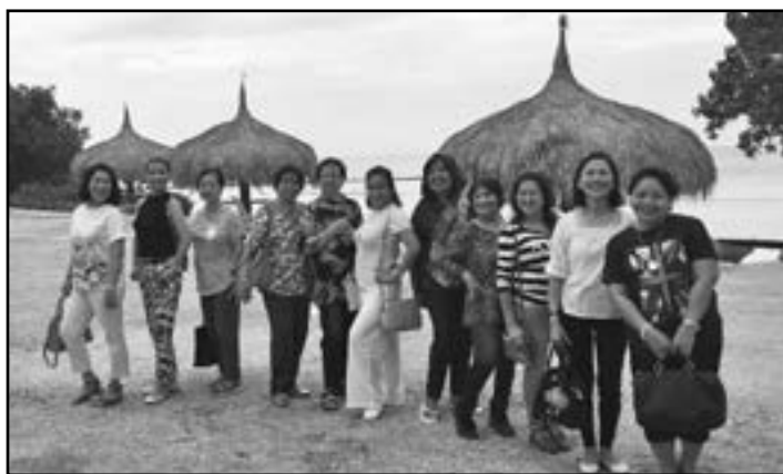
A stroll on the beach of Blue Water

Our Bohol sojourn served as a pilot for the pilgrimage tours that our International Regent is endorsing to encourage DMI sisters to go on pilgrimages not only abroad but also within the country. Each province has its own pilgrimage site/s and scenic spots to visit and local DMI circles can play host to other DMI circles from out of town. This is a very good opportunity for us to interact with other DMI sisters and learn, grow