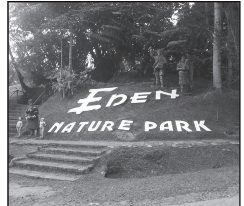
Eden Nature Park