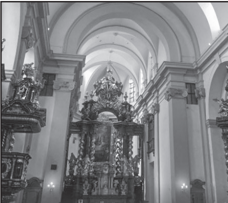
The interior of the Holy Infant Jesus of Prague Shrine

All these await delegates to the 20th DMI Biennial Convention. SEE YOU IN DAVAO!