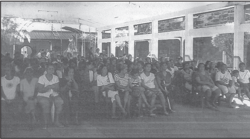
A short program at the Ultreya Hall of St. Dominc Parish preceded the gift distribution.