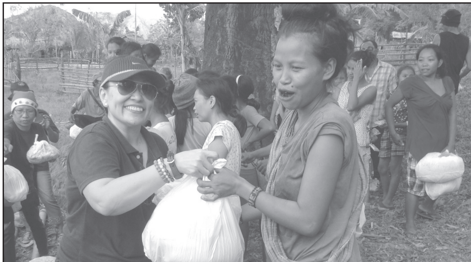
A gift-giving beneficiary in the Mangyan settlement in Manoot Rizal receives a gift package.

For participants of the outreach activity, it was a very fulfilling day, having shared the true spirit of Christmas.