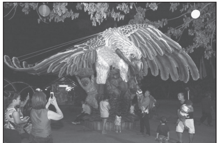
At People's Park, a giant eagle at its center has become a famous landmark.