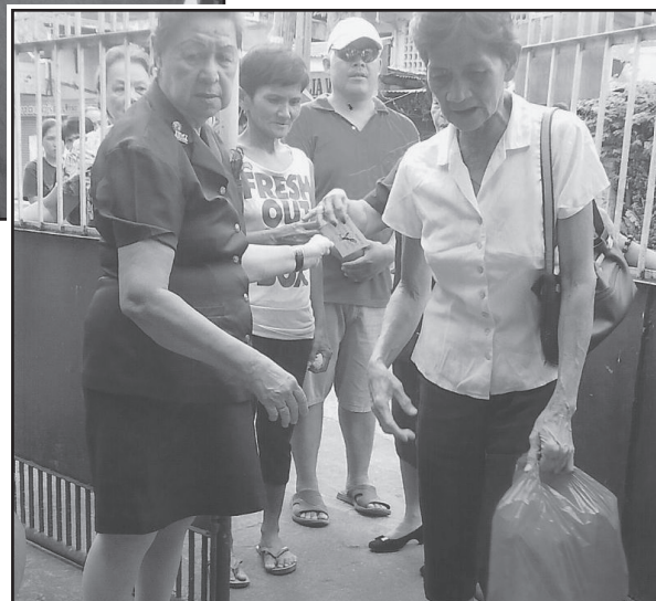
'Bundles of joy' are distributed to family-beneficiaries.