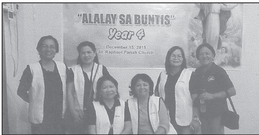
Some DMI sisters pose before the tarpaulin announcing the "Alalay sa Buntis" Project.

A counterpart kit was also given by the DMIs to each of the participants containing supplies they will need at childbirth.