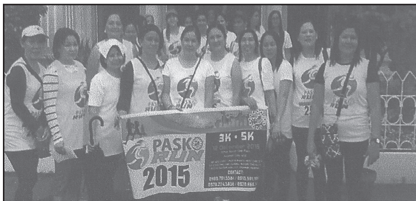
The DMI sisters of St. Dominic de Guzman Circle who spearheaded the ‘Pasko Run’.