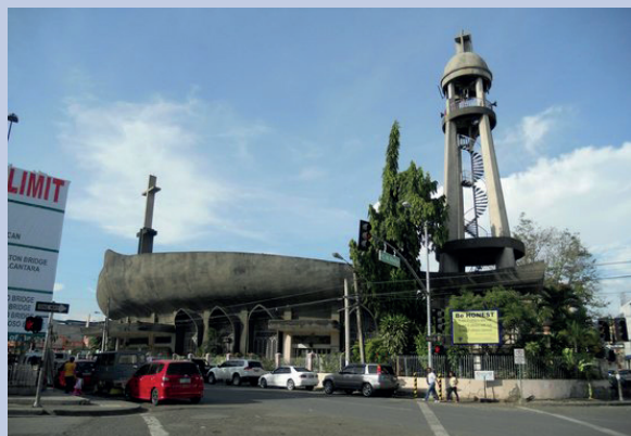
San Pedro Cathedral, the biggest church in Davao