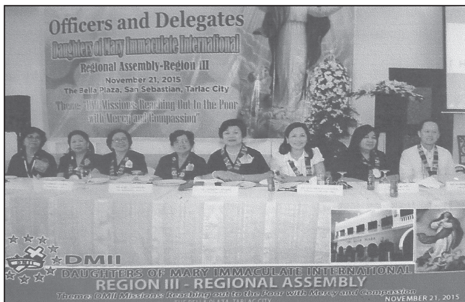
The presidential table at the Region III Assembly.