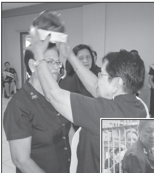
The exemplification of new circle members