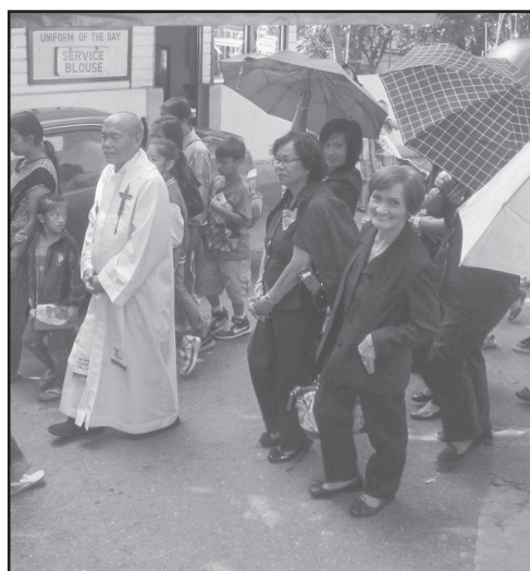
The DMI sisters with their parish priest on their way to St. Nino Chapel for their outreach activity.