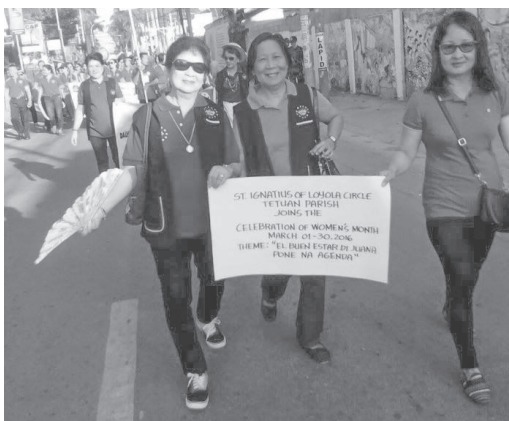
The marcha to Paseo del Mar

A Eucharistic celebration capped the day-long activity.