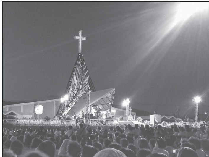
A lighted cross at the center of the IEC complex dominates the skyline at night.

The day-to-day activities at the Congress focused on inspiring morning readings and prayers, catechetical sessions on the Eucharist as the Source and Goal of the Church's Mission, faith testimonies which deepened my faith and increased my love for God. Regularly capped by a Holy Mass, I experienced and felt God's loving desire to feed His people.