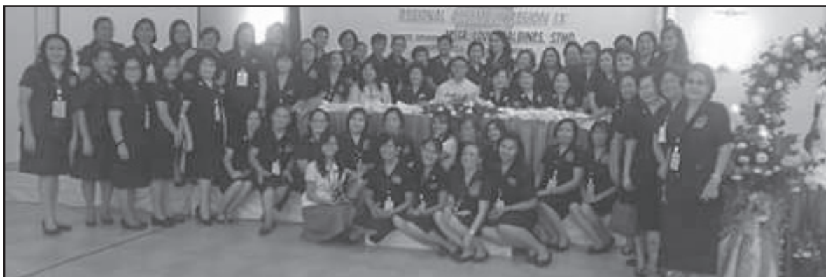
The DMI sisters of the Diocese of Bacolod, assembly hosts.