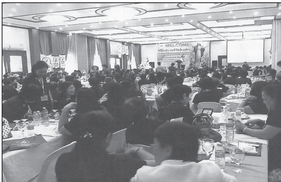
The assembly delegates in session.

mission chairpersons presented their concerns, discussed their projects and activities and urged circles to benchmark from other circles to be able to pursue worthwhile activities.