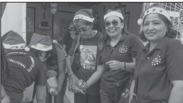
The DMI sisters get ready for the gift distribution.