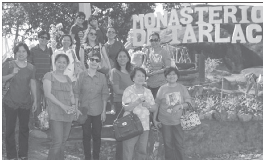
The pilgrims pose in front of the gate of Monasterio de Tarlac.

The trip was well worth it for the pilgrims enriching their spirituality as well as strengthening the bonds of friendship within the St. Joseph the Worker Circle.