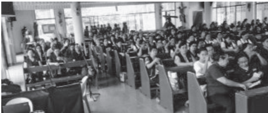
The recollection participants