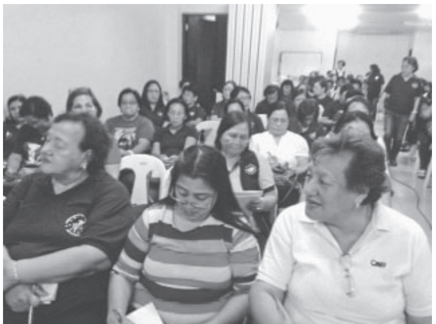
Region XIV workshop participants