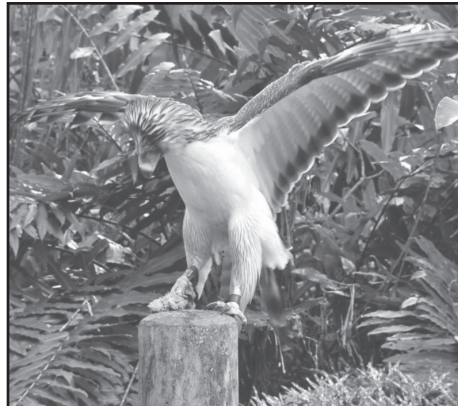
Philippine Eagle Center in Malagos