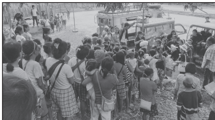
Gift are distributed to children in Sitio Imbarasan.