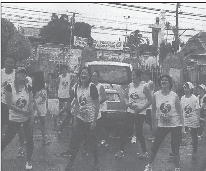
Zumba-dancing in the rain.

and running which are among the cheapest means of maintaining good health, and second, as a fund-raising activity the proceeds of which will be used to buy Noche Buena packages for less fortunate families in their parish.