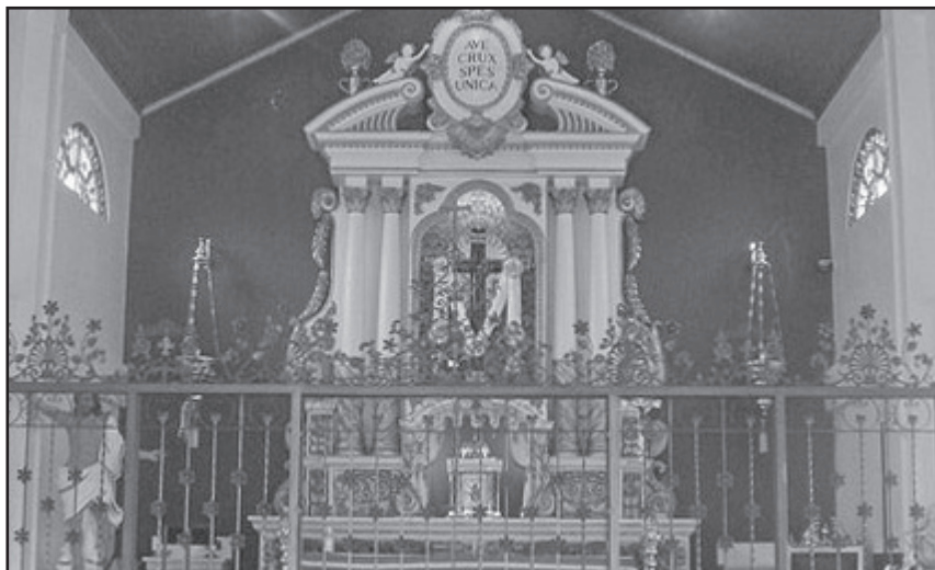
The altar of the Monastery Chapel with the reliquary containing the relic of the True Cross.