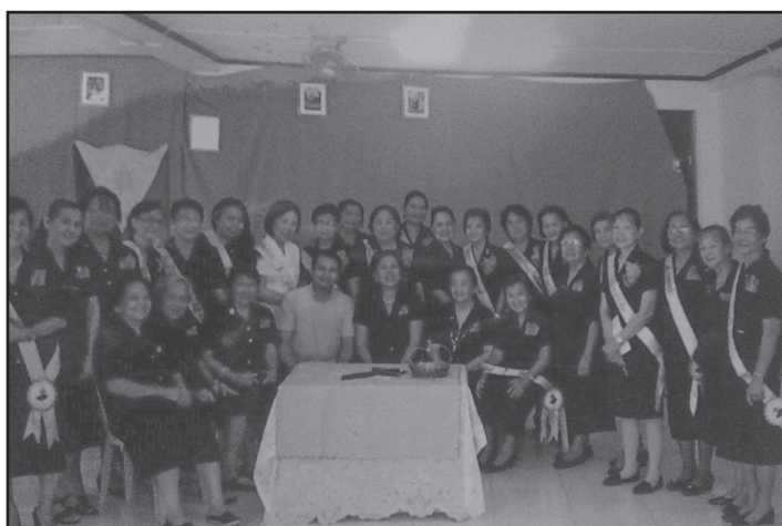
The officers and members of the St. John the Baptist Circle.