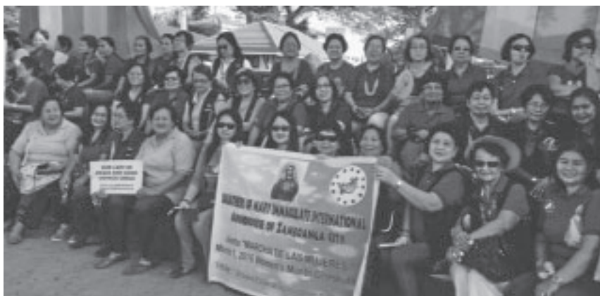
The DMI delegation during the march