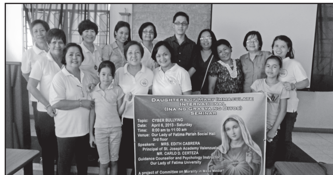
A group photo taken during the symposium