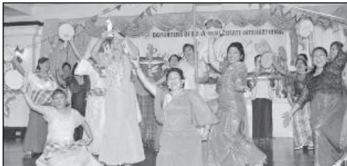
The DMI sisters of St. Thomas of Villanova Circle, Miagao, Iloilo present a dance number.