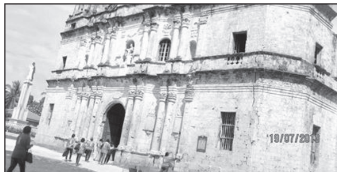
The parish church of Loon is historically known as the oldest church in Bohol.