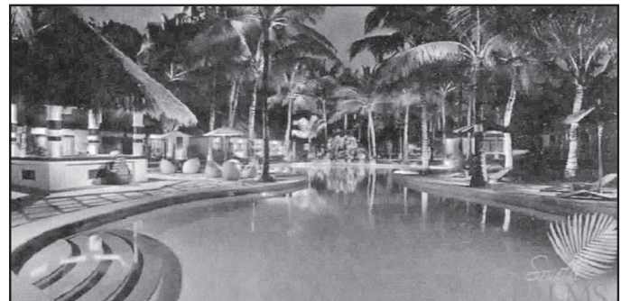
Patio and poolside of the South Palms Resort in Panglao Island, Bohol