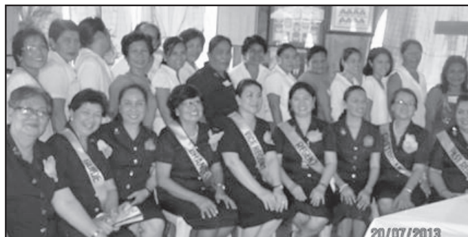
The charter members of Our Lady of Light Circle and their newly-installed officers.