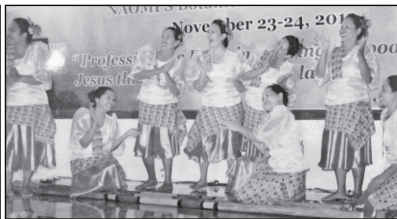
The Guardian of Mary Circle's dance presentation won first prize in the contest for Best Presentation.

them about what we are doing. Go and evangelize the young women. Teach them about pro-life. Teach them to uphold life at all times," she exhorted. On the assembly's theme, she said, "As we end the Year of Faith and usher in the Year of the Laity, we are challenged to shift our focus from faith to service. Go out of your way to help our sisters in need. Help our sisters in Tacloban City. Don't stop working in the vineyard of the Lord."