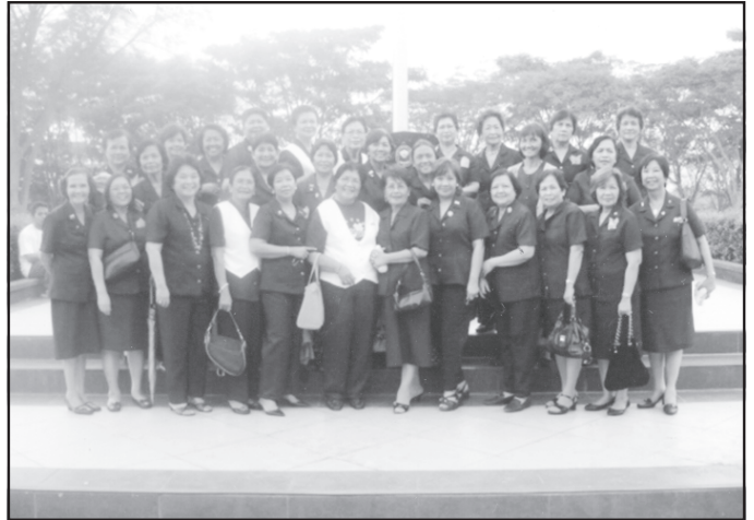
The Diocese of Paranaque delegation poses for this photo at the Batasang Pambansa driveway.

The DMIs' going to Congress bore some fruit nonetheless. The organization became visible as an advocate of pro-life and anti-RHB in support of the stand of the Catholic Church.