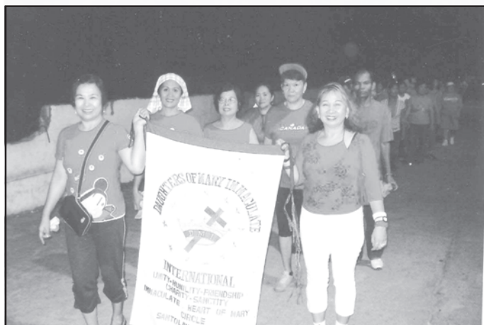
DMI members proudly display their circle banner during the "Alay-Lakad Para sa Puso" on Valentine's Day.

On February 14, 2009, the Immaculate Heart of Mary Circle of Maysilo, Malabon City celebrated Valentine's Day earlier than most.