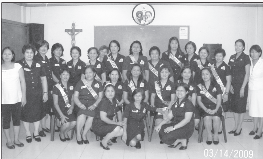
The officers and members of the St. Gabriel of Our Lady of Sorrows Circle