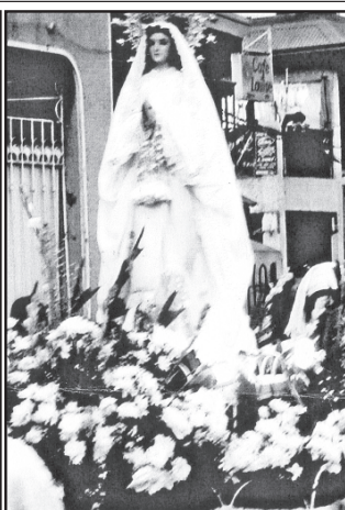
The image of Our Lady of Lourdes during the procession.