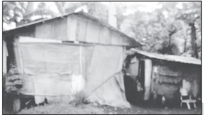
The family's shanty before receiving DMI's donation of cement and hollow blocks.

who were not yet baptized received the sacrament of baptism with all expenses shouldered by the circle.