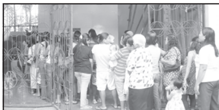
DMI sisters man the registration table as clients arrive to avail of free medical consultation and treatment.

The Sto. Nino of Tacloban Circle and the Knights of Columbus Council 3171 of Sto. Nino Parish, Tacloban City organized two joint medical missions on December 14, 2008 and February 22, 2009 at the Parish Social Hall.