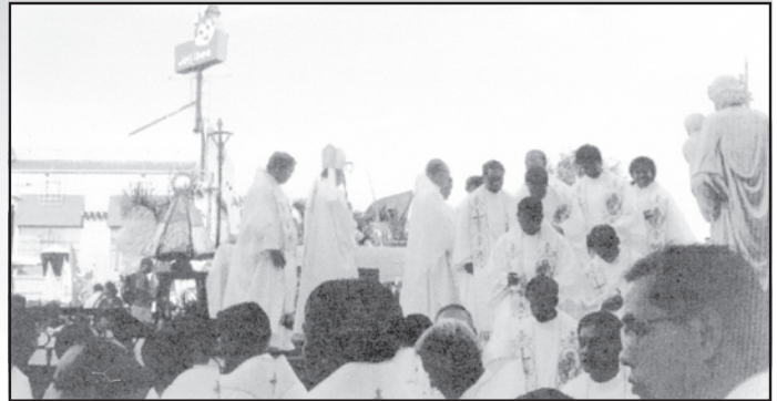
Members of the clergy of the Diocese of Balanga led by Bishop Socrates Villegas at the prayer rally.

Bataan is only 35 kilometers wide and Manila is not more than 30 kilometers away from Bataan's western shores. The northeasterly wind ( amihan ) normally blows through Bataan toward Vietnam. But the southwesterly wind ( habagat ) blows from the opposite direction toward the north and east placing residents of Manila,