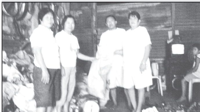
Circle members with the materials collected from their environment project being readied for eventual disposal/sale.

The members of the Immaculate Heart of Mary Circle of Maysilo, Malabon City concluded last March 24, 2009 an environment project they called “Friends of the Environment, Recycle of Waste Materials Toward Earth Cleanliness”.