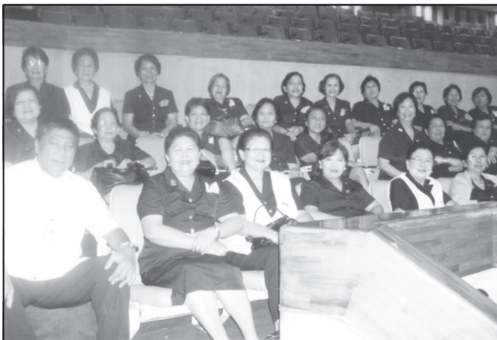
The DMI members are shown seated at the gallery of Congress waiting for the hearing on HB 5043 to begin.

The group plans to go to Congress once more when the hearing on HB 5043 resumes. And more are expected to come.