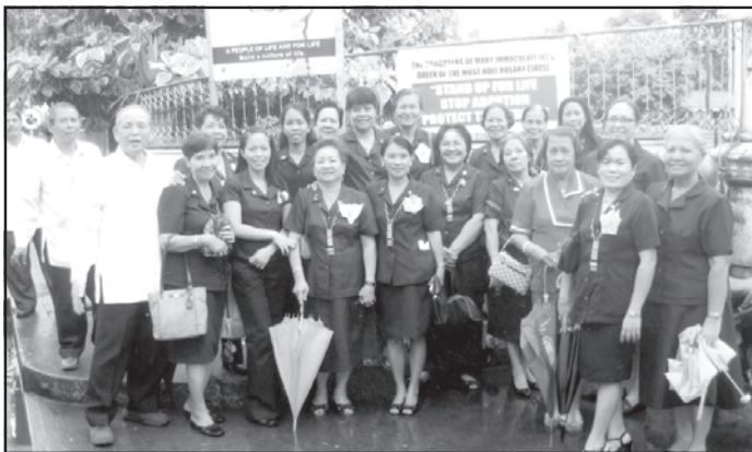
The DMI sisters and KC brothers pose before a Pro-Life tarpaulin poster put up in response to the National Pro-Life Campaign vs. HB 5043 launched by the DMI International Pro-Life Committee.