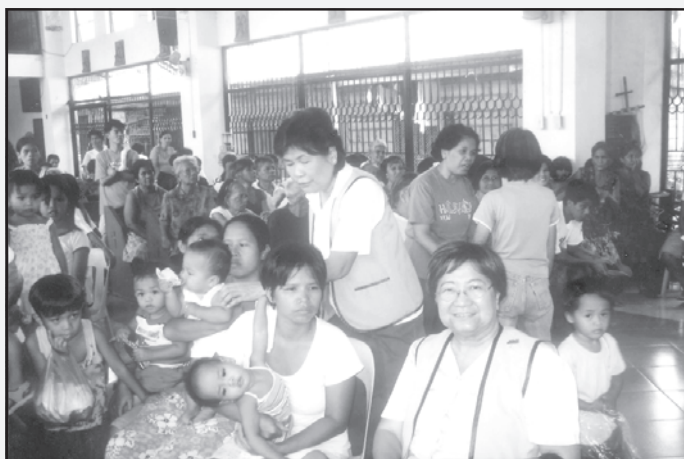
The Medical Mission team attends to patients seeking consultation and treatment.

The boat ride was a new and exciting experience.. As they ended the day, each felt very fulfilled realizing that even in their little way, they had been able to help the people of Talim Island.