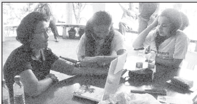
"Alay sa Puso" provided free ECG and FBS testing.