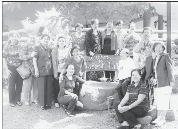
Members of the International Board and committee chairpersons at the Visioning and Team-Building Workshop in Tagaytay City.