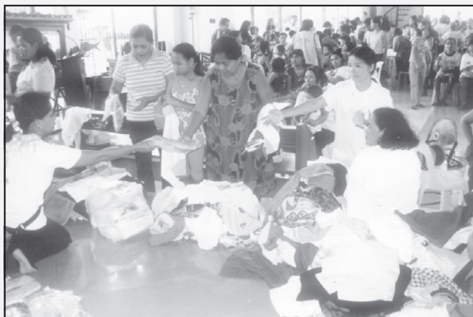
The DMI sisters get ready to distribute the clothing and slippers they brought as gifts to the people of Talim Island.