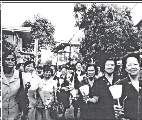
DMI members with other parishioners attending the procession.

T he Our Lady of the Abandoned Circle in Marikina City marked the Feast of Our Lady of Lourdes last February with a series of activities which began on February 2 nd with daily novenas at the Grotto located at the Marikina River Park. Culminating the celebration was a Holy Mass on her feast day, February 11 after the recitation of a living rosary.