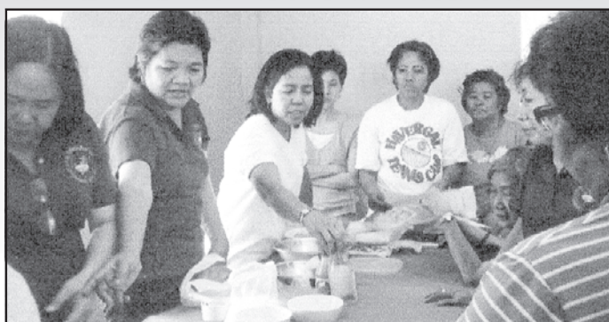
Tocino- and longanisa-making and bangus-deboning demonstration