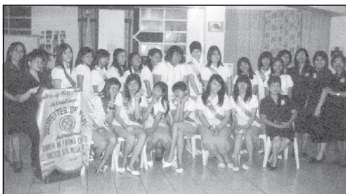
The newly-exemplified Squirettes of Mary members