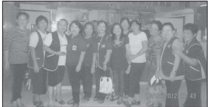
With the host DMIs in Bislig