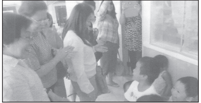
Interacting with the children at an orphanage that the group visited