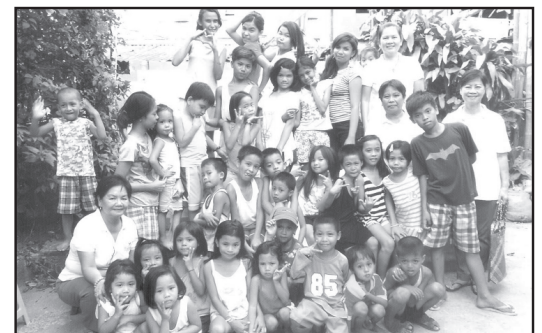
The DMIs of San Jose de Navotas Circle with the children of Barangay Bacog

Indeed this outreach activity of the San Jose de Navotas Circle provides "food for both the body and soul".