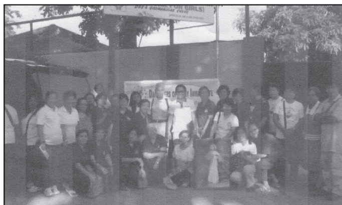
The Sto. Nino de Molino Circle officers and members with the staff of Bahay Tuluyan