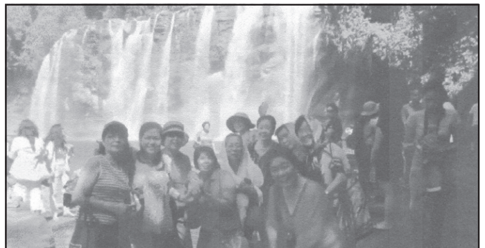
The group with the Tinuy-an Falls in the background