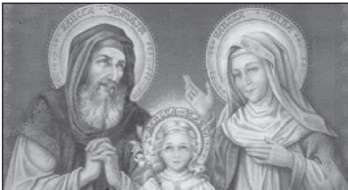
Mary with her parents St. Anne and St. Joachim

God gave her to understand that she was to bring up her daughter with all motherly love and care