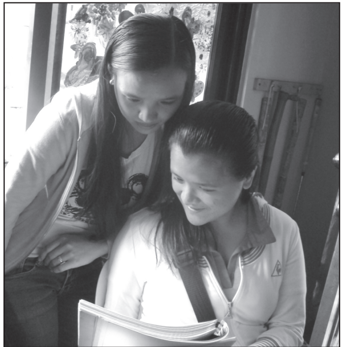
Two young ladies are engrossed in a copy of "Mr. God, This is Anna".

But the Our Lady of Atonement Circle shall not stop here! Its plans include an extension of the "Good Book Corner" into endeavors which will cover the other mass media, such as the establishment of a "Good Movie Club" as well as workshops on TV Censorship Classifications, Internet Vigilance and "Art vs. Pornography". With the Blessed Virgin Mary's guidance, it is hoped that these works will grow and take root – bearing fruits by instilling the proper knowledge in making informed, appropriately discerned and enlightened media choices among Baguio City's citizenry.