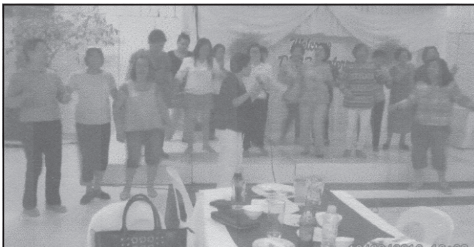
The group performs a lively action song during Fellowship Night at the Paper Country Inn in Bislig.