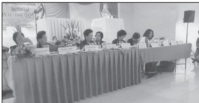
The presidential table of the Region IV Assembly showing the DMI International and Region IV officers