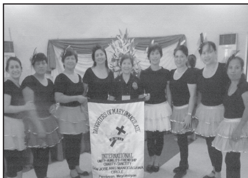
Members of the San Jose Ang Manggagawa Circle who performed a lively intermission number.