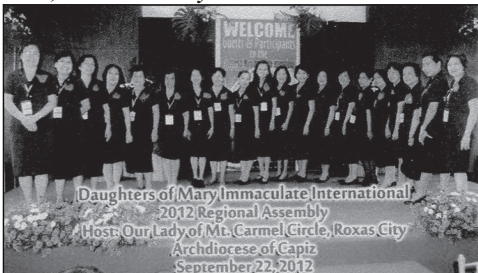
Officers and members of Our Lady of Mt. Carmel Circle, assembly hosts.