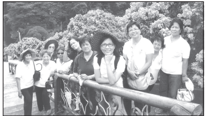
The sisters climb the stairway with more than 100 steps leading to La Mesa Dam.