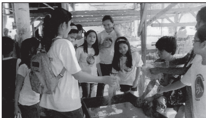
The Squirettes watch how rope is made out of coconut husks.

The circlette regularly holds fund-raising