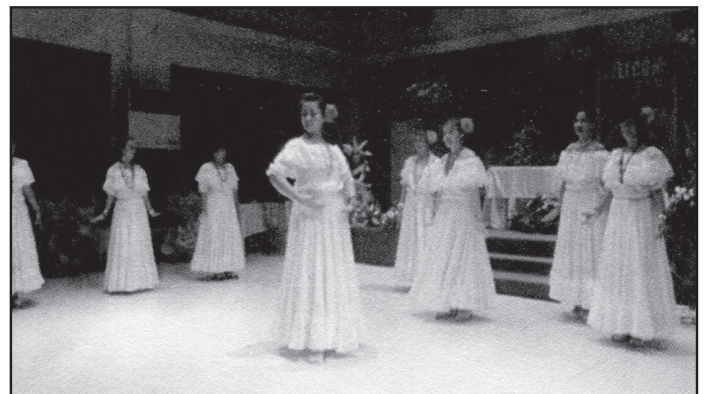
Dance presentation of the Sto. Nino de Kalibo Circle, first prize winner.