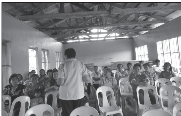
Participants in the Values Formation Seminar listen intently to the resource speaker.

The participants were grateful for this parish initiative, realizing during the seminar that the quality of the organization's products largely depends on the quality of life of the organization's members.