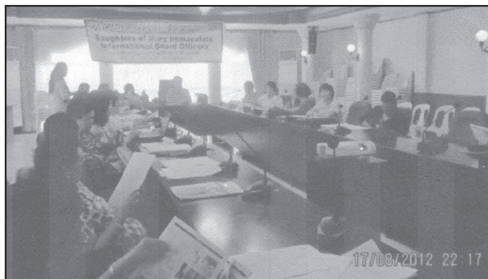
The International Board in session at the Board Room of the Provincial Capitol.

is able to reach and know the concerns of his constituents. Dinner (of crabs, prawns, lechon and ginataang langka among others) was at their residence. We spent the night at a nearby hotel owned by the Pimentel family.