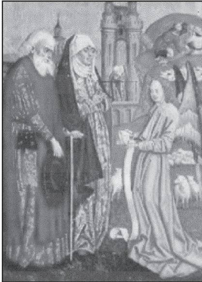
An angel announces the birth of Mary to St. Anne and St. Joachim.

according to the Divine Law. And at the very same moment on another farm near Nazareth, an unusually pious middle-aged bachelor was also praying for God's help in choosing a wife. Although