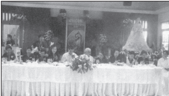
The presidential table during the Region IX Assembly with the DMI officers and special guests Capiz Governor Victor Tanco, Sr. and Roxas City Councilor Matthew Viterbo.