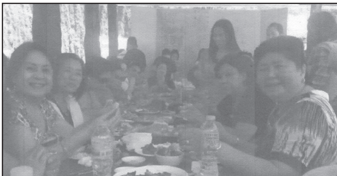
Lunch (a feast really!) at the Hinatuan Enchanted River