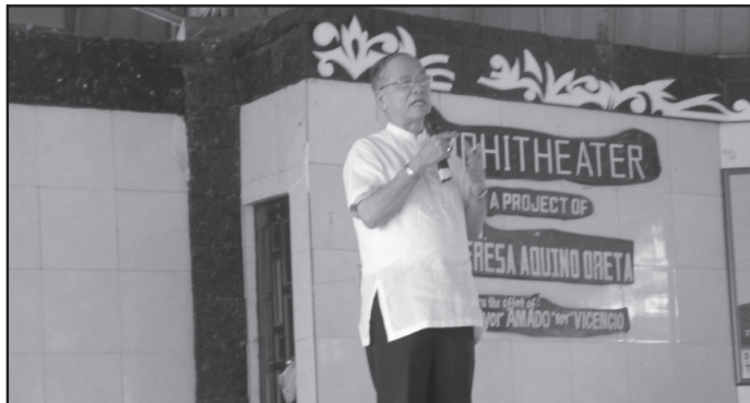
Bishop Deogracias Iniguez of the Diocese of Kalookan addresses the Family Day participants