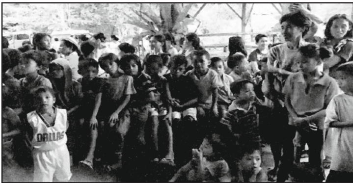
The families of Sitio Tabon eagerly await the arrival of the DMI sisters.

The group pursued the outreach project despite warnings from some barangay folks about the presence of members of the New People's Army in the remote sitio. To show their appreciation, songs were rendered by the children of Tabon while food was being served.