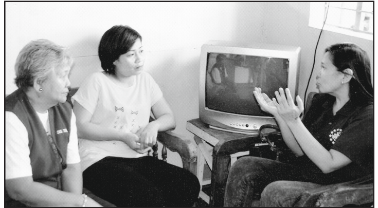
A counseling session being conducted by DMI sisters with an inmate's wife

The San Jose Circle of San Jose City, Nueva Ecija sponsored a Holy Mass at the BJMP facility in San Jose City on October 30, 2014 as a culminating activity of National Correctional Consciousness Month. Counseling was also provided by the DMI sisters for the visiting wives of the inmates for the purpose of inner healing. The counseling sessions helped to strengthen the mothers in facing the challenges that confront them and their children who are currently fatherless. The sisters brought snacks served after the Mass.