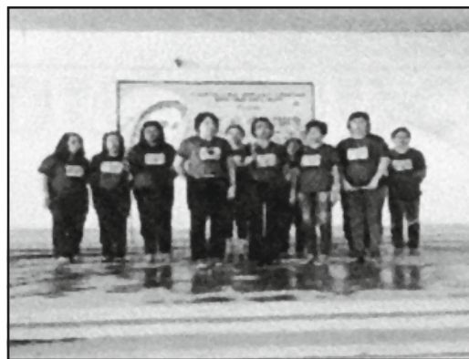
The symposium opened with the Circle members' doxology.