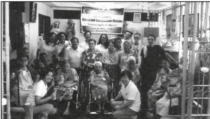
The residents of Kanlungan ni Maria with the sisters of St. Paul of the Cross Circle.

The St. Paul of the Cross Circle of the Diocese of Antipolo conducted a mercy and compassion mission to the residents of Kanlungan ni Maria in Antipolo City. The DMI