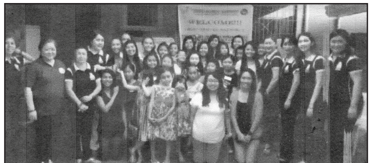
The members of the Our Lady of Divine Grace DMI Circle and SMI Circlette during the SMI circlette's first assembly for 2015.