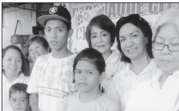
Recipients of Christmas baskets with some DMI sisters