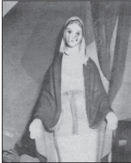
The image of the Blessed Mother shedding tears of blood.