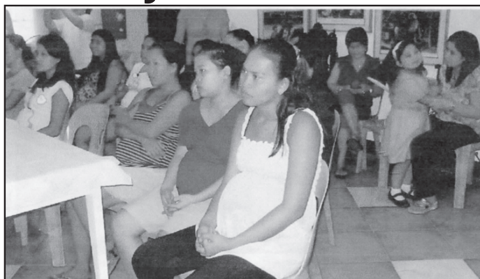
The DMIs of St. Raphael the Archangel Circle and the seminar participants.