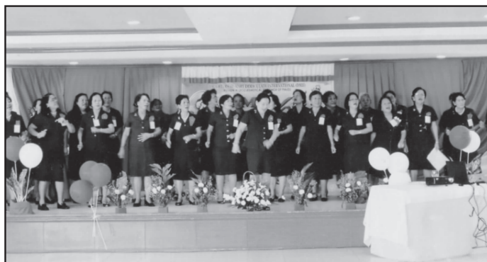
The opening song number by the host circle, Julio Cardinal Rosales Circle