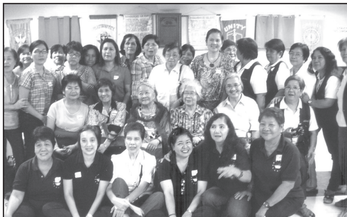
The lolos and lolas with DMI sisters of the Diocese of Kalookan. The Super Lola is shown seated third from left.

Each of the circles in the Diocese invited four to five lolos and lolas as the day's honorees. There were songs and dances and poetry reading by the guests and some DMI sisters themselves. Highlighting the event was the selection of a Super Lolo or Lola . An 85-year-old lola who won the title said she was overwhelmed by the experience as it was the very first time in her life that she was called "super" and