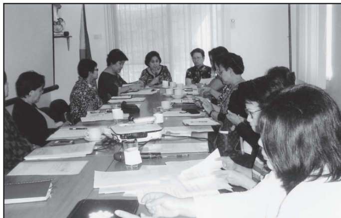
The DMI International Board in session