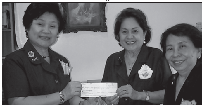
From Region V