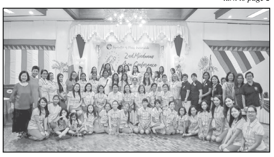
The conference delegates in a group photo